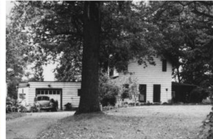
WHS, WI Architecture and History Inventory, Ref #115539 (1982)

Staff Recommendation: Staff recommends a finding of historic value related to Madison's vernacular architecture, but that the building itself is not itself historically significant; and that the site has historic value as a human burial site significant to the Ho-Chunk Nation (Waunona Mounds, DA-1403, BDA-1403) and will need to secure a Request to Disturb before ground-disturbing work.