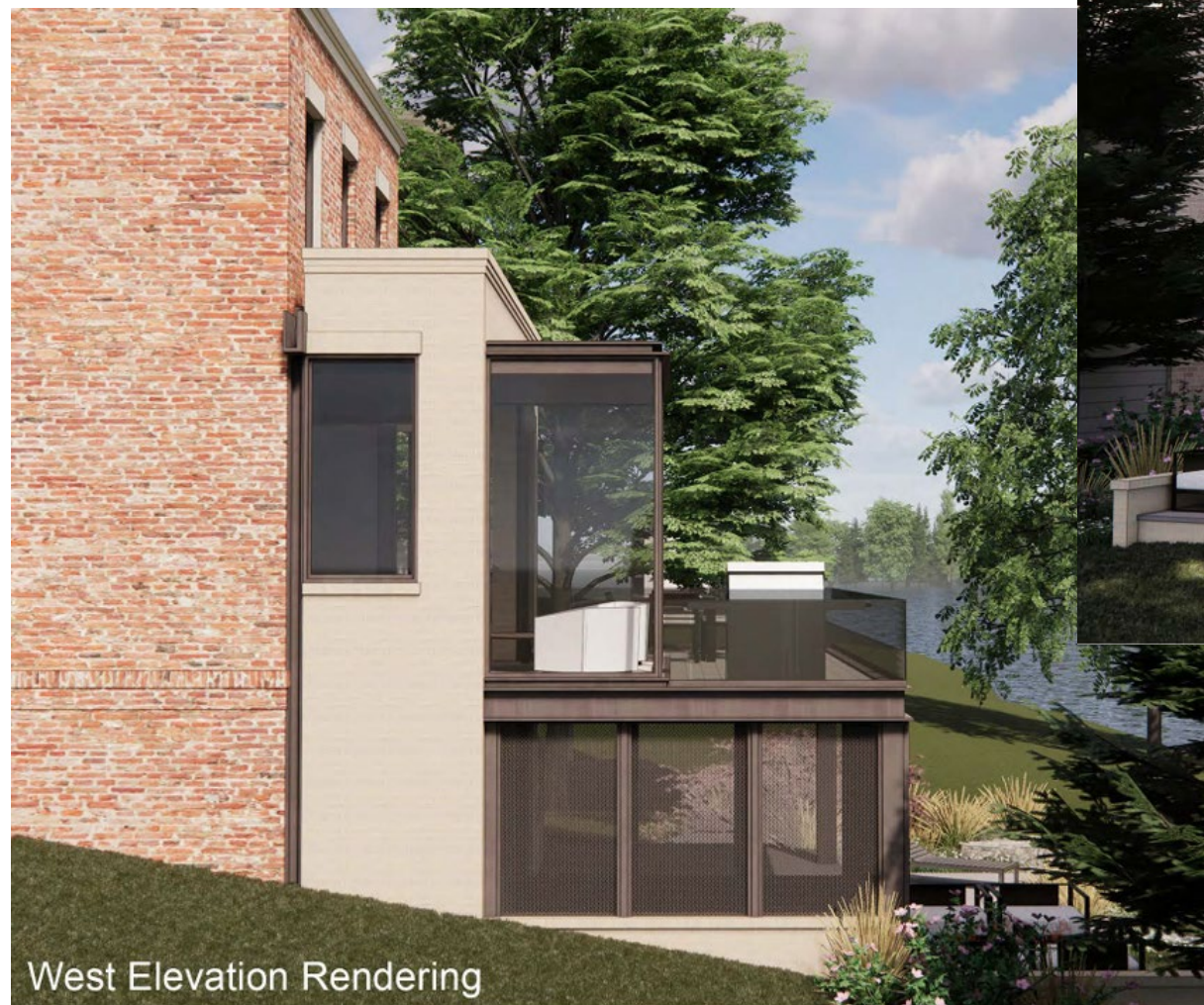
West Elevation Rendering