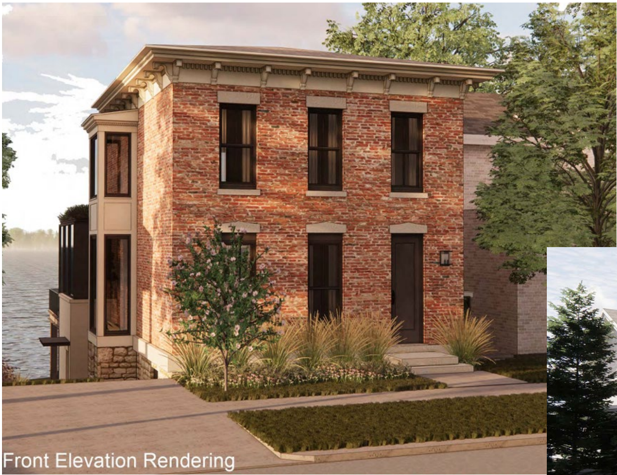
Front Elevation Rendering