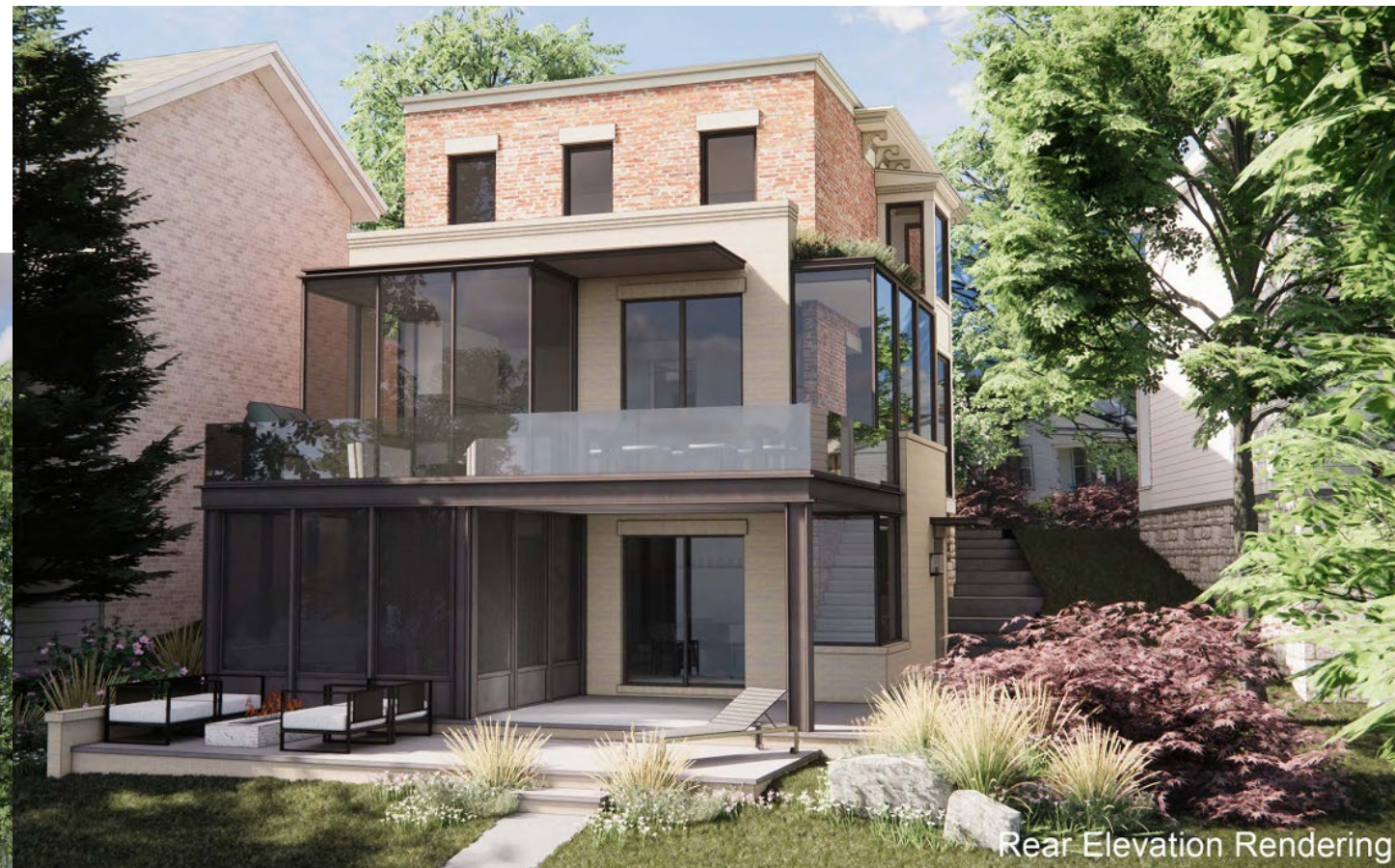
Rear Elevation Rendering