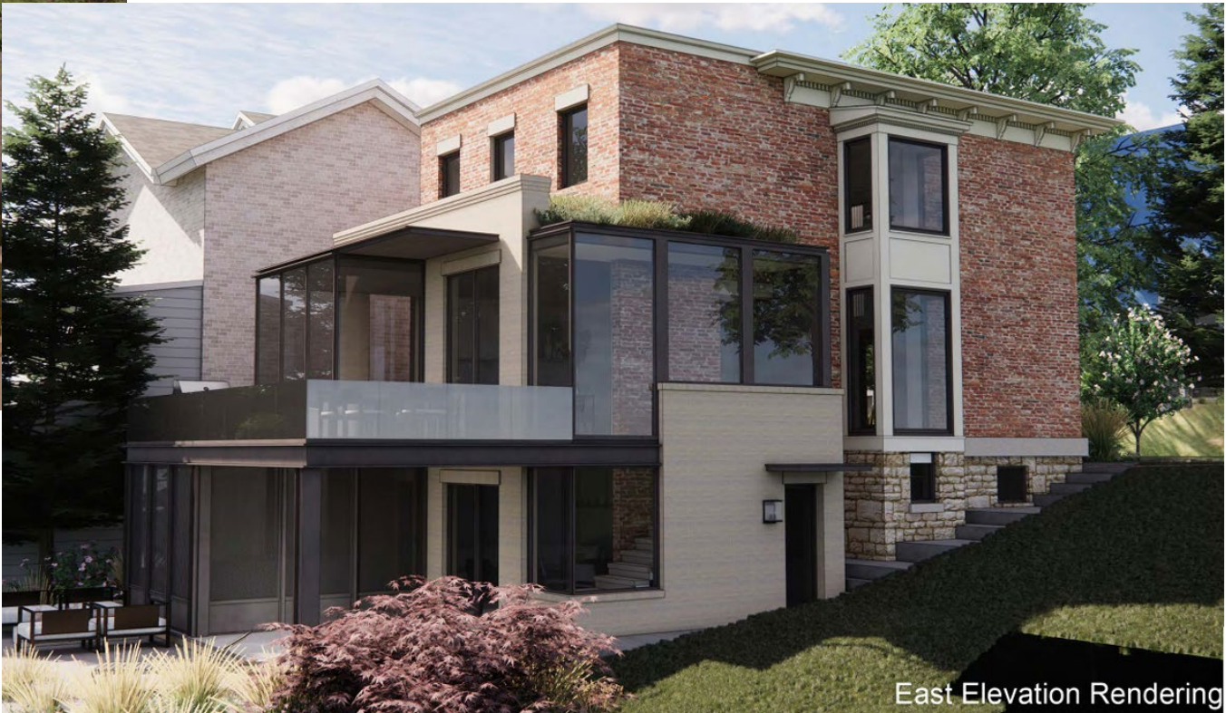
East Elevation Rendering