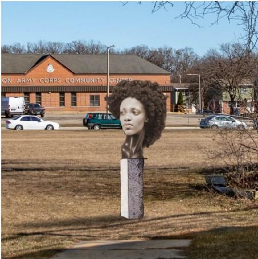
Design 01: Faith Moves Mountains

Black & white stone, maybe bronze Estimated 30" tall + base height