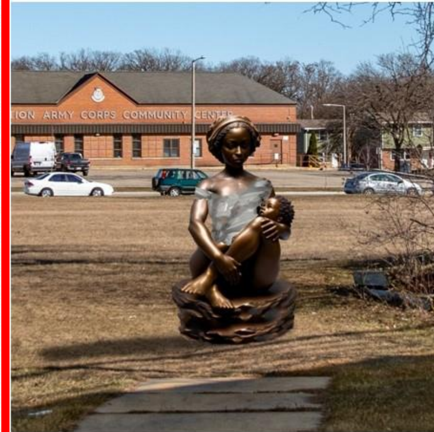
Design 03: Untitled

Bronze on a stone or concrete pedestal Estimated 5-6 ft tall, 2-3 ft wide