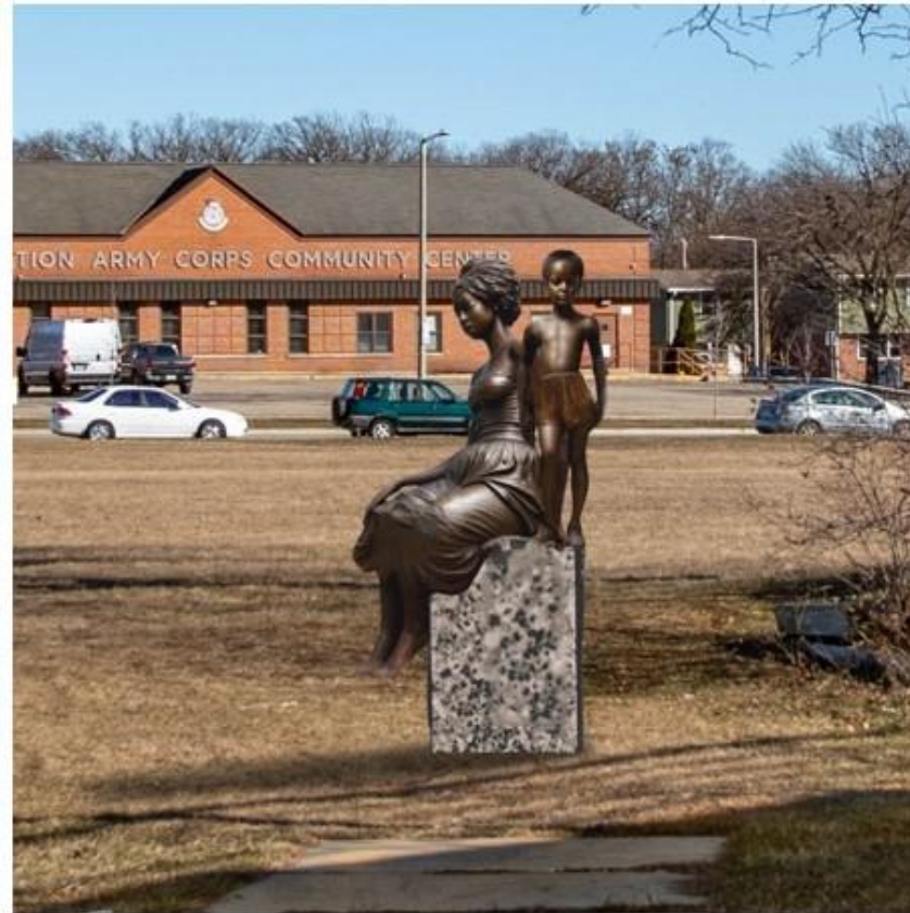
Design 02: Untitled

Black & white stone, maybe bronze Estimated 30" tall + base height