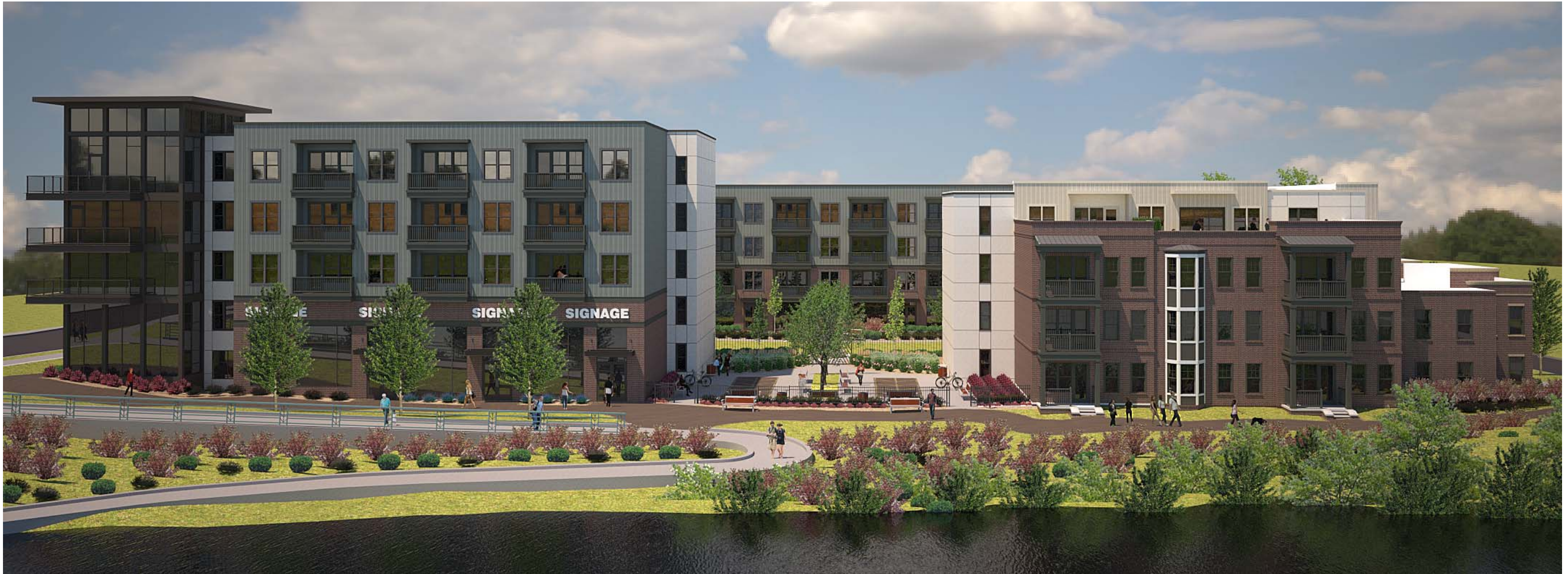
1 River Courtyard Perspective Scale: nts