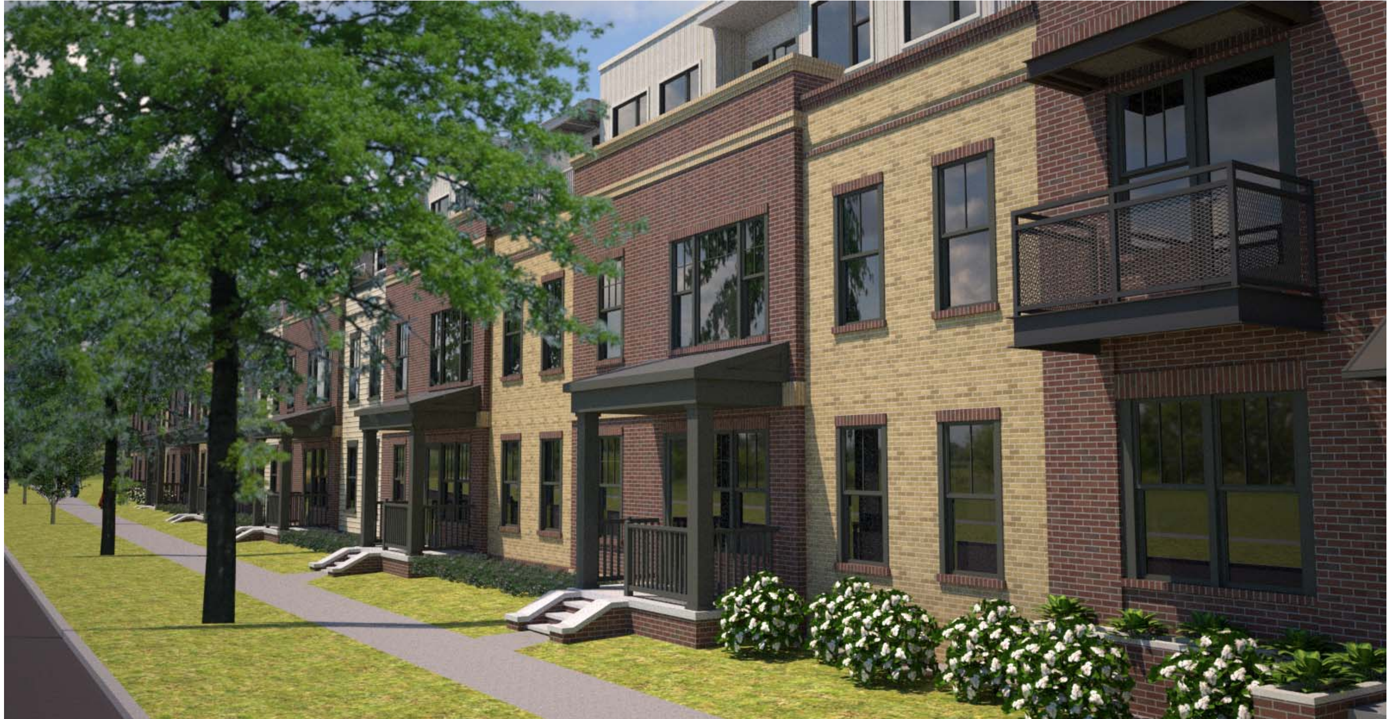
1 East Main Street Perspective Scale: nts