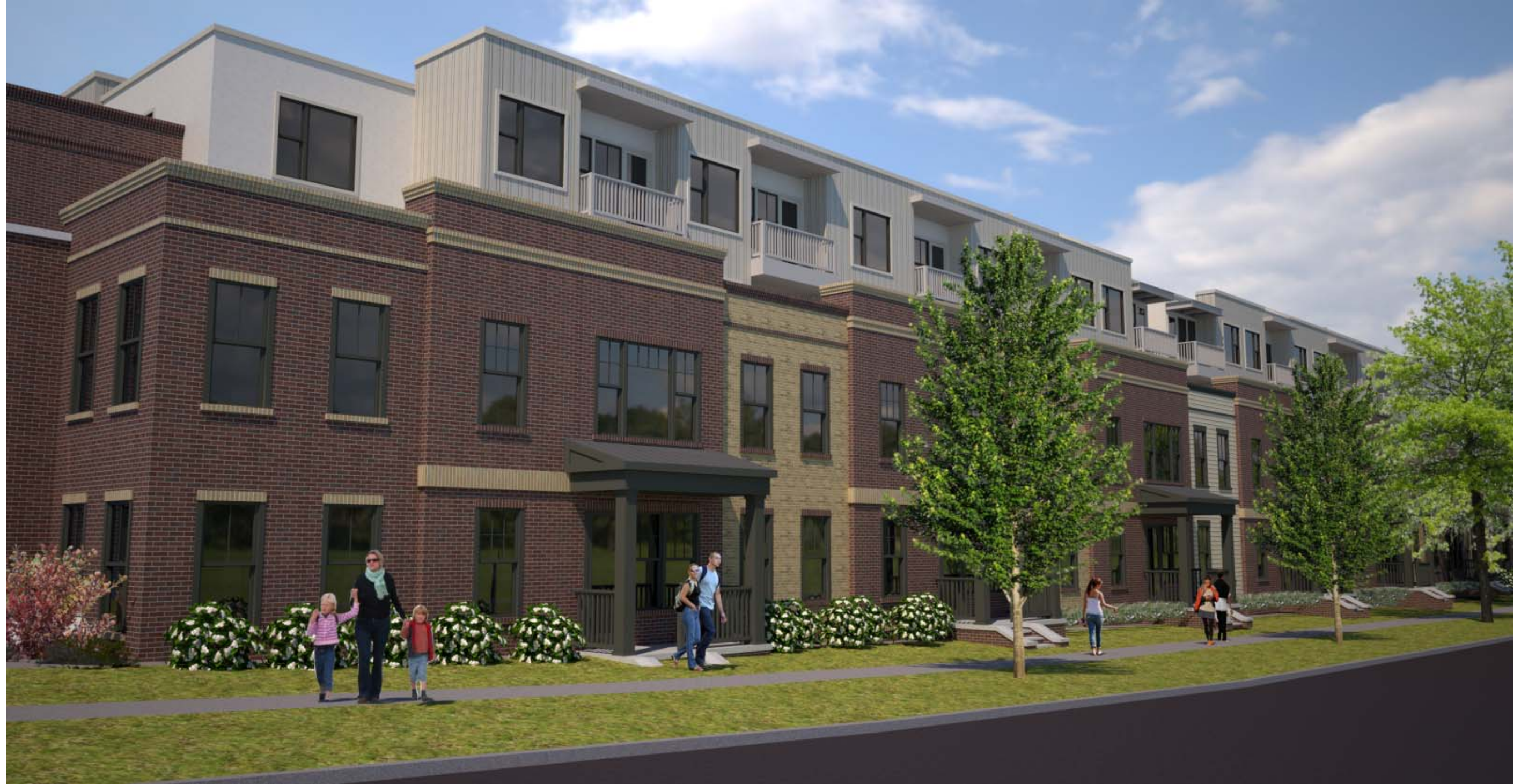
1 East Main Street Perspective Scale: nts