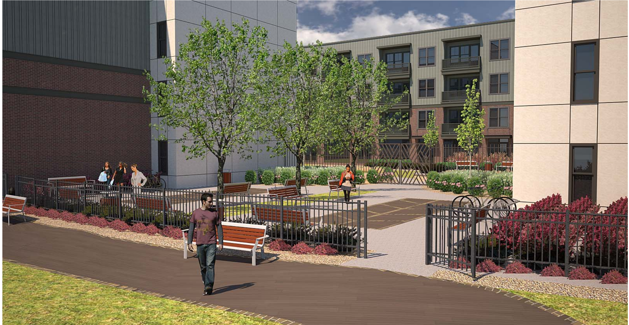
1 River Courtyard Perspective Scale: nts