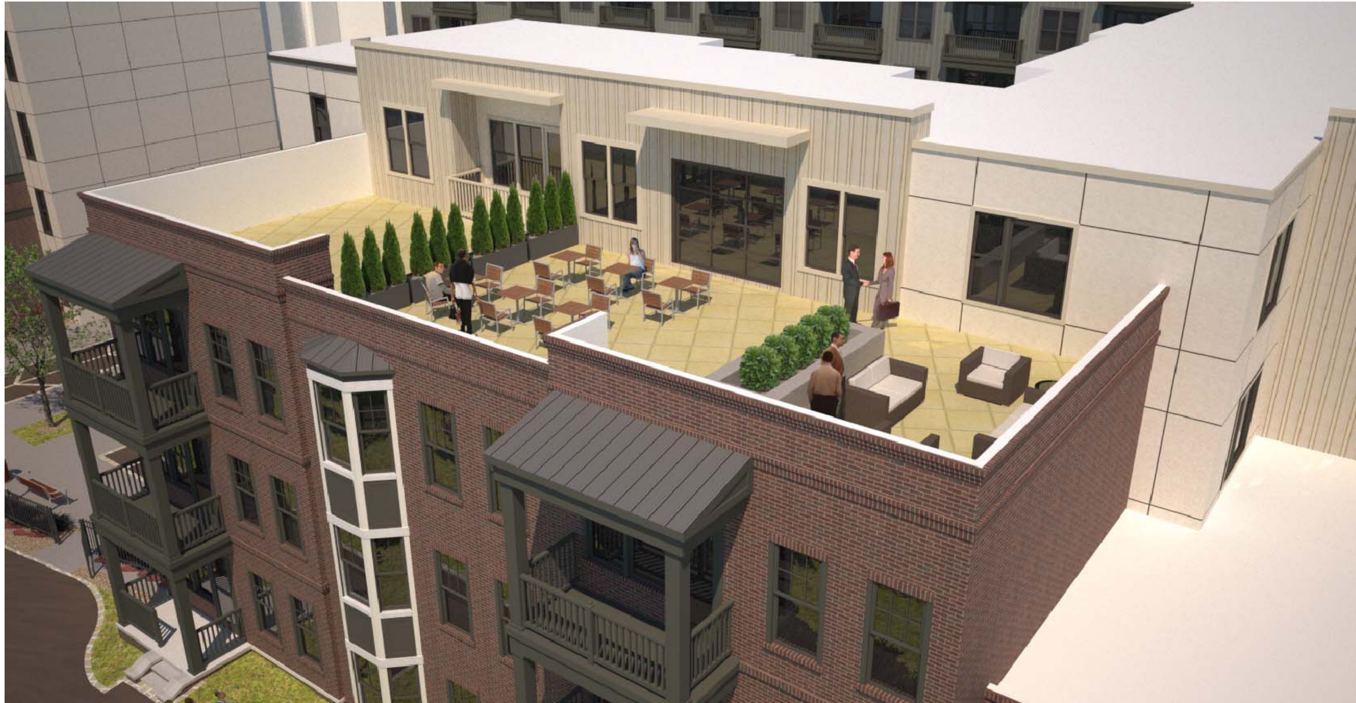
1 Sky Lounge Perspective Scale: nts