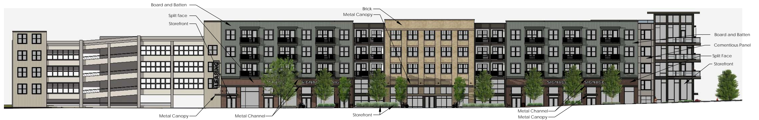
1 East Washington Elevation Scale: 1/32" = 1'-0"