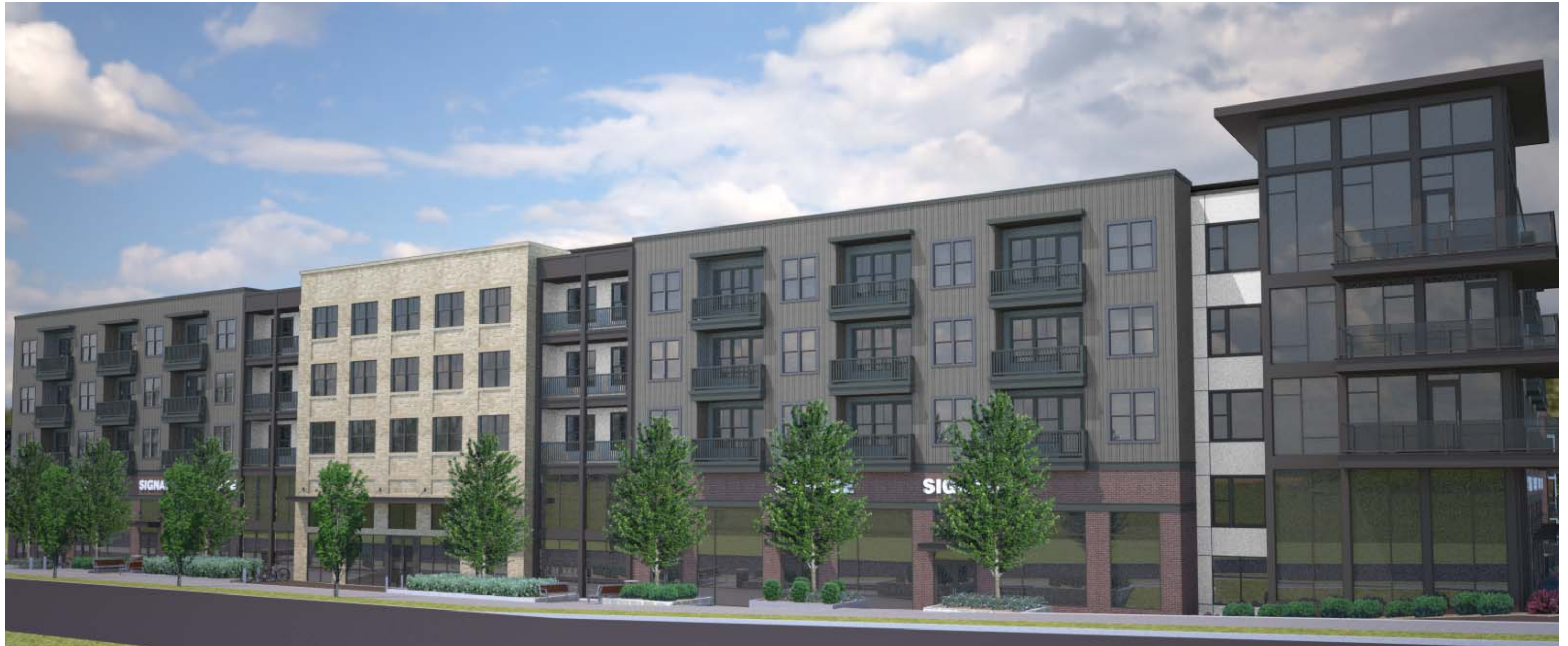
1 East Washington Perspective Scale: nts