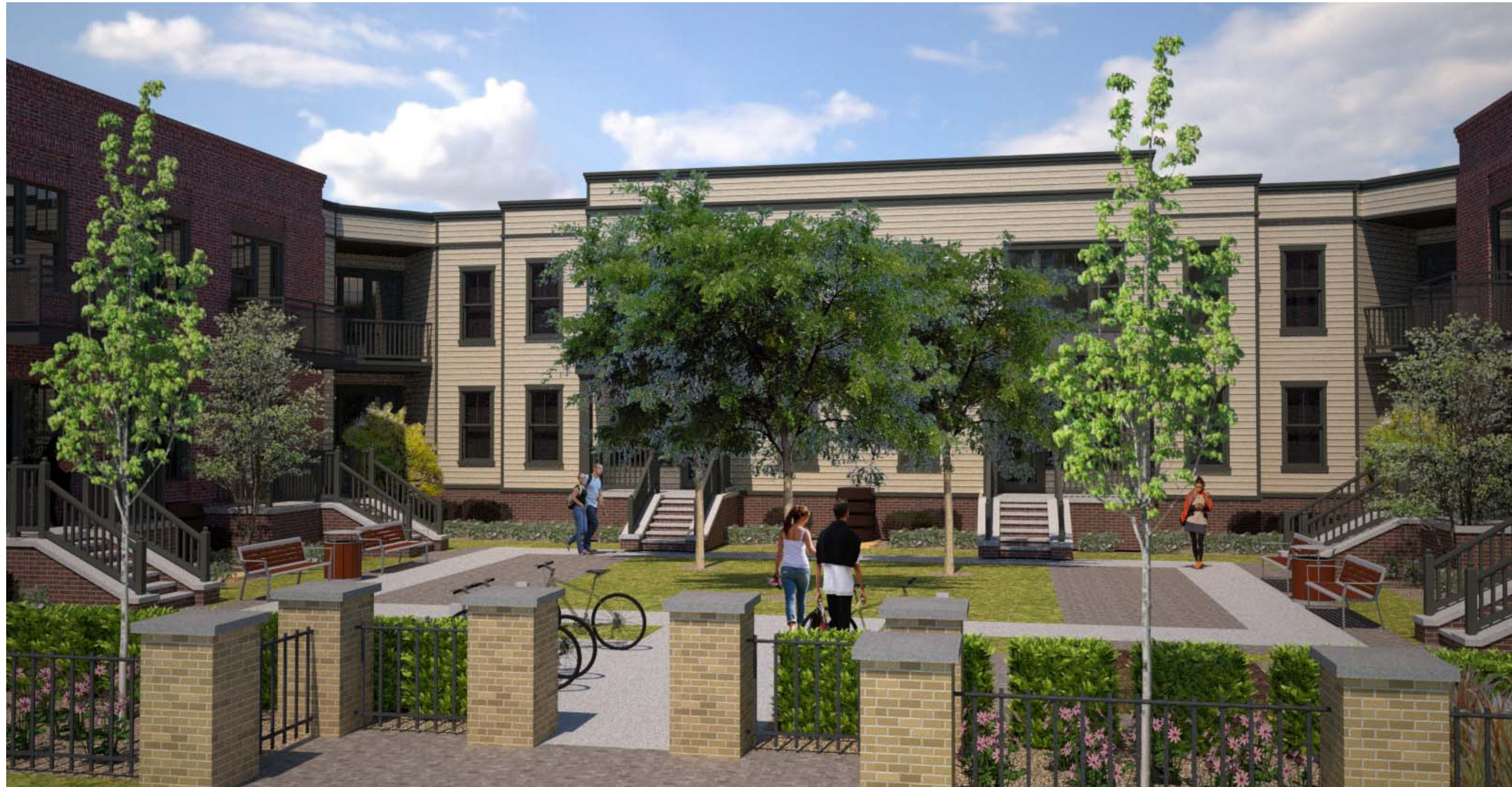
1 East Main Street Courtyard Perspective Scale: nts