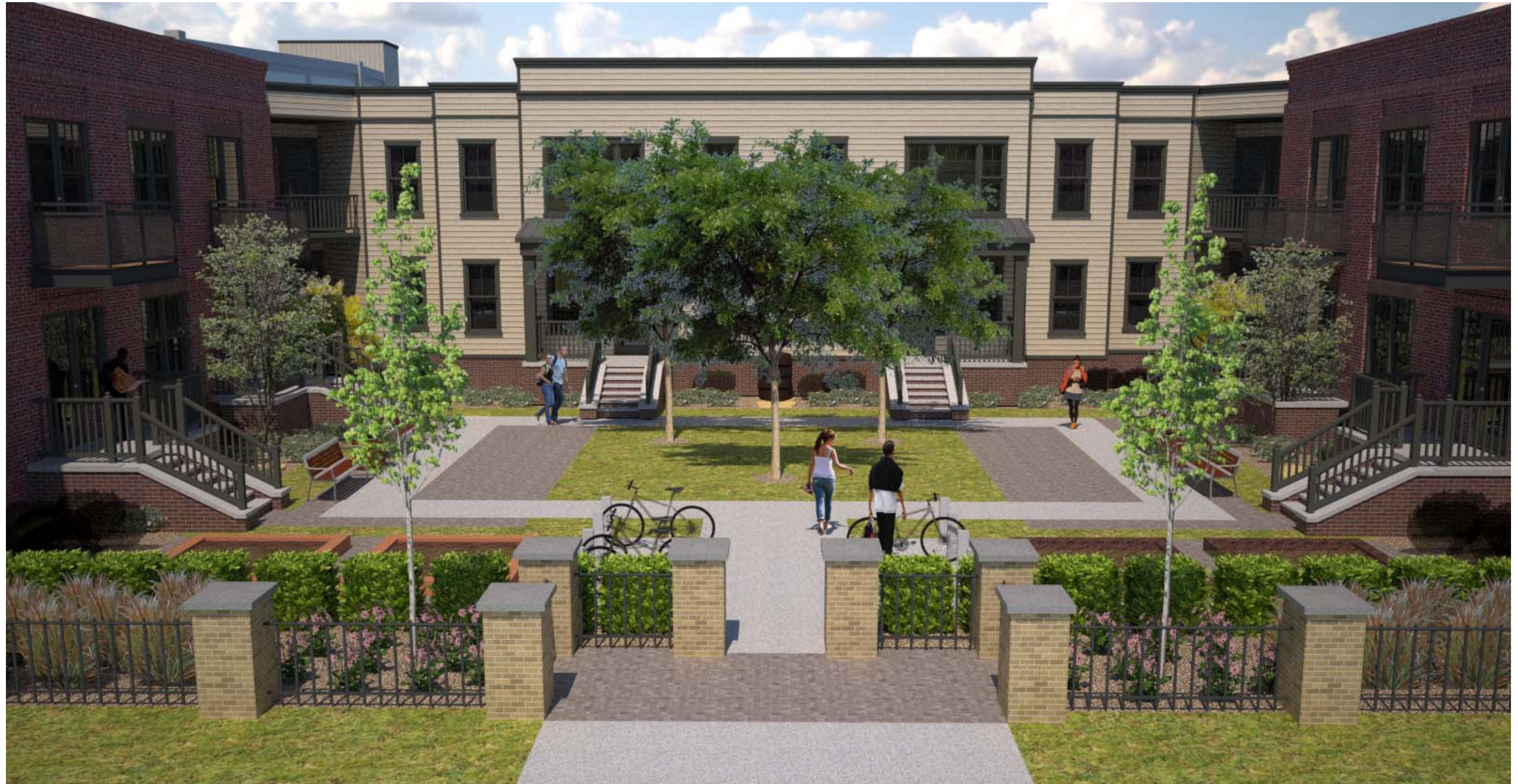
1 East Main Street Courtyard Perspective Scale: nts