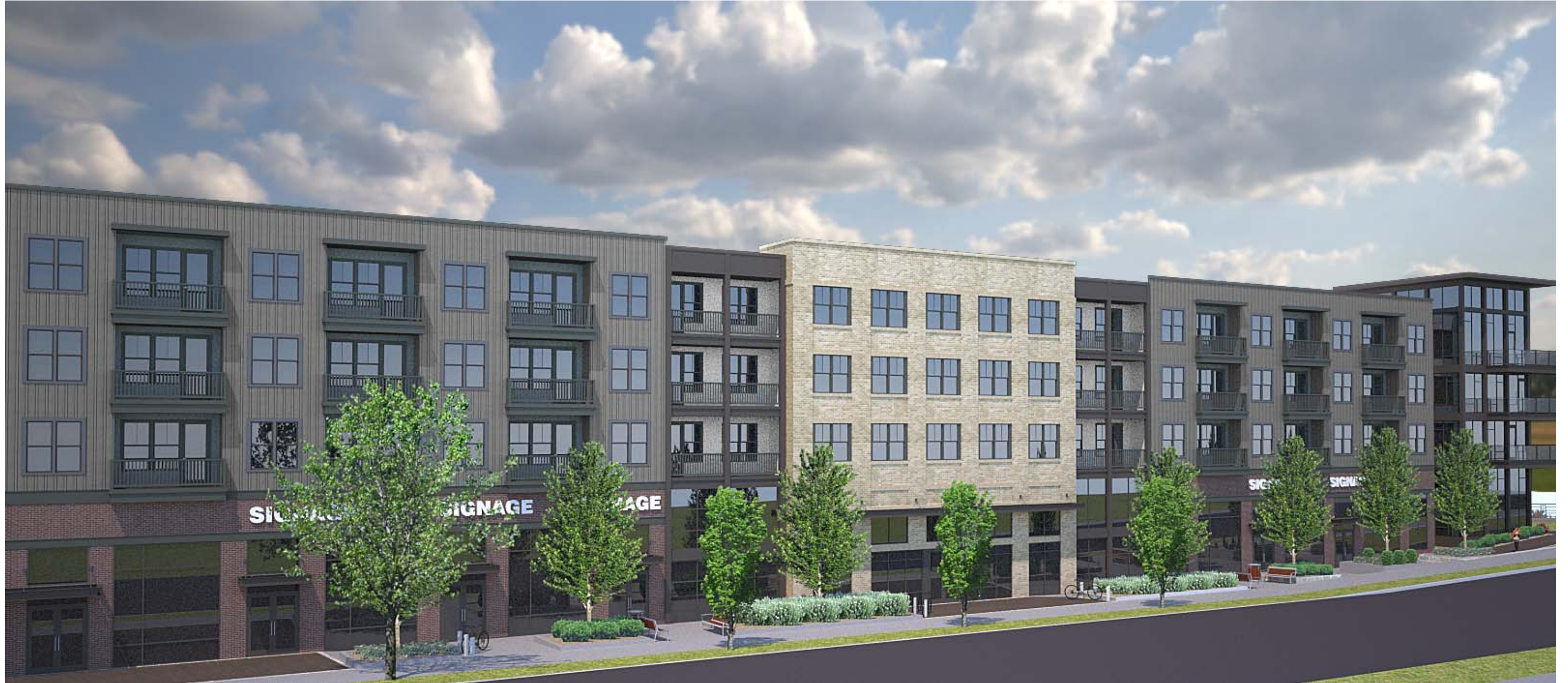
1 East Washington Perspective Scale: nts