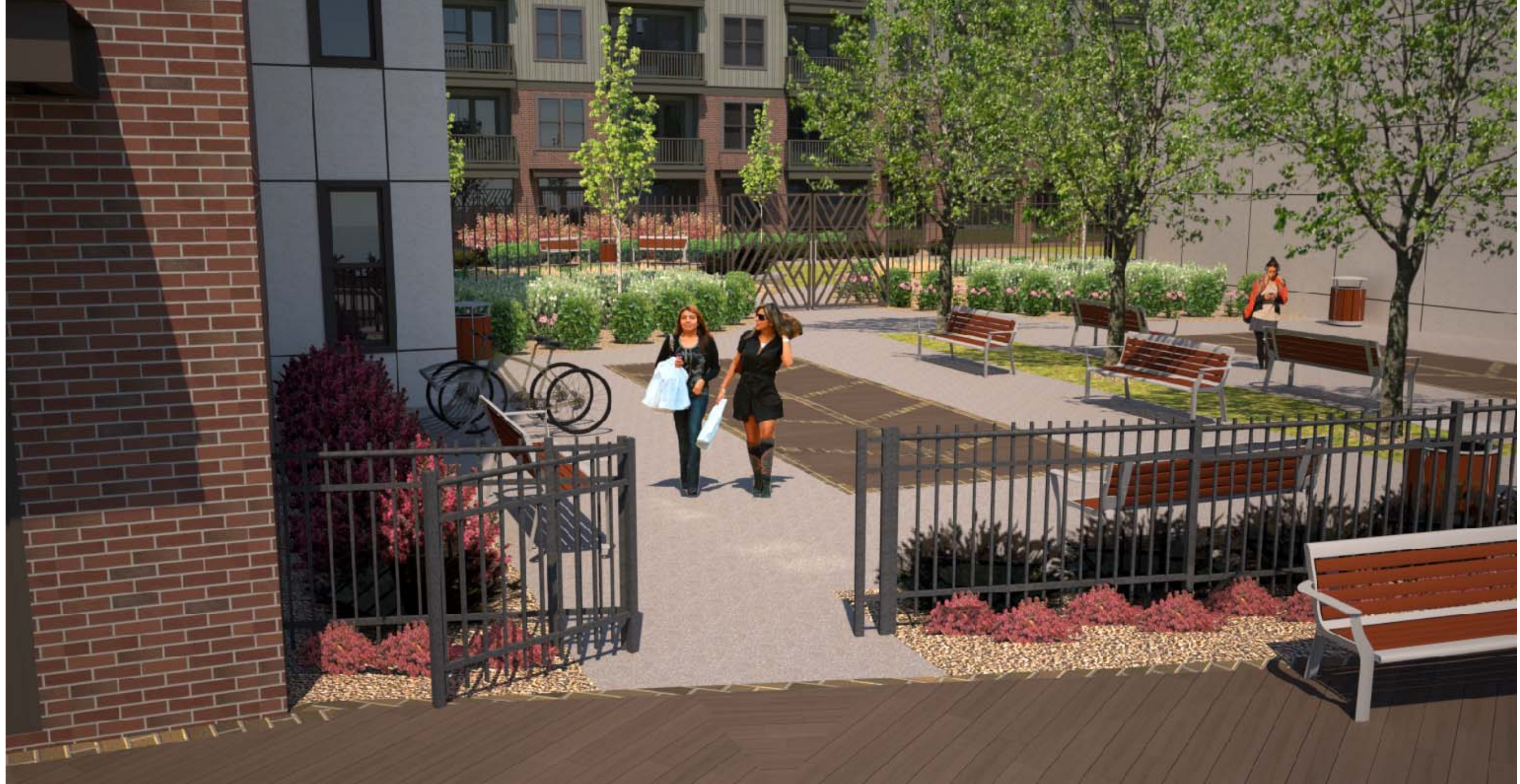
1 River Courtyard Perspective Scale: nts