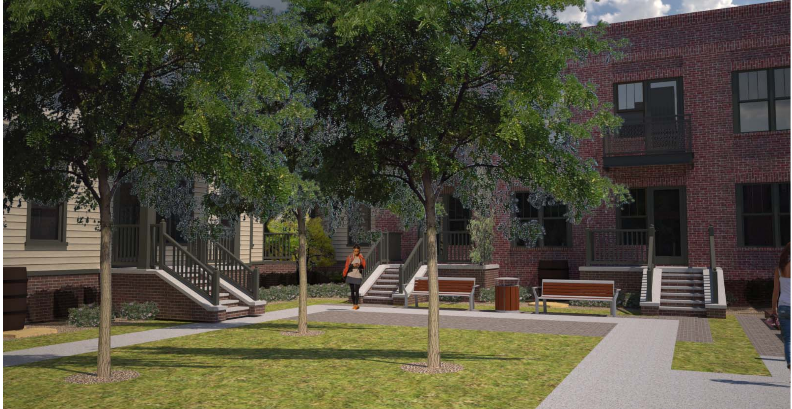
1 East Main Street Courtyard Perspective Scale: nts