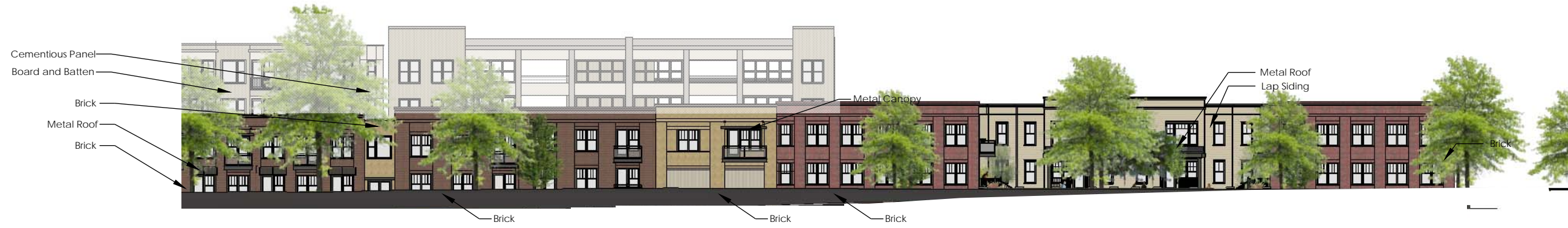
2 East Main St. Enlarged Elevation Scale: 1/32" = 1'-0"