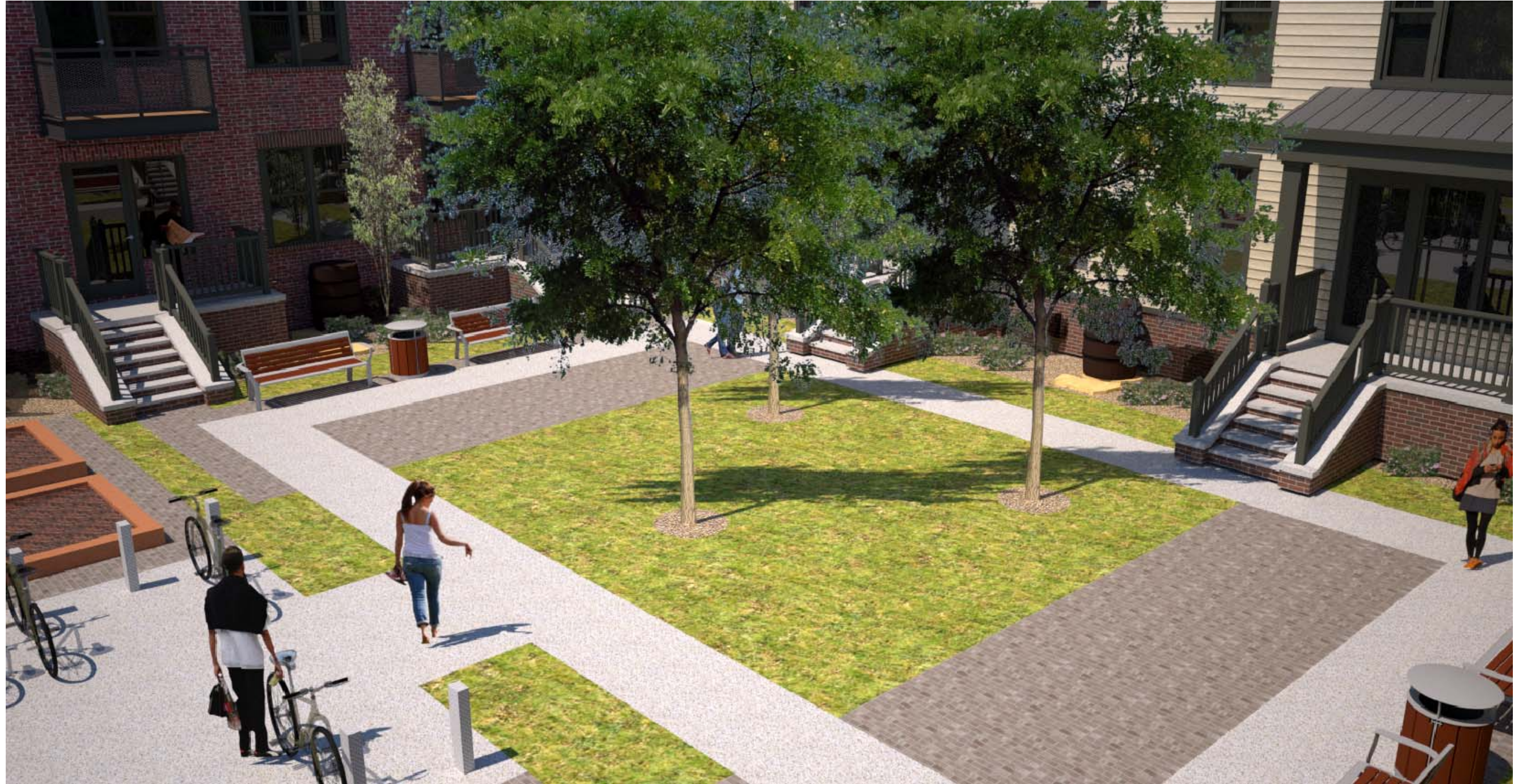
1 East Main Street Courtyard Perspective Scale: nts