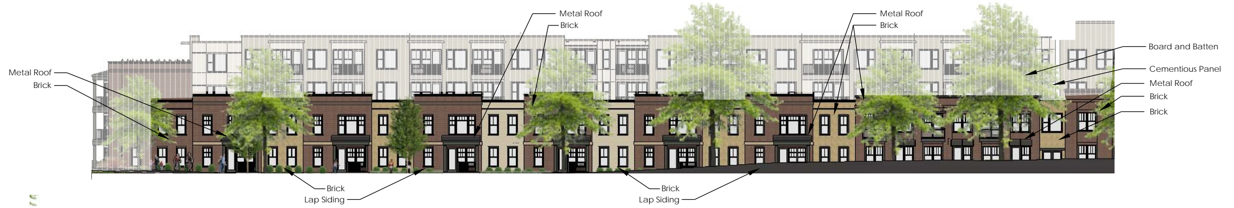
1 East Main St. Enlarged Elevation Scale: 1/32" = 1'-0"