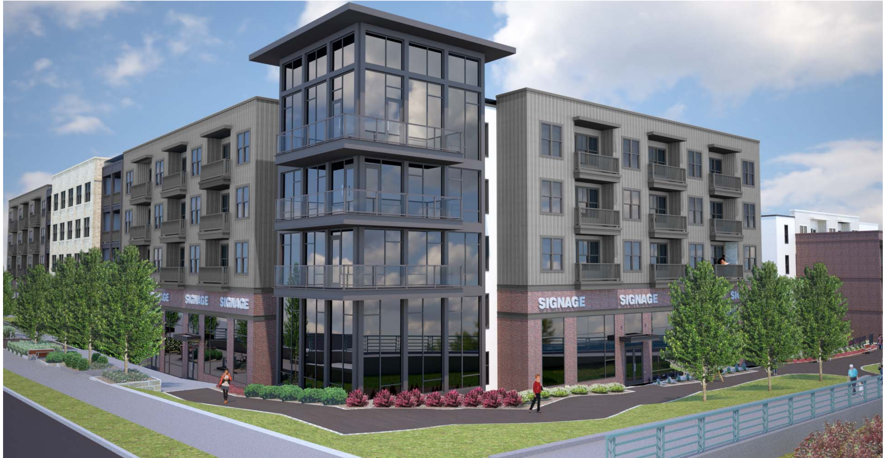
1 East Washington Perspective Scale: nts