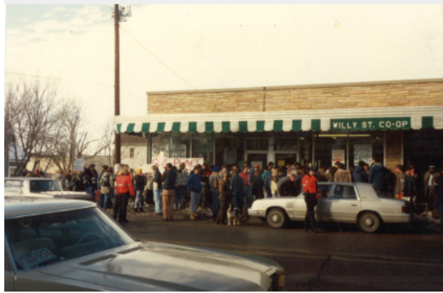
1202 Williamson St, 1970s. Peace Protest.