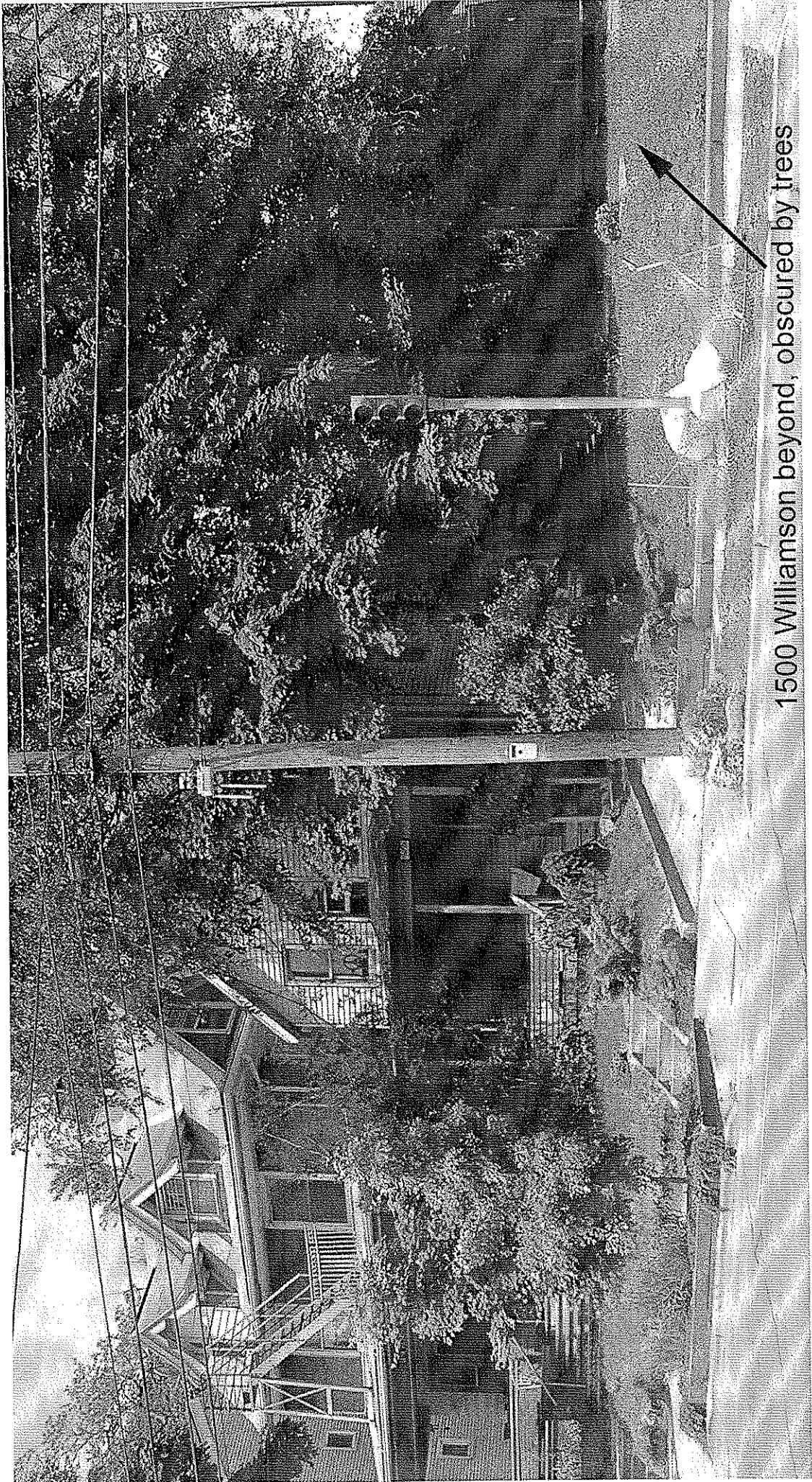
1500 Williamson beyond, obscured by trees