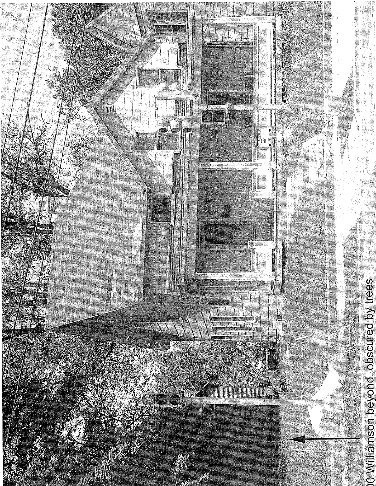
30 Williamson beyond, obscured by trees