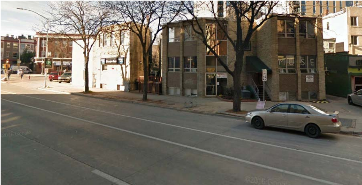
Potential new bus stop on University Avenue near side Gilman Street