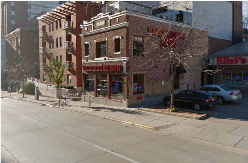
Potential new bus stop on Gorham Street far side Broom Street