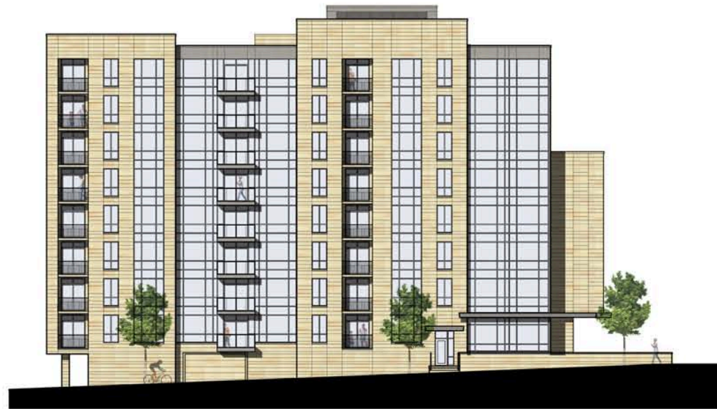
Brooks Street Elevation