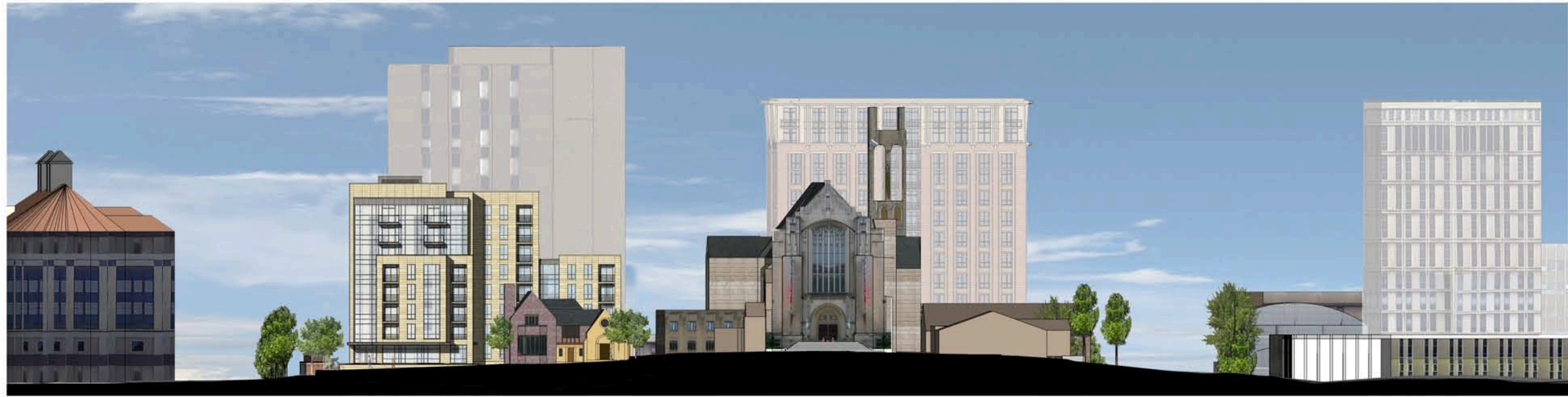
University Ave. Street Elevation- 8 Story Option