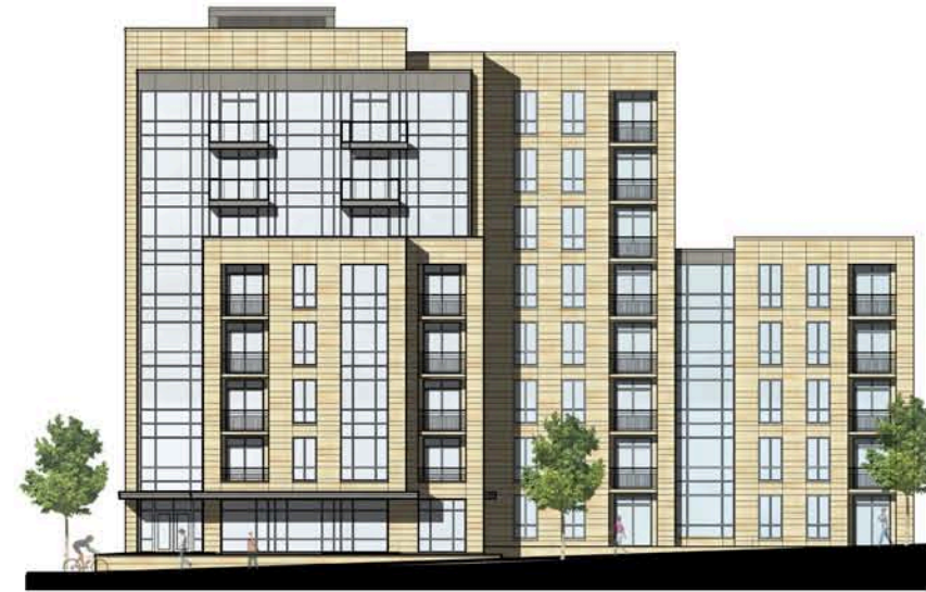
University Avenue Elevation