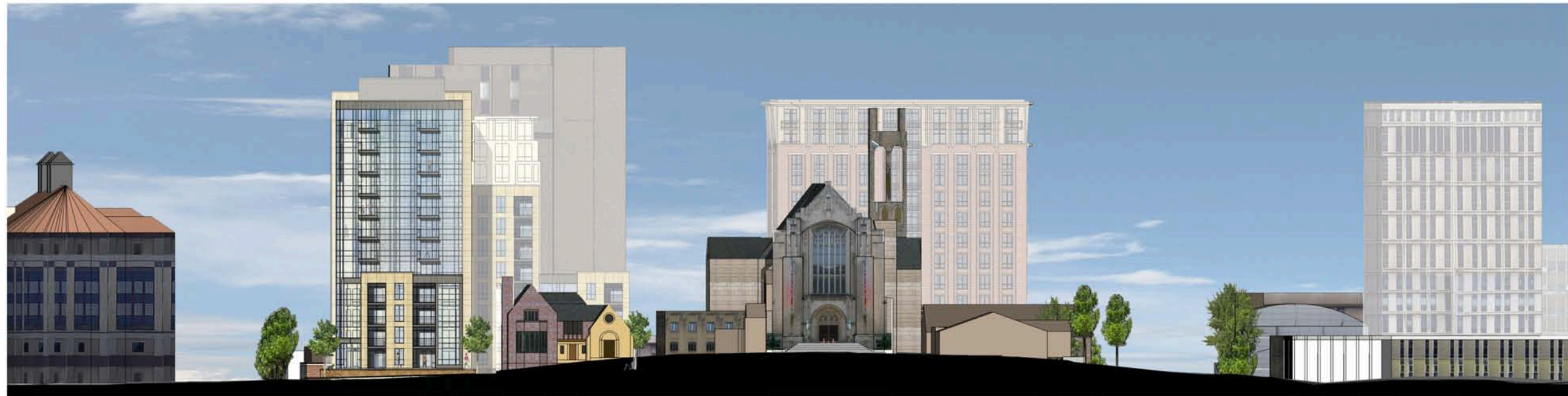
University Ave Street Elevation-Previous Proposal