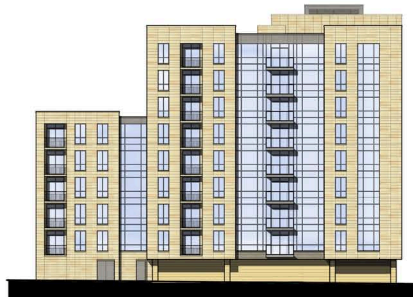
Conklin Place Elevation