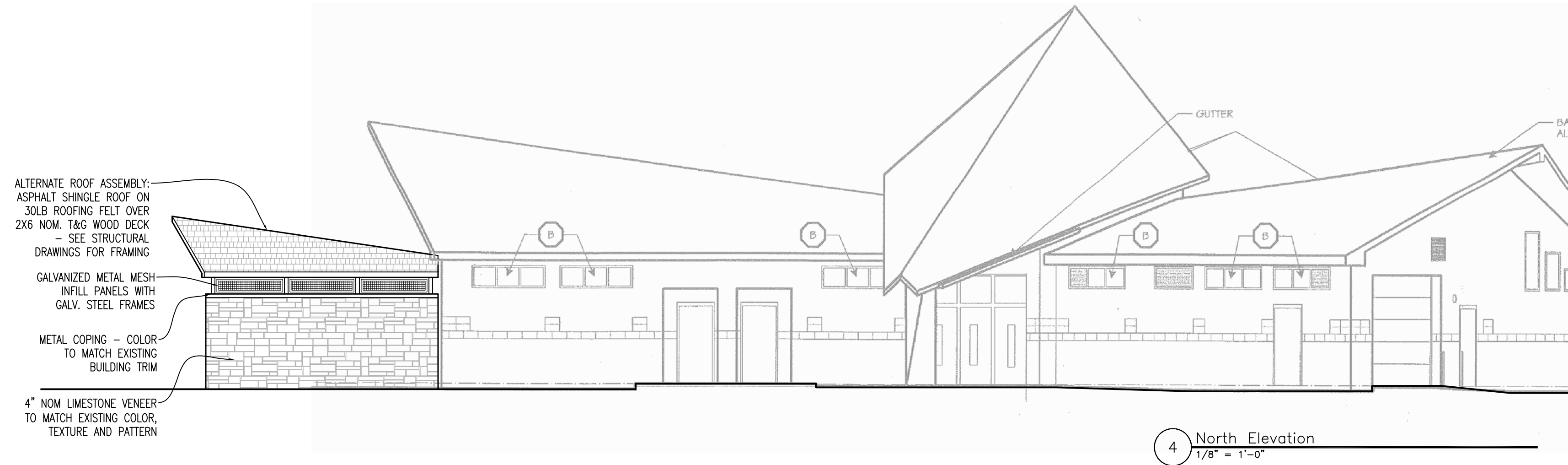
4 North Elevation 1/8" = 1'-0"