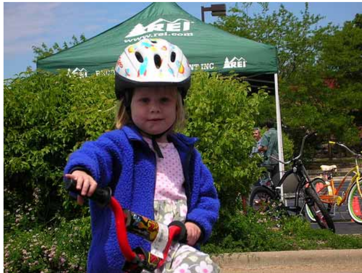
A child at REI's bike day.

Resources: Minimal city resources; festival should be organized and supported by private sector