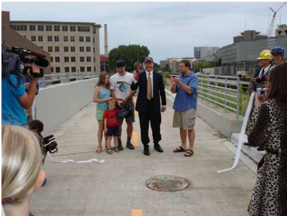
The Mayor cuts the ribbon at opening of “The Missing Link” path.

All of the great cities for bicycling (places like Boulder, Portland, Davis, Copenhagen, and Amsterdam) have become great cities for bicycling because of the visionary actions of citizens and government. The time is ripe for Madison to become the best city in America for bicycling. This report outlines how to build upon the excellent work which has already been accomplished through the efforts in the public and private sectors over many years in order to move towards becoming a Platinum Level Bicycle Friendly Community and beyond. It is up to the citizens of Madison to make it happen.