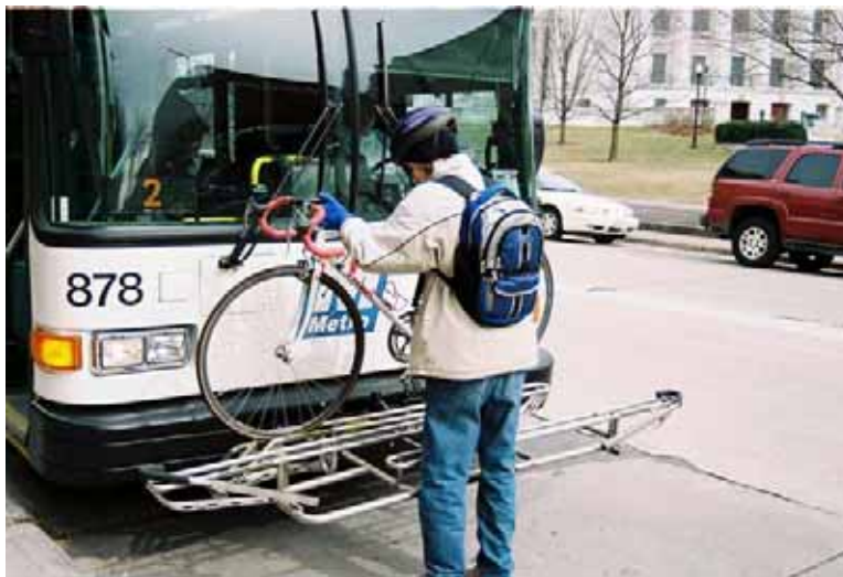
Bike Rack on Madison Metro Bus.