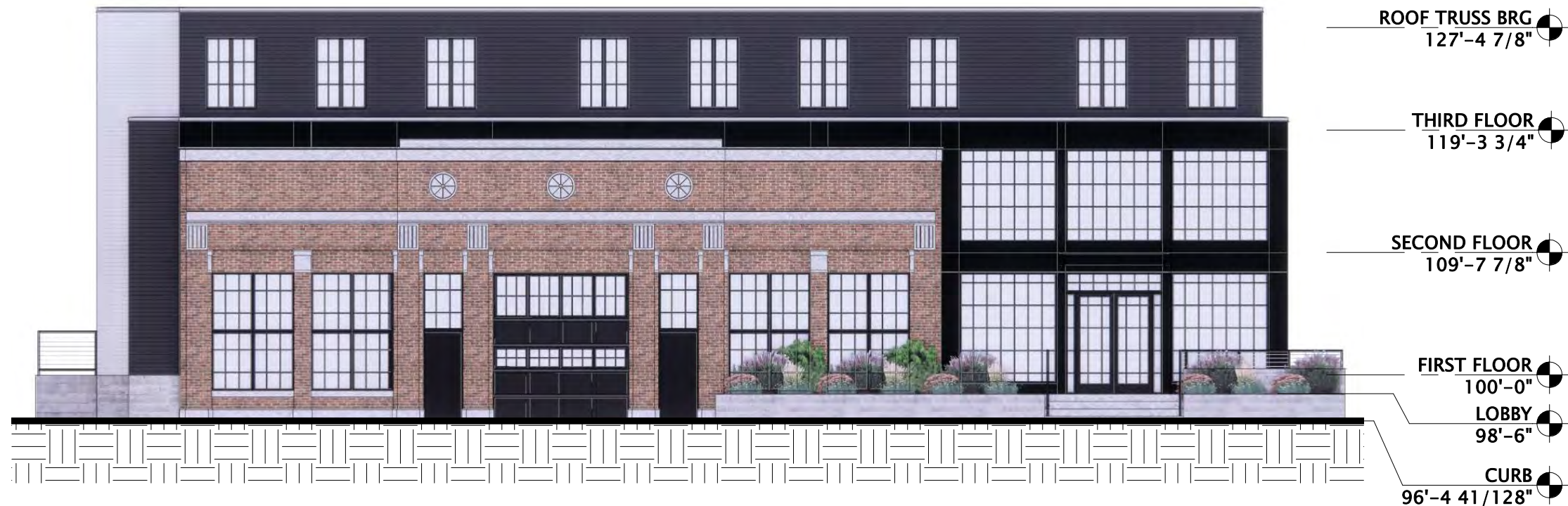
NORTH ELEVATION - DAYTON 3/32" = 1'-0"