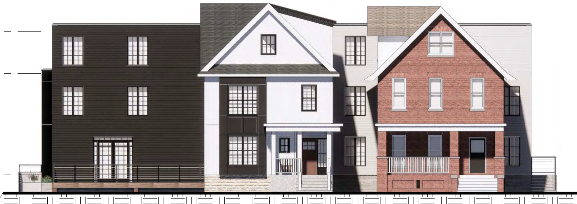
SOUTH ELEVATION - MIFFLIN 3/32" = 1'-0"