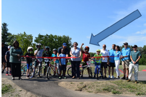
This kid is pumped!