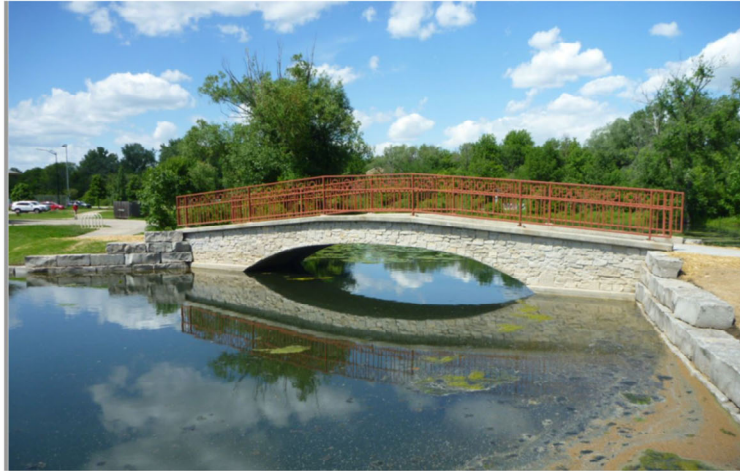
Johnson Street Bridge at Tenney Park

This is after. The much larger stones and longer retaining wall is designed to prevent damage to the lagoon shore line for years to come.