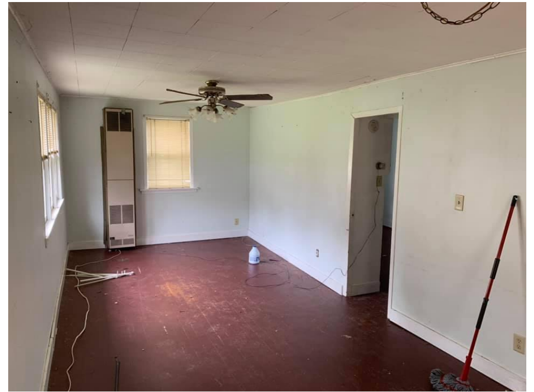
Wall unit only heating source.