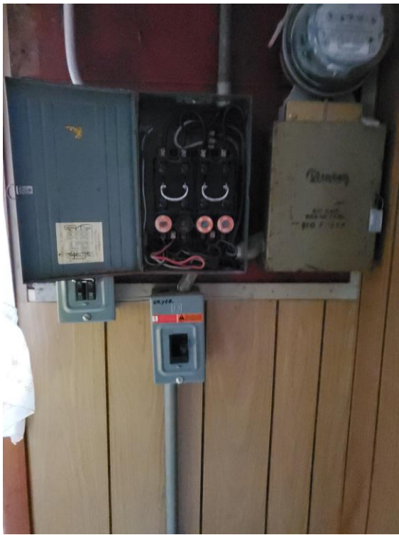
Outdated electrical panel with fuses. City meter located inside the home.