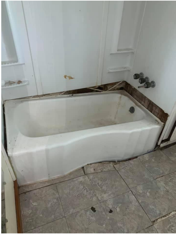
Bathtub sunk into crawl space due to broken joists.