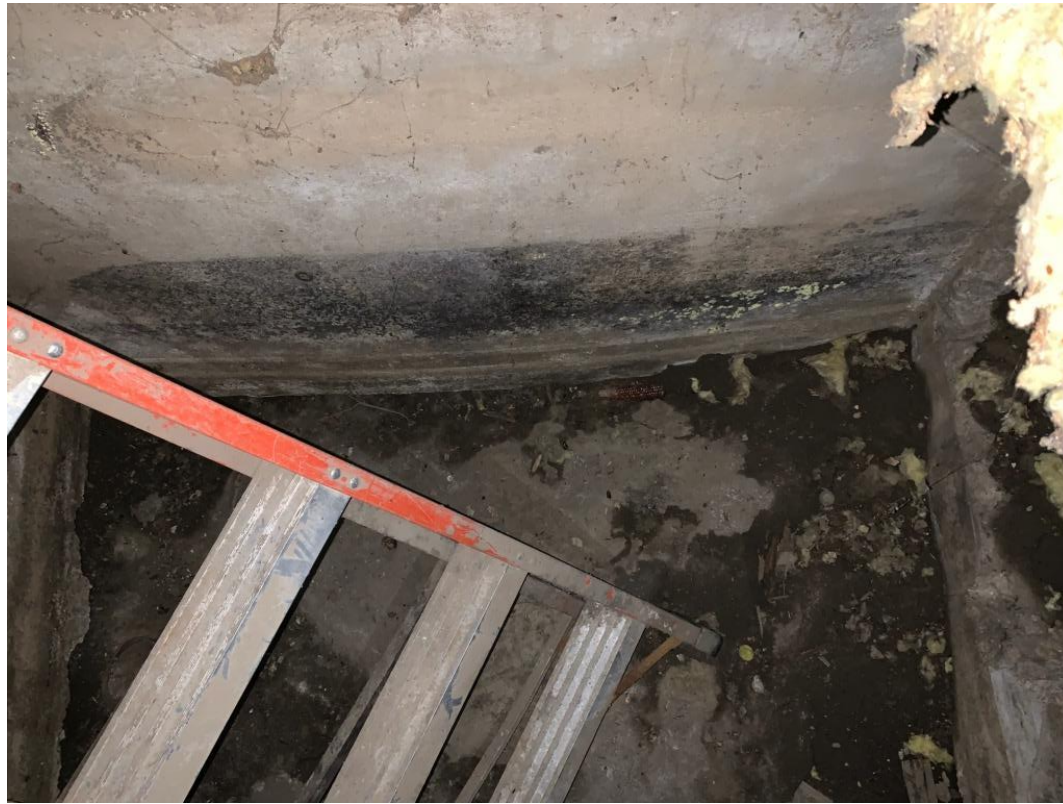
Crawl space shows mold and water damage.