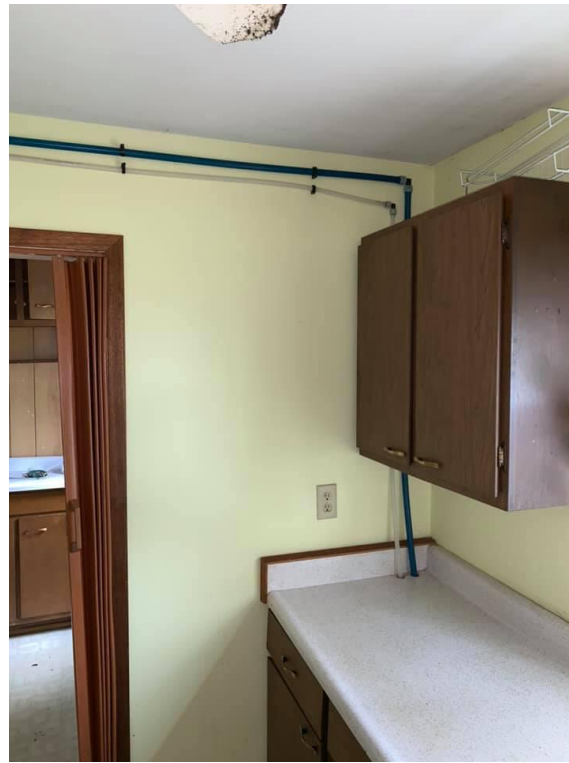
Water lines running along walls.