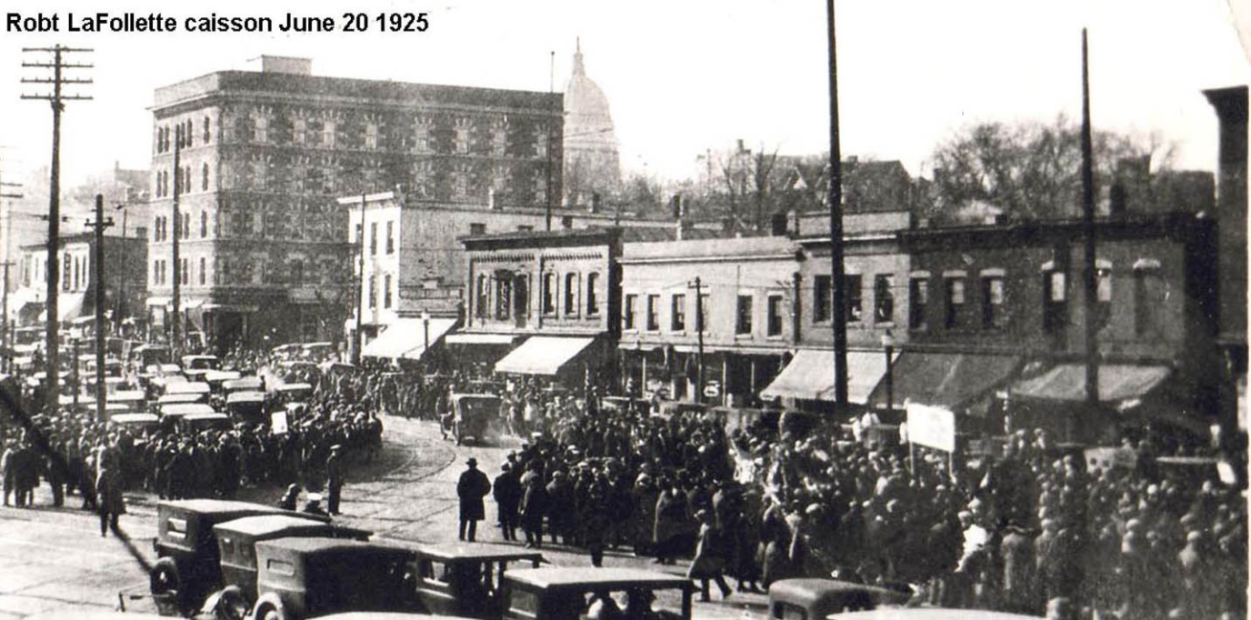
Robt LaFollette caisson June 20 1925