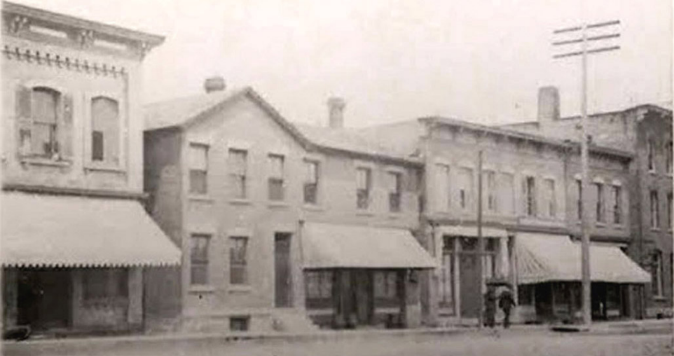
Circa 1899, 500 Block East Wilson. Unk. Likely WHS.