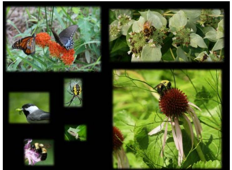
Lots of pollinators and creatures = healthy garden environment