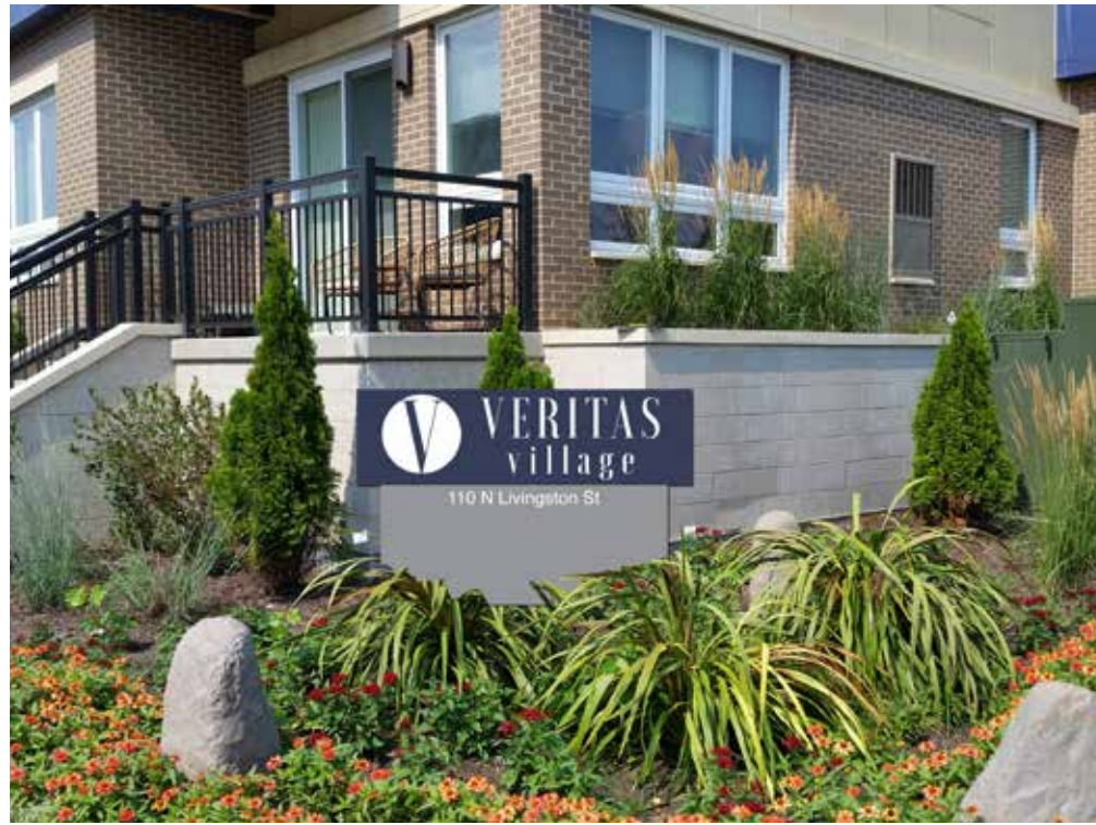
PROPOSED DAY VIEW

To be .125 aluminum over steel angle painted metallic gray (color to coordinate with the building base)