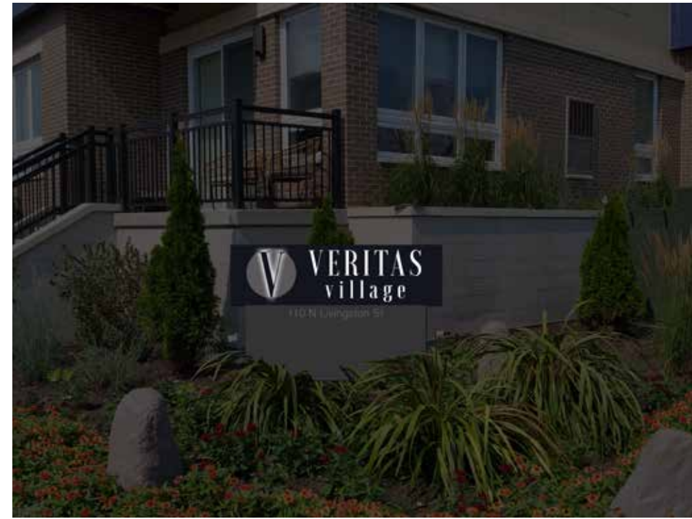
PROPOSED NIGHT VIEW