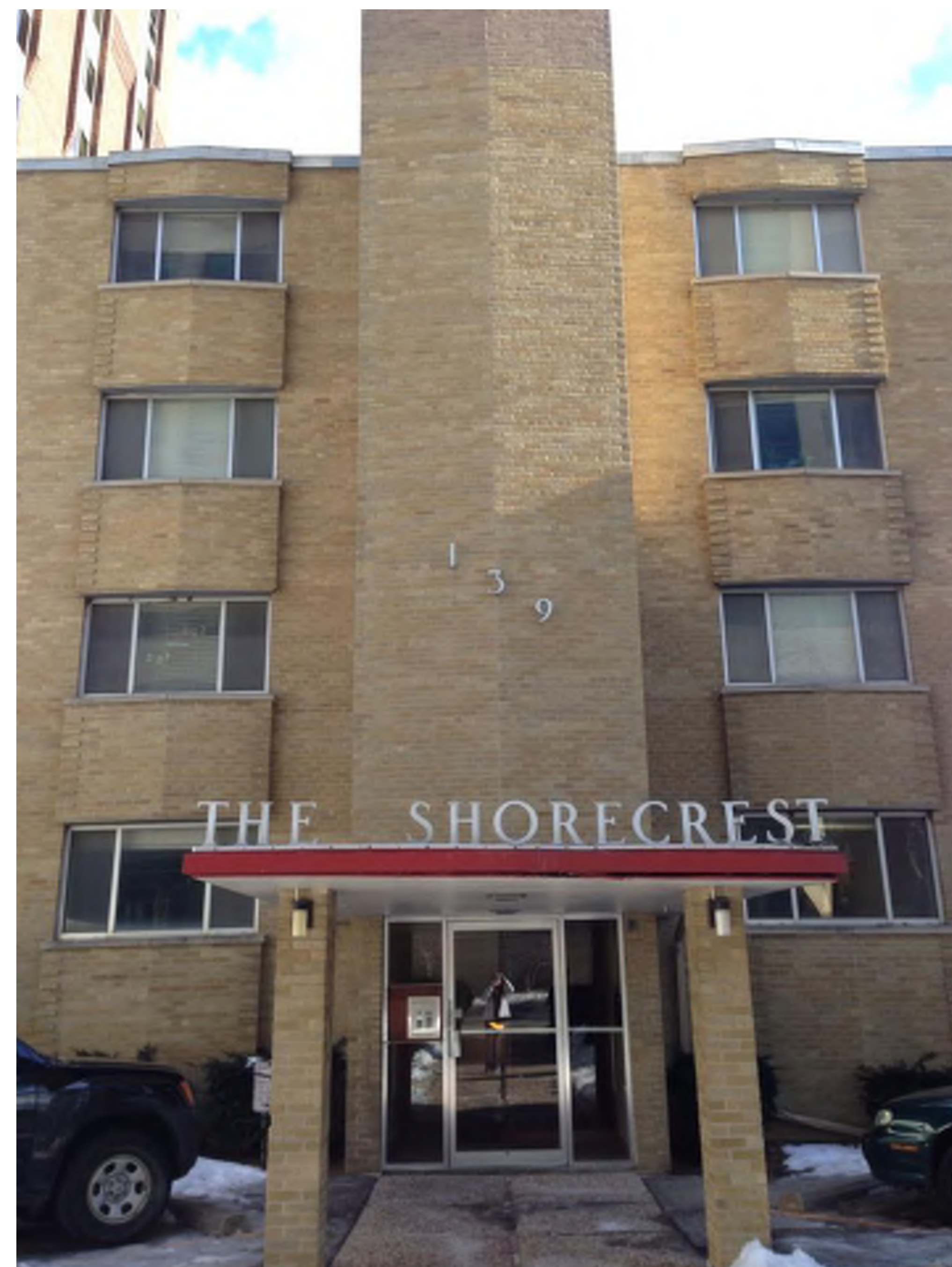
FRONT FACADE 139 WEST WILSON (The Shorecrest)