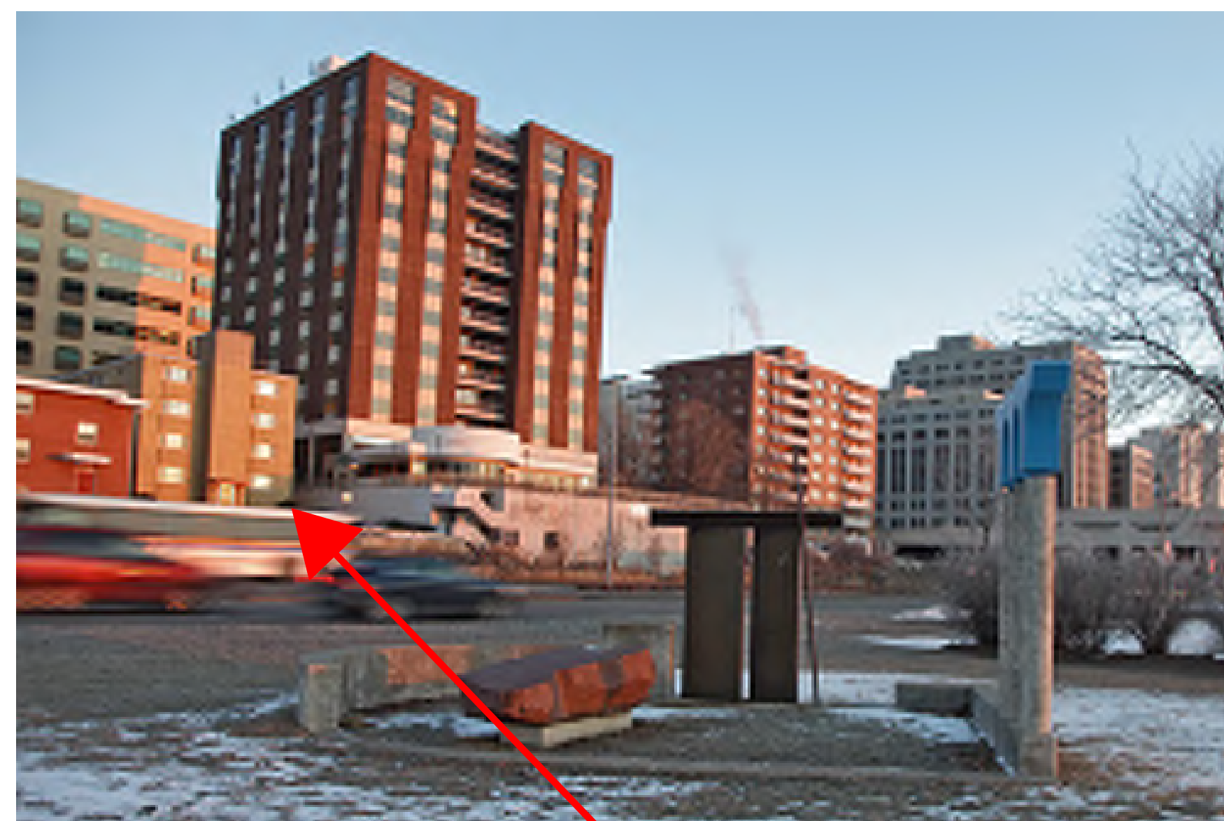
REAR FACADE FROM LAKESIDE IN CONTEXT