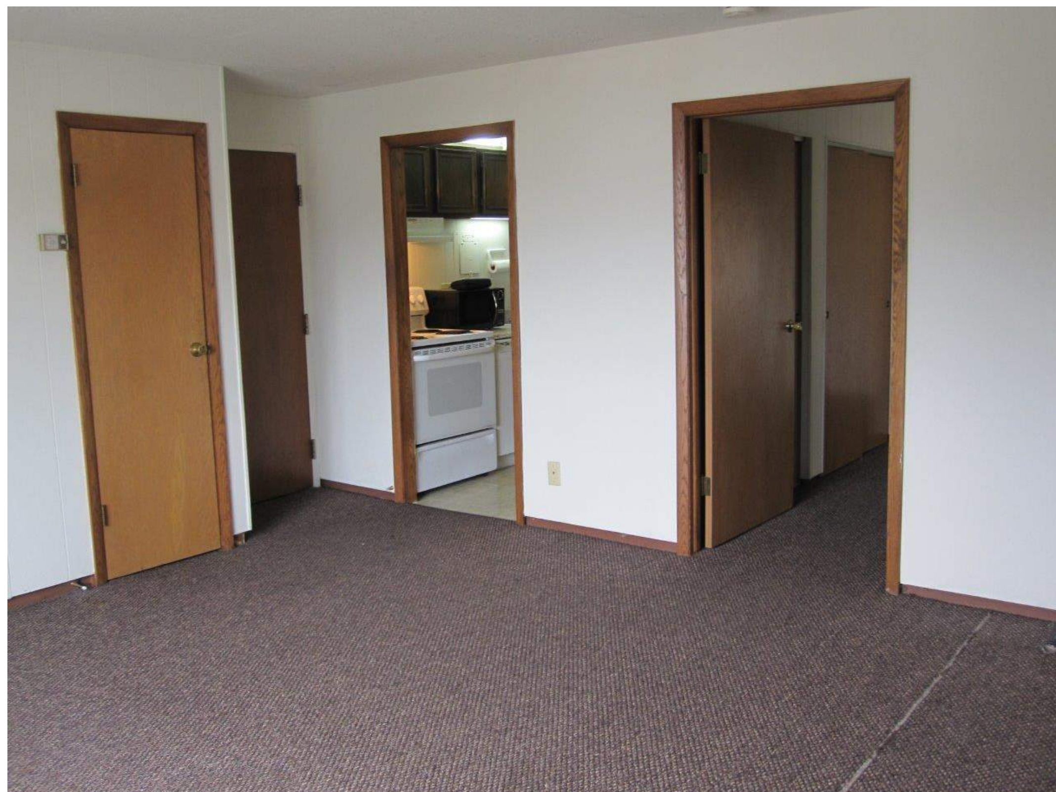
Existing interior photographs shown here are typical of 139 West Wilson Street