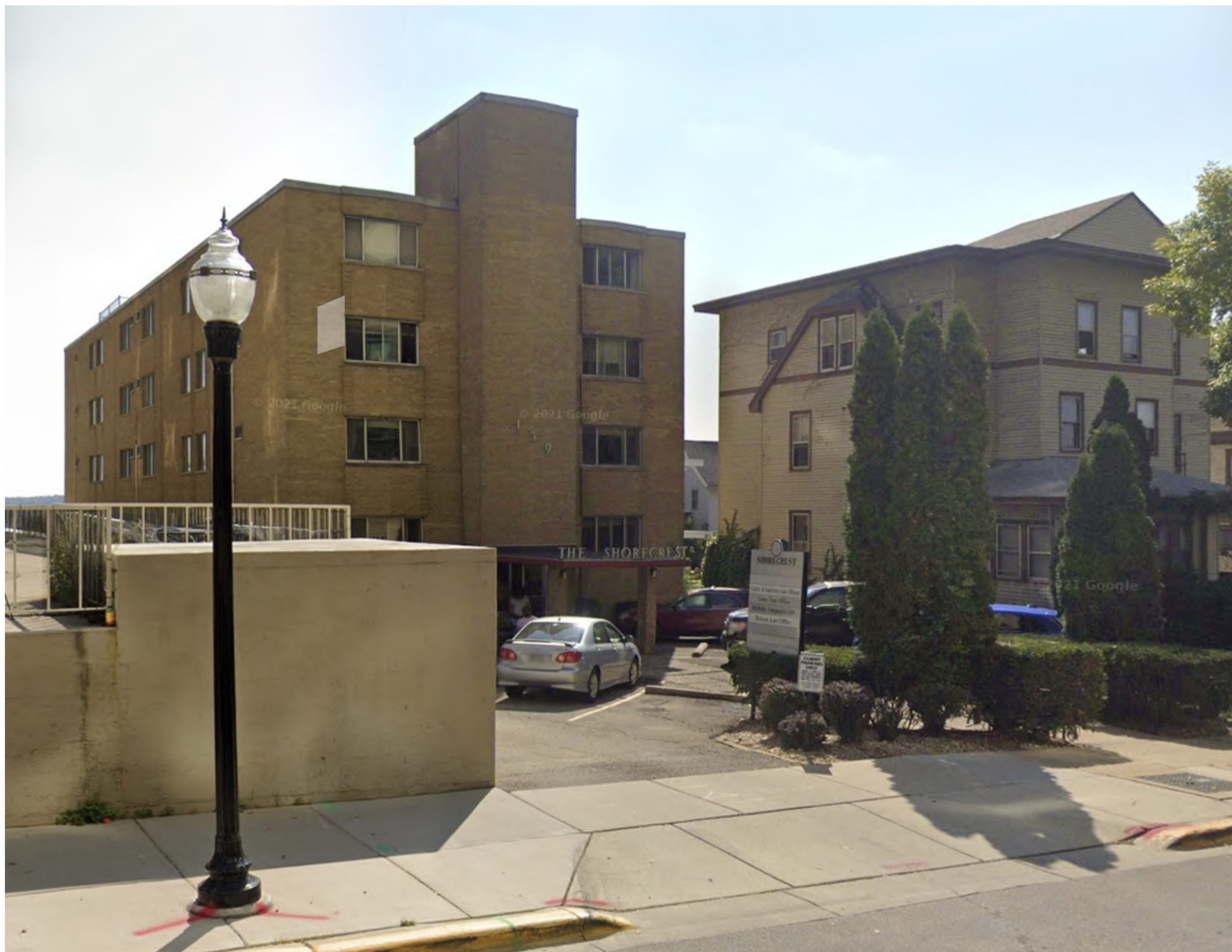
FRONT AND WEST SIDE