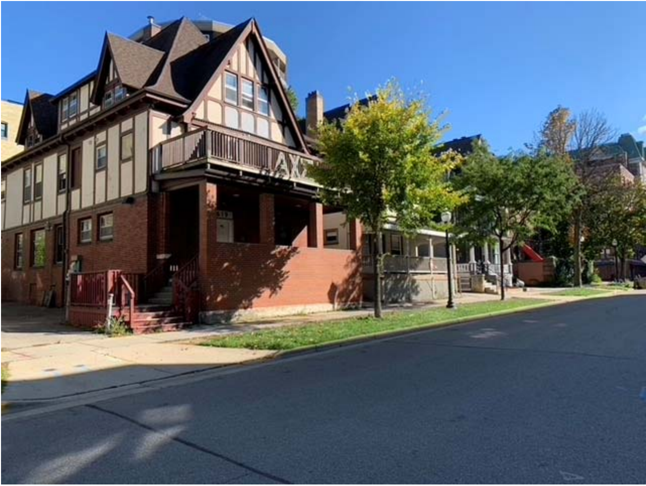
619 N Lake