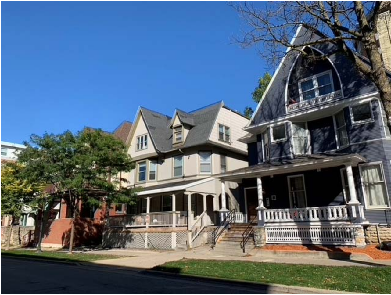
615 and 609 N. Lake