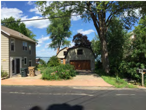
Looking north from street