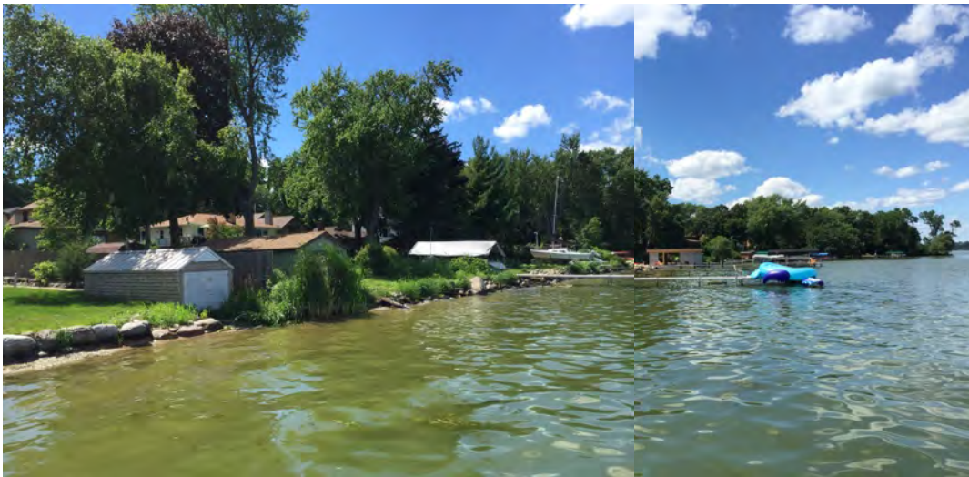
Lakeshore looking west