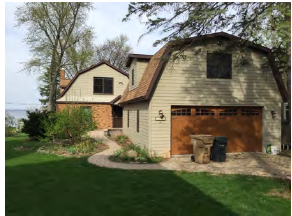
Existing house and garage