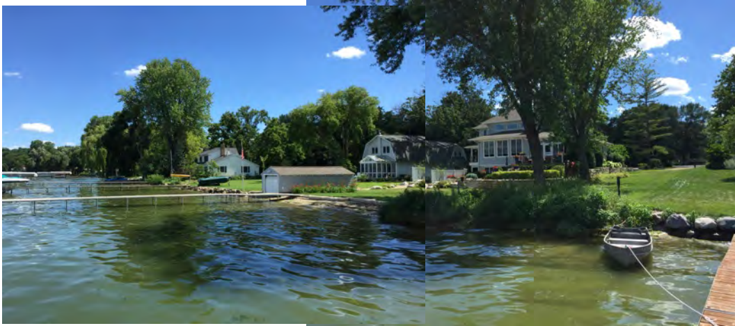
Lakeshore looking east