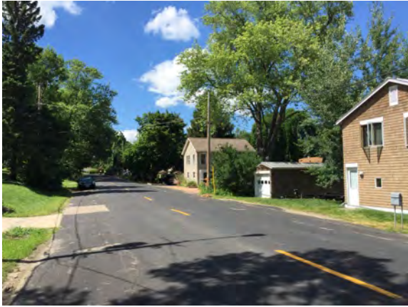
Street view looking west