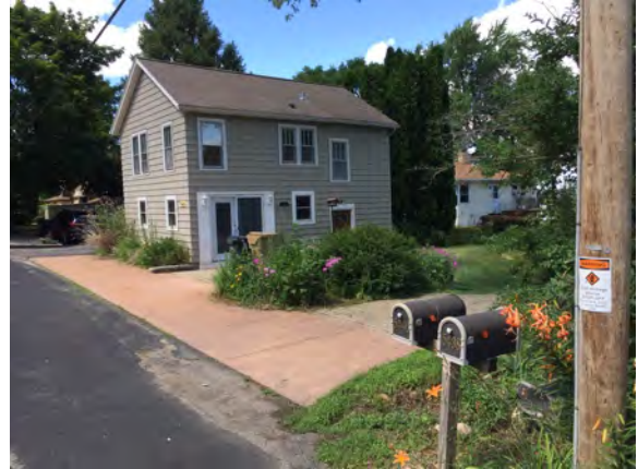
Existing concrete walk and driveway