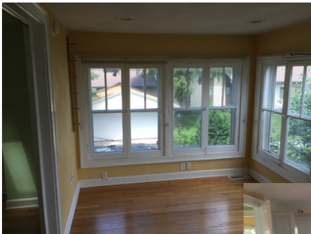
1st Fl Utility