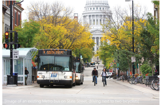
[Image of an existing Metro bus on State Street, driving next to two bicyclists]

MovingMadison will require substantial investment to implement, but will provide the transportation framework necessary for Madison to flourish. Madison BRT is a part of this action plan.