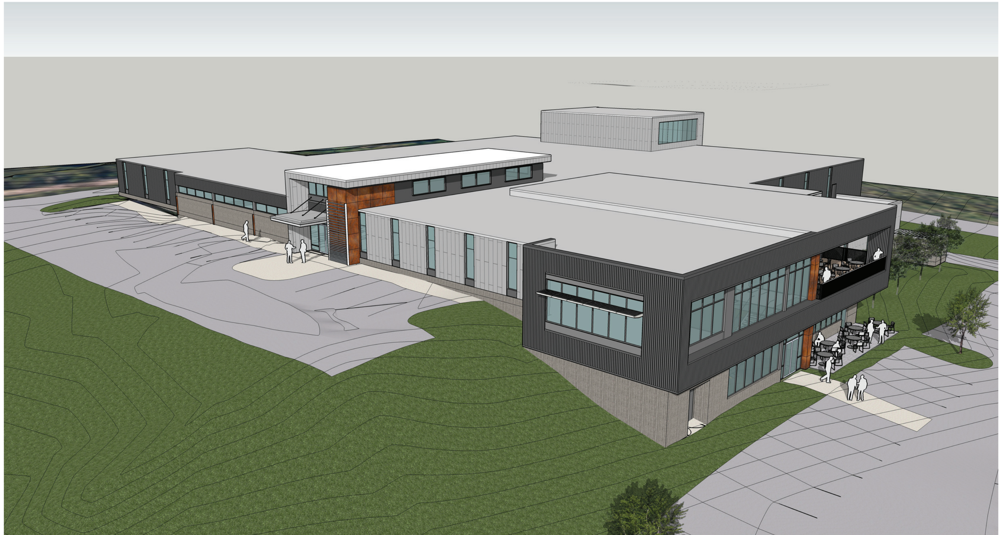
Aerial View From Southeast Steamfitters Local 601 training Facility #2015.26.00 February 17, 2016