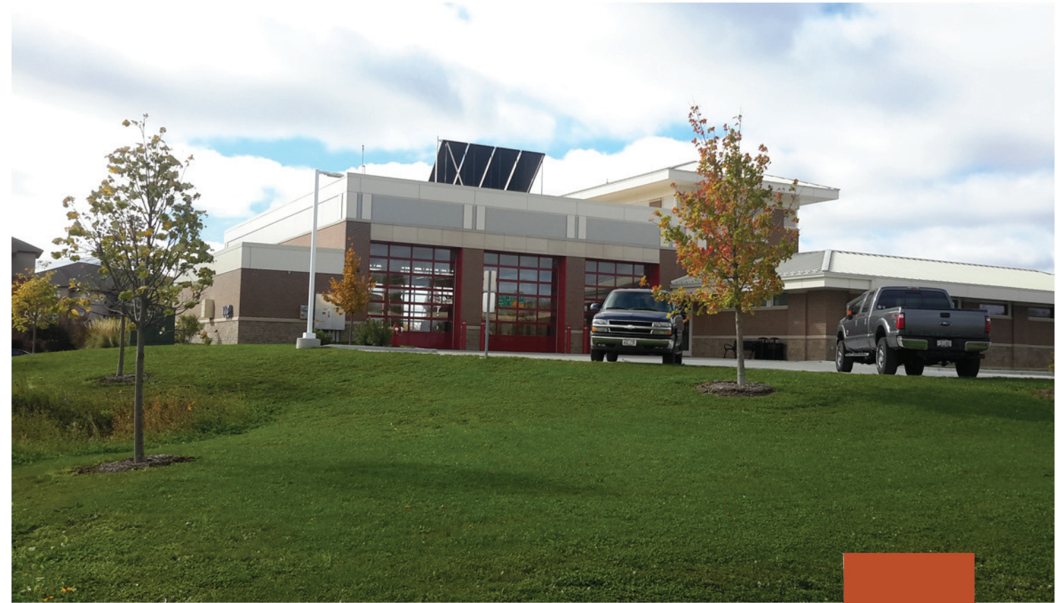
View of Firestation from northeast