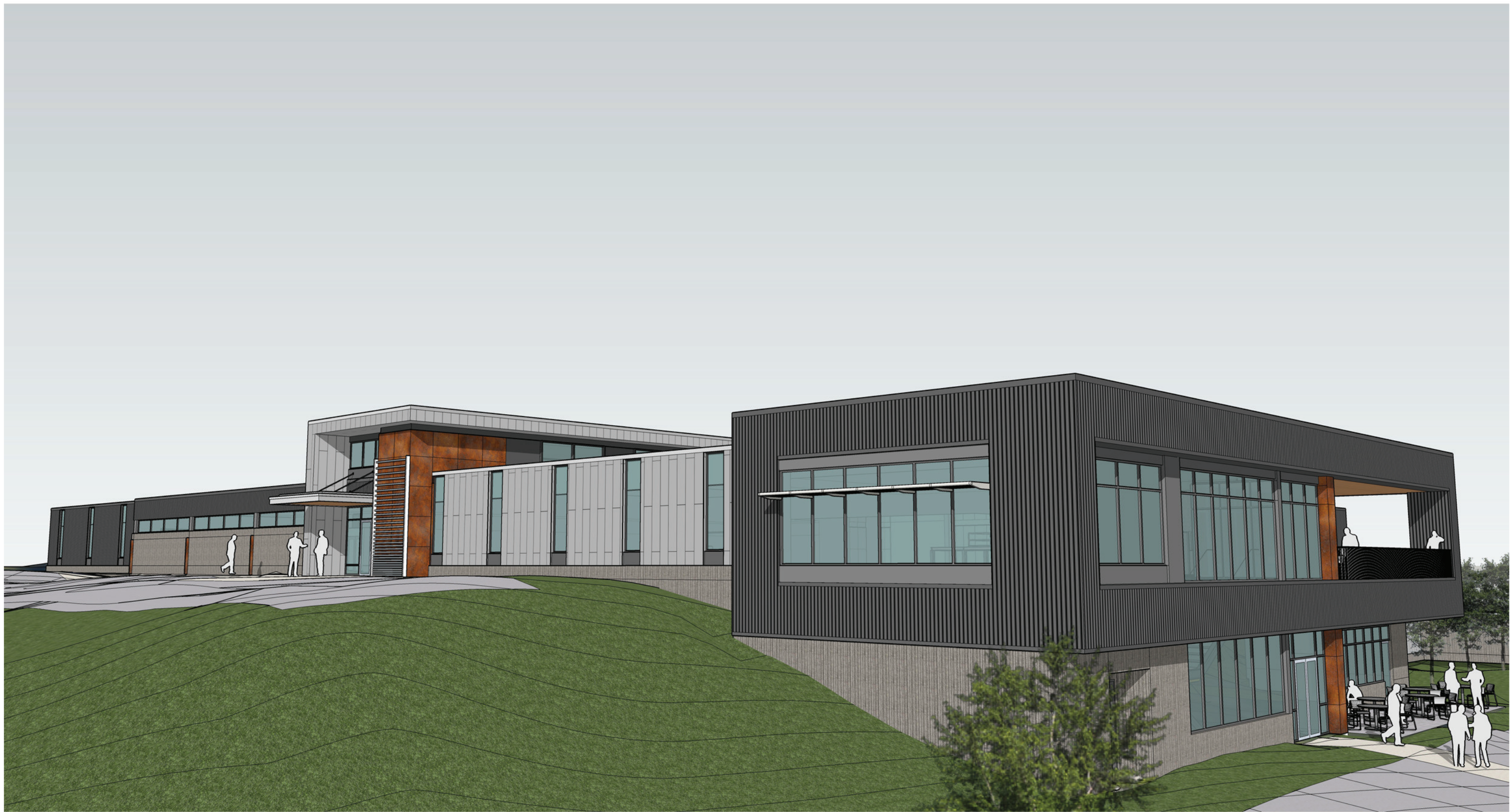
View from Southeast Steamfitters Local 601 training Facility #2015.26.00 February 17, 2016