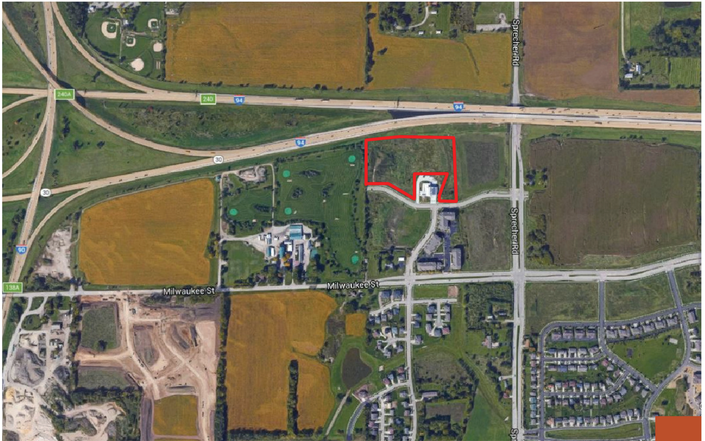
Site Locator Steamfitters Local 601 training Facility #2015.26.00 February 17, 2016