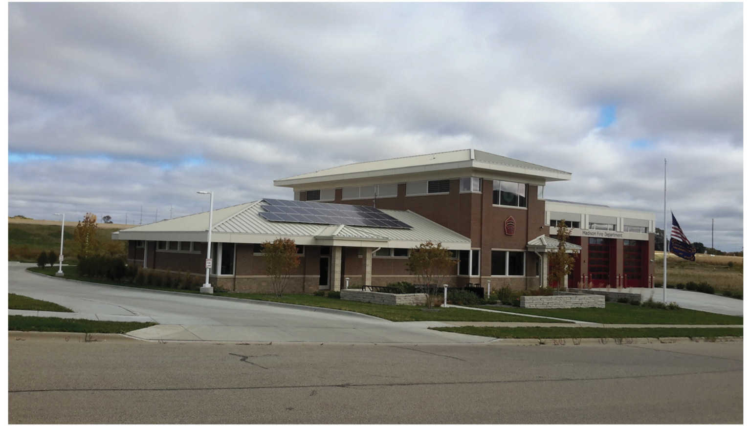
View of Firestation from southwest