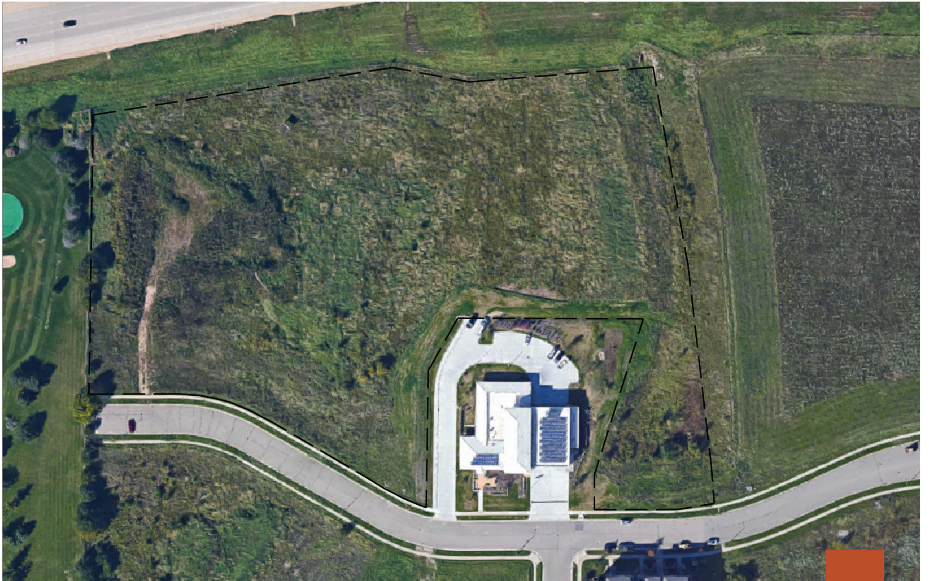
Site Aerial Steamfitters Local 601 training Facility #2015.26.00 February 17, 2016