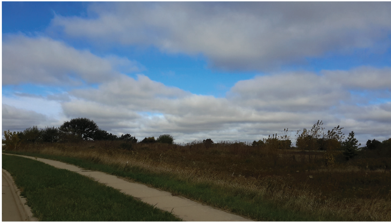
View of the site from the southeast