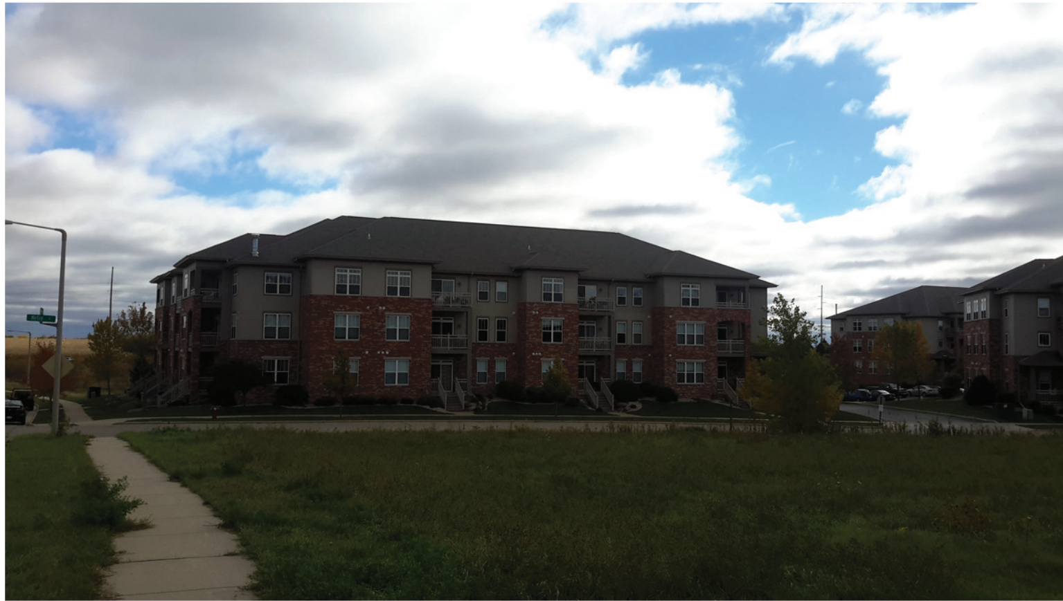
View of apartments