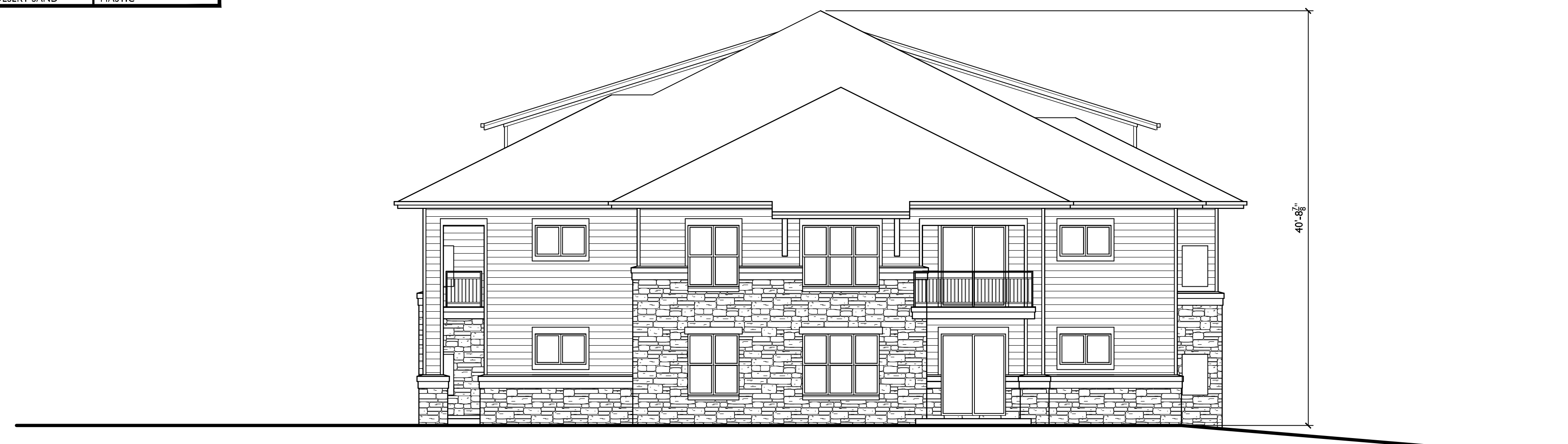
2 NORTH ELEVATION - BUILDING 2 SCALE: 1/8"=1'-0"