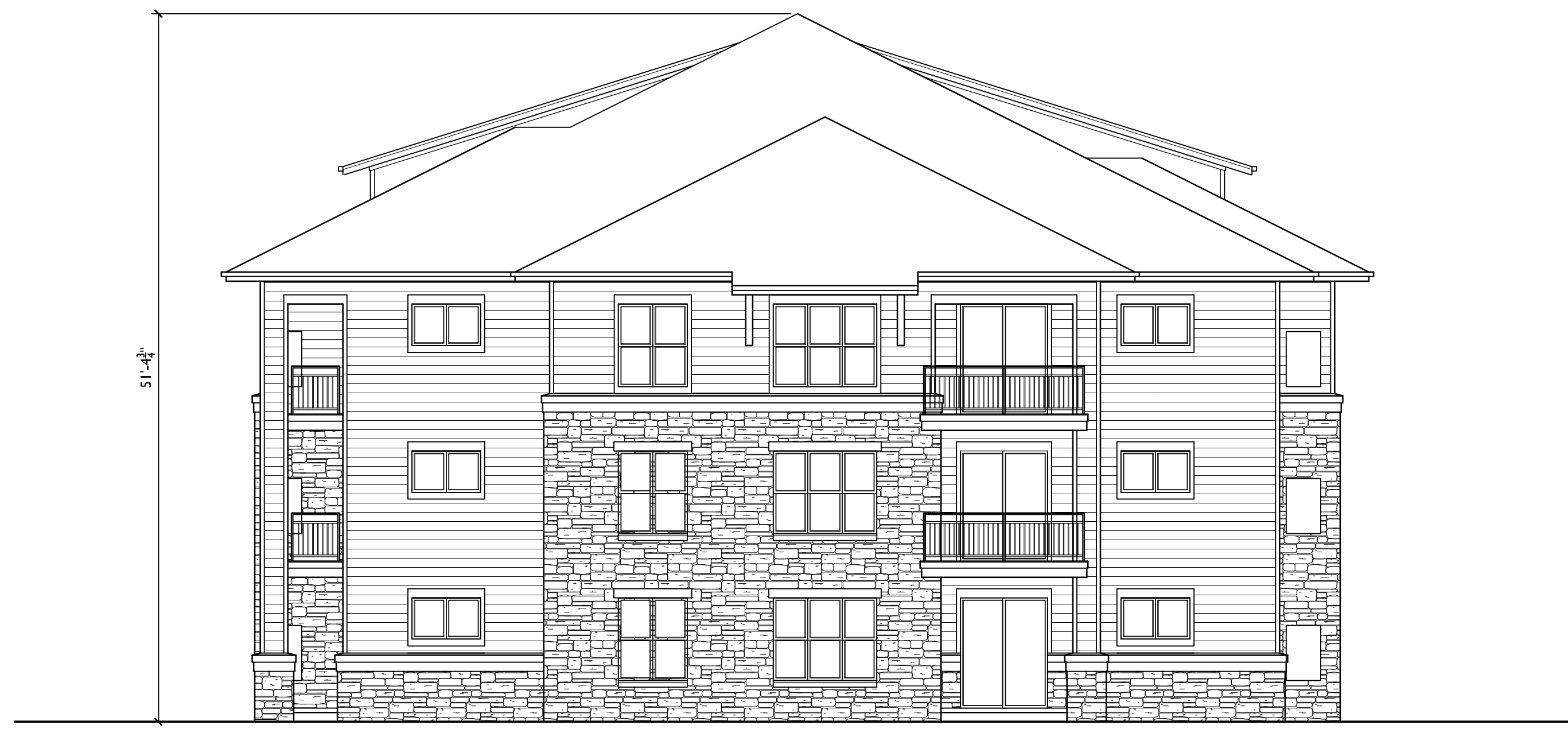
2 EAST ELEVATION - BUILDING 4 SCALE: 1/8"=1'-0"