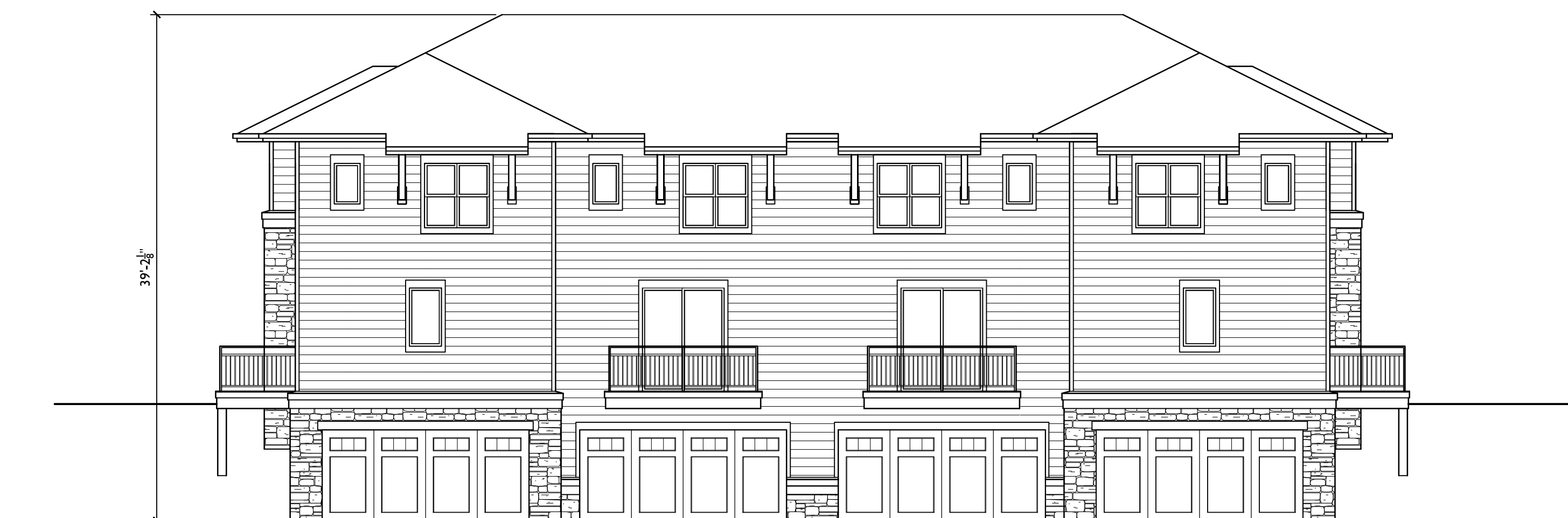
4 WEST ELEVATION - BUILDING 7 37 SCALE: 1/8"=1'-0"

ISSUED Issued For SIP Submittal - August 8, 2014 Minor Alteration - August 25, 2014 Revised Minor Alt - September 12, 2014 Revised - September 15, 2014 Revised SIP - September 18, 2014