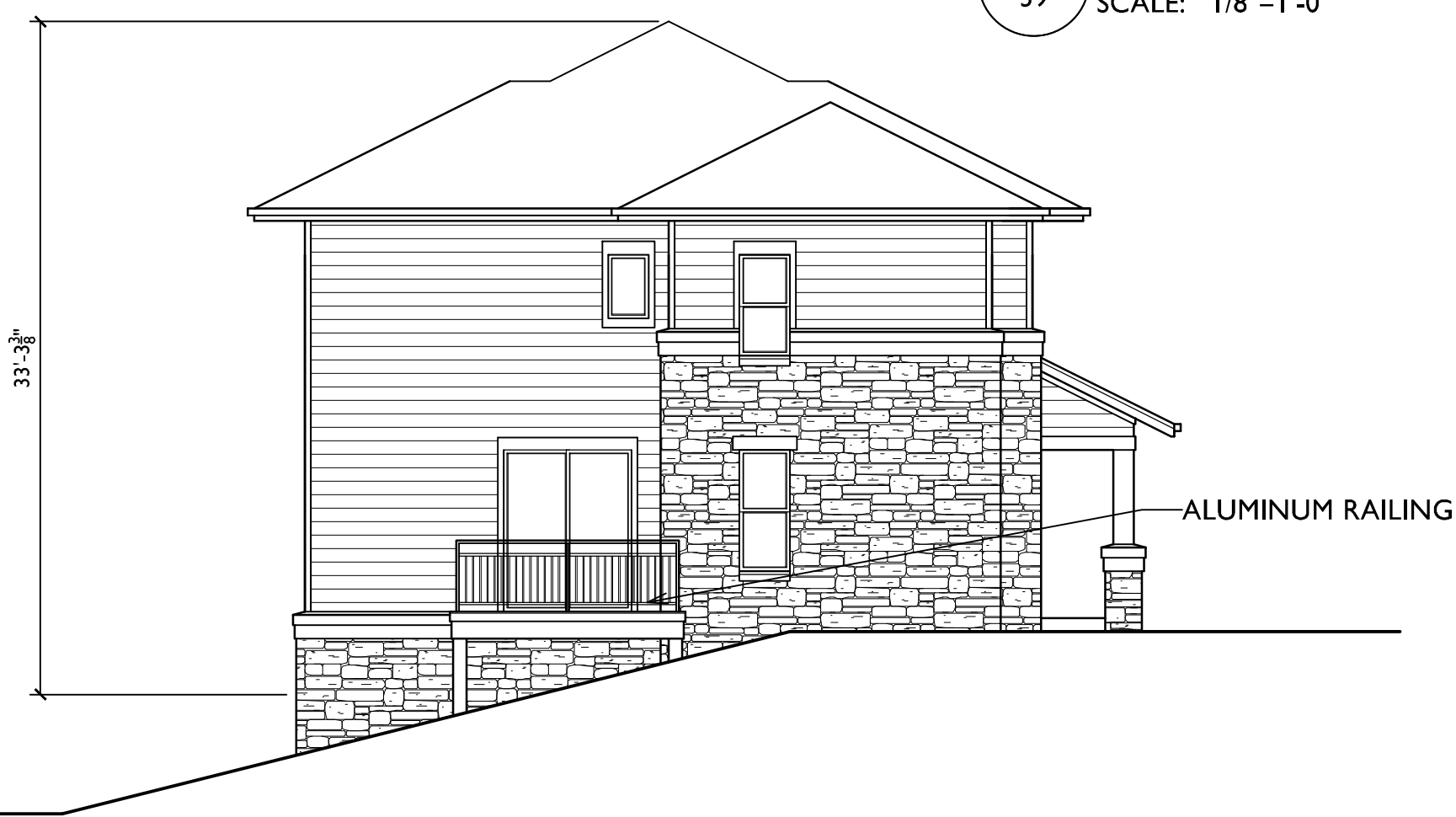
2 SOUTH ELEVATION - BUILDING 8 SCALE: 1/8"=1'-0"