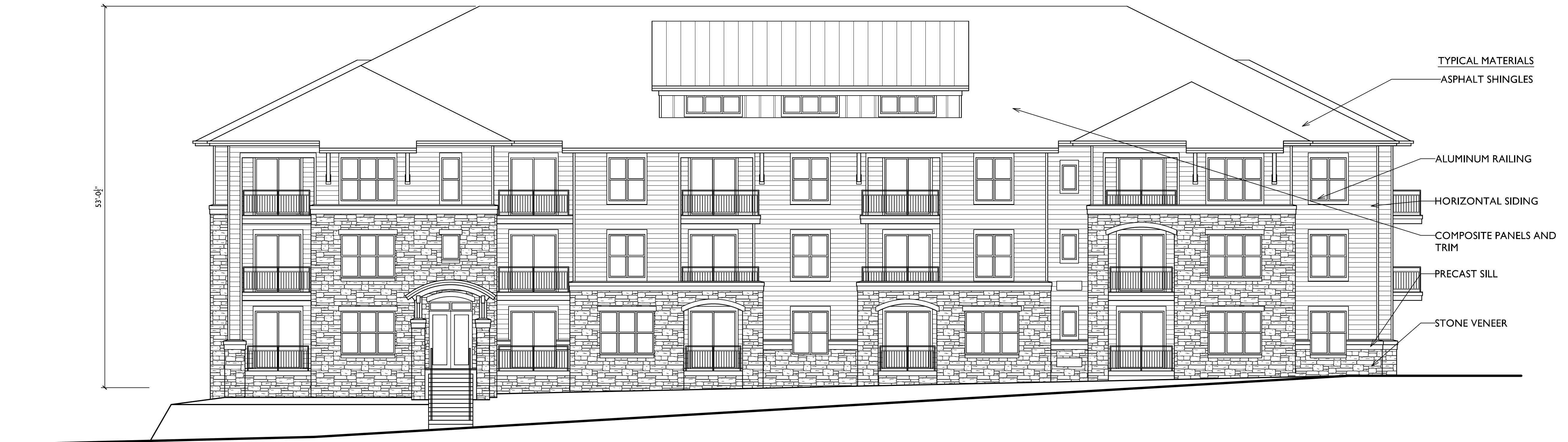
2 SOUTH ELEVATION - BUILDING 10 10 SCALE: 1/8"=1'-0"