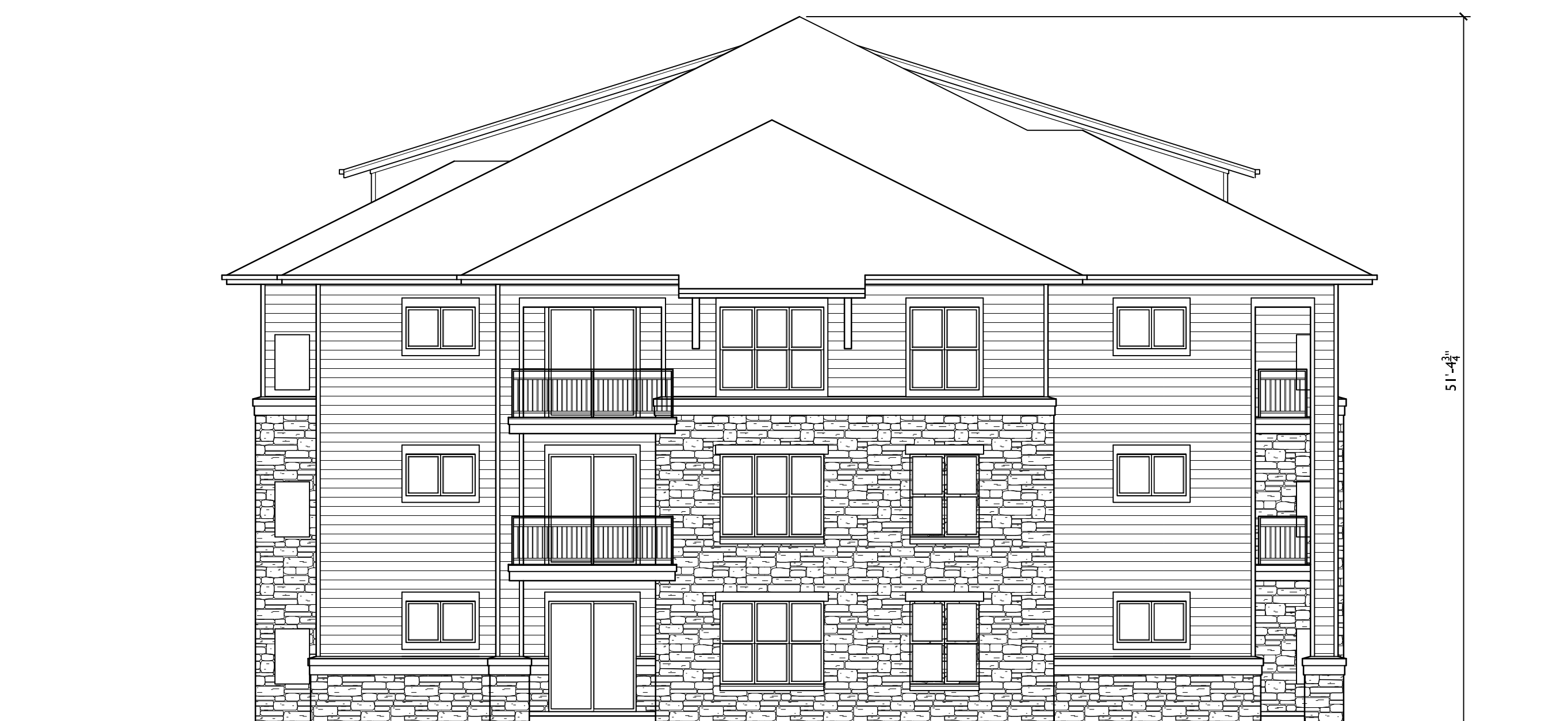
2 32 EAST ELEVATION - BUILDING 5 SCALE: 1/8"=1'-0"