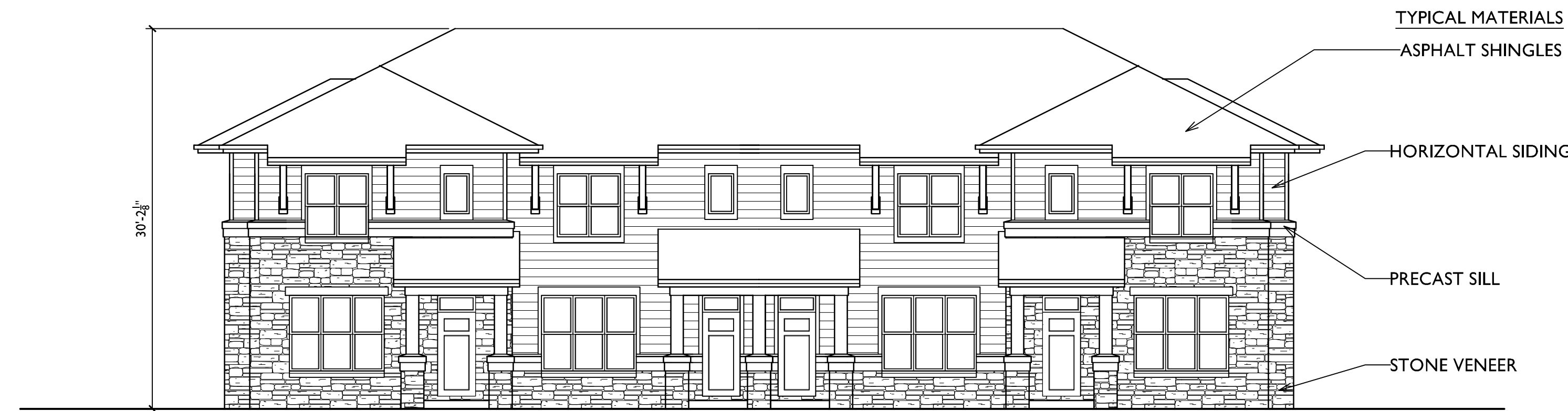
1 EAST ELEVATION - BUILDING 7 37 SCALE: 1/8"=1'-0"