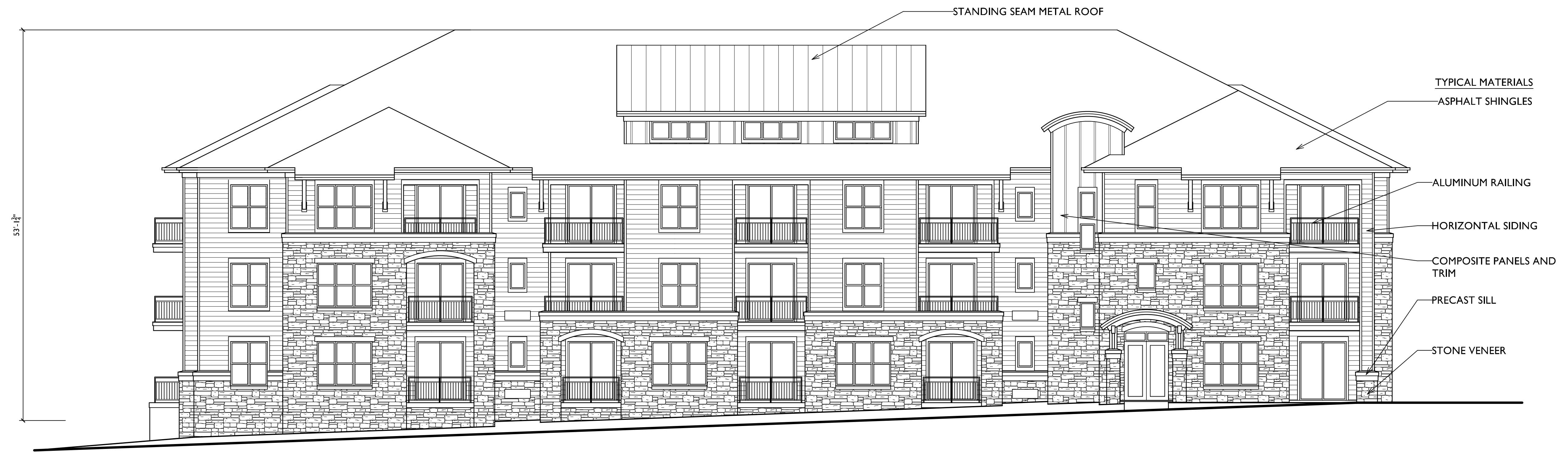
1 SOUTH ELEVATION - BUILDING 4 SCALE: 1/8"=1'-0"