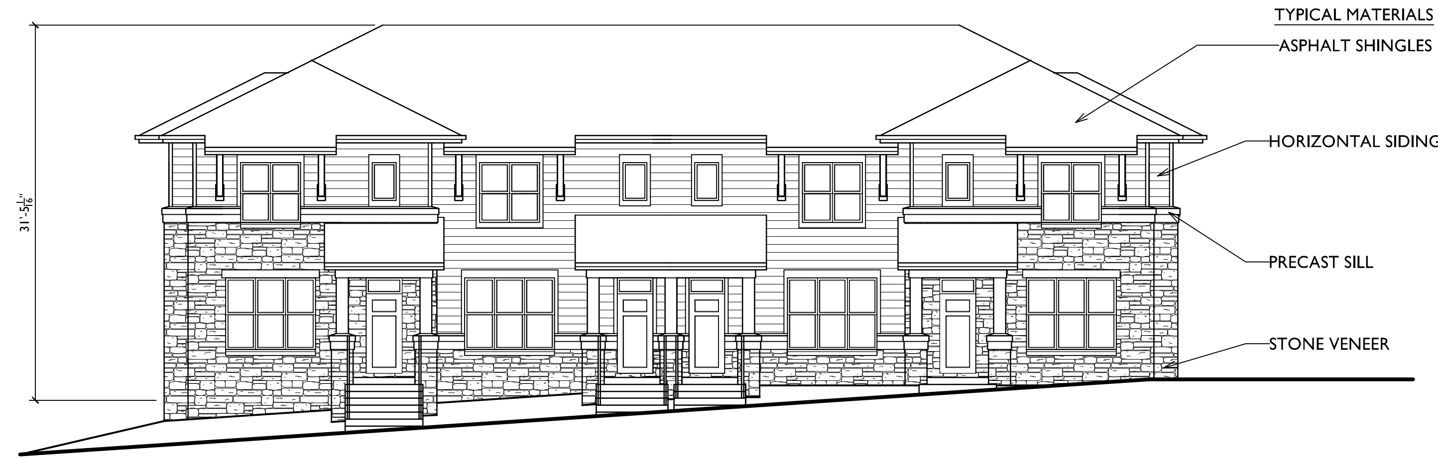
1 36 EAST ELEVATION - BUILDING 6 SCALE: 1/8"=1'-0"