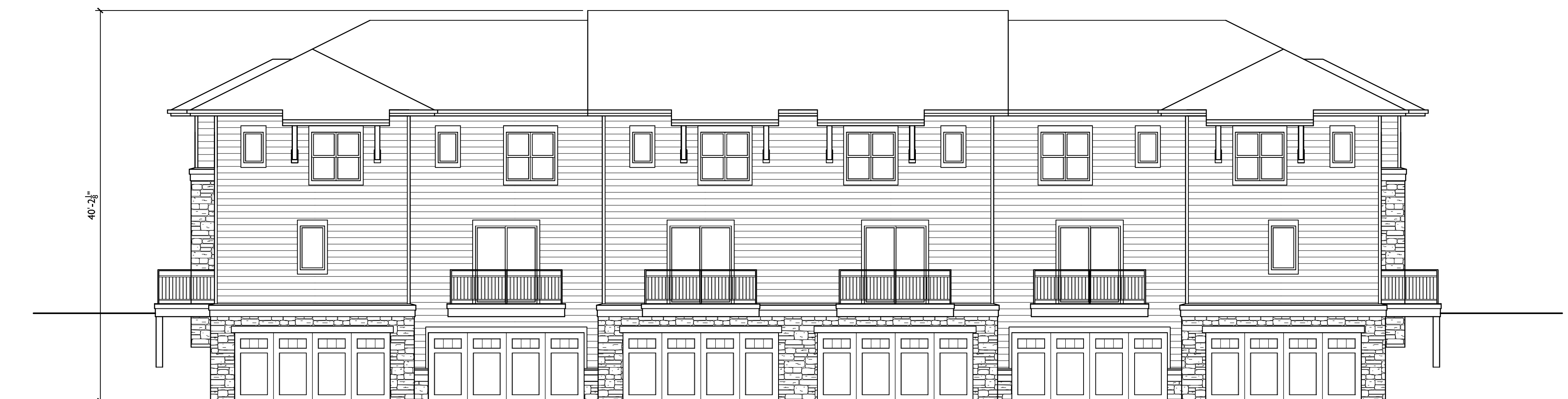
4 WEST ELEVATION - BUILDING 8 SCALE: 1/8"=1'-0"

ISSUED Issued For SIP Submittal - August 8, 2014 Minor Alteration - August 25, 2014 Revised Minor Alt - September 12, 2014 Revised - September 15, 2014 Revised SIP - September 18, 2014