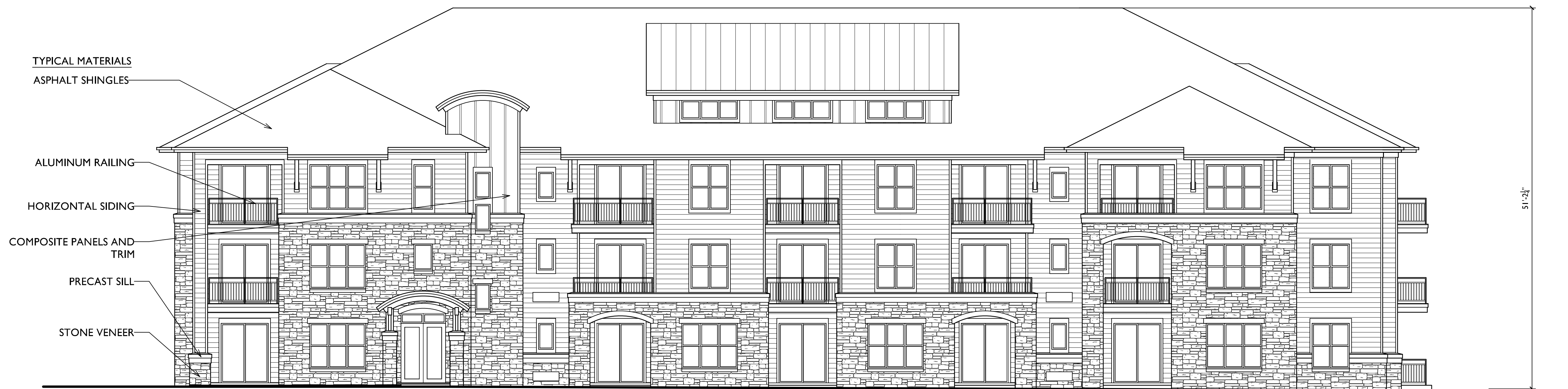
2 NORTH ELEVATION - BUILDING 9 7 SCALE: 1/8"=1'-0"