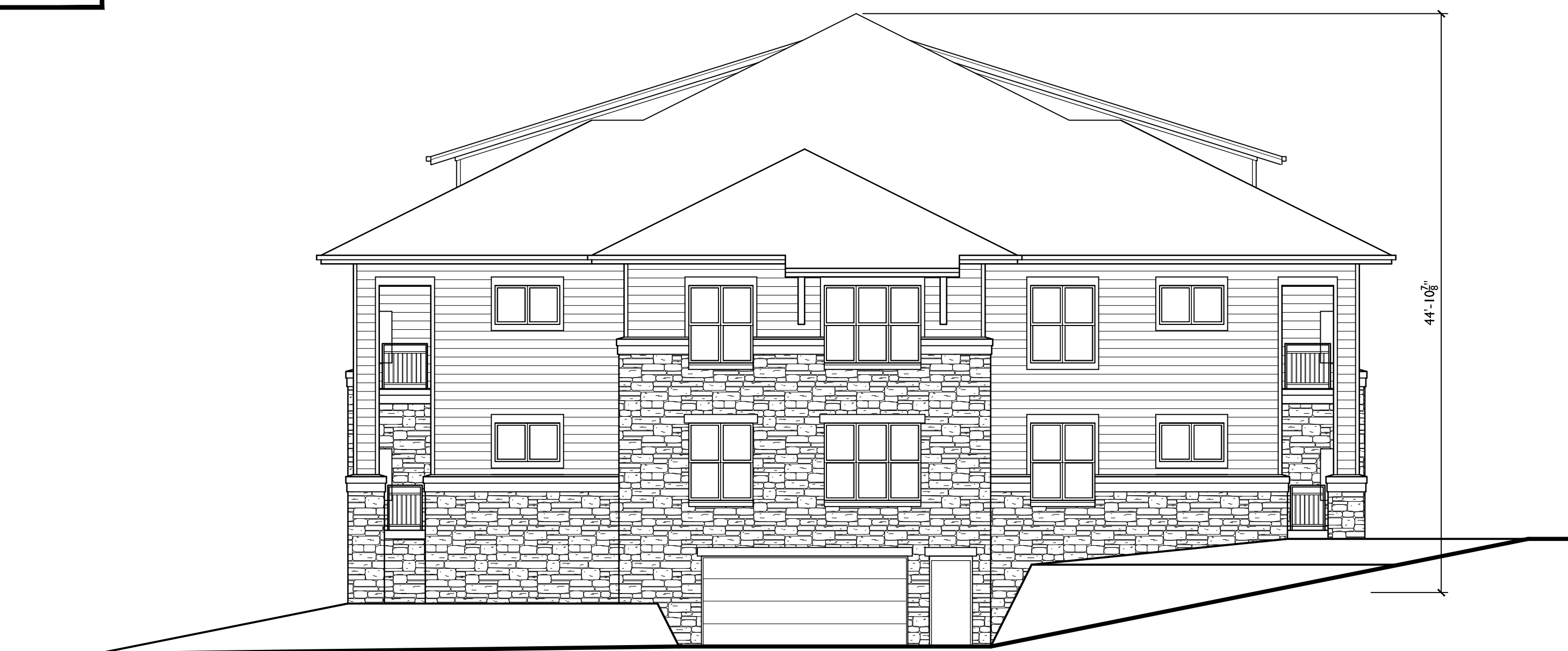
2 SOUTH ELEVATION - BUILDING 2 SCALE: 1/8"=1'-0"