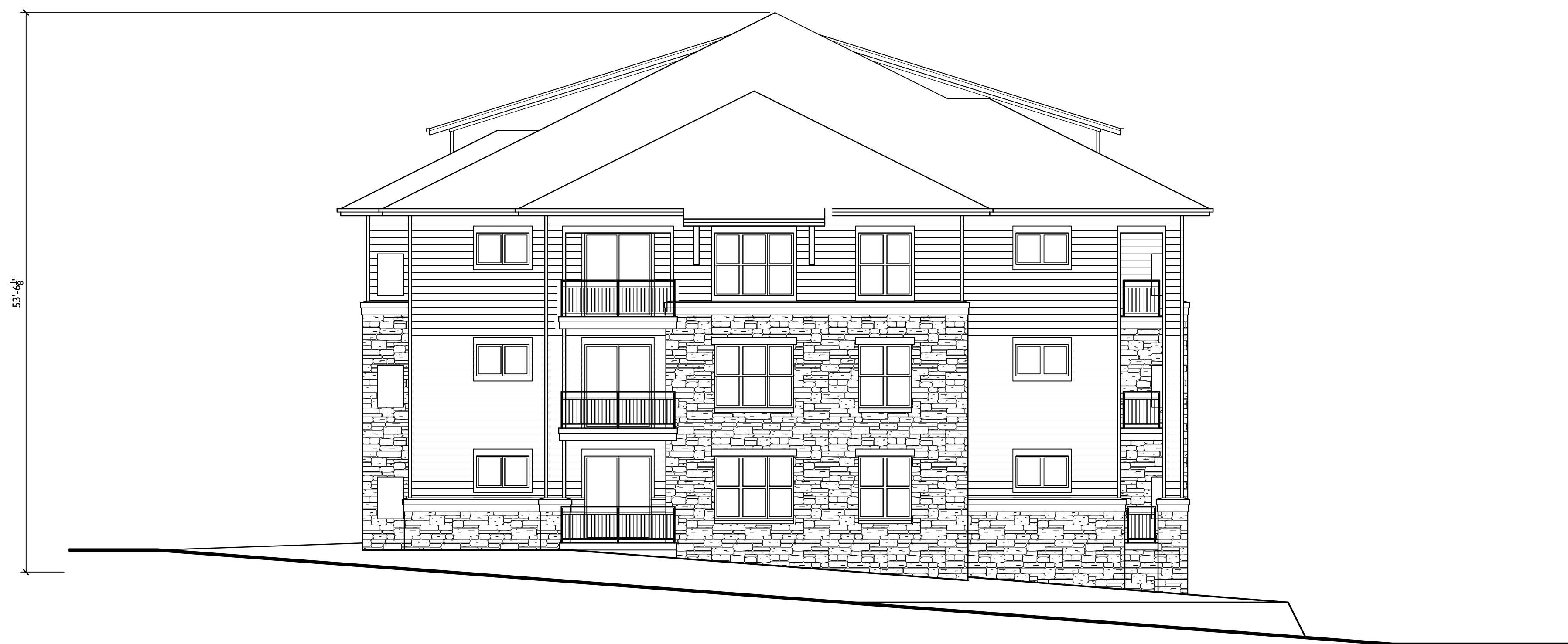
1 WEST ELEVATION - BUILDING 9 SCALE: 1/8"=1'-0"

ISSUED Issued For SIP Submittal - August 22, 2014 Minor Alteration - August 25, 2014 Revised Minor Alt - September 12, 2014 Revised - September 15, 2014 Revised SIP - September 18, 2014