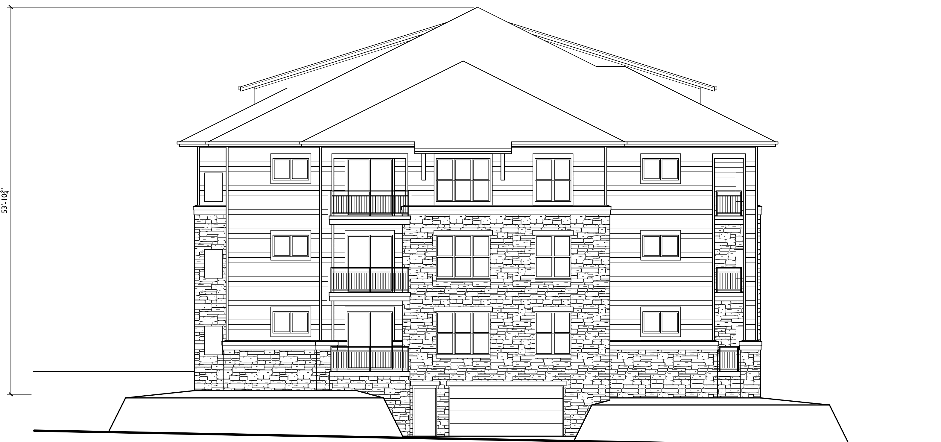
1 WEST ELEVATION - BUILDING 10 10 SCALE: 1/8"=1'-0"