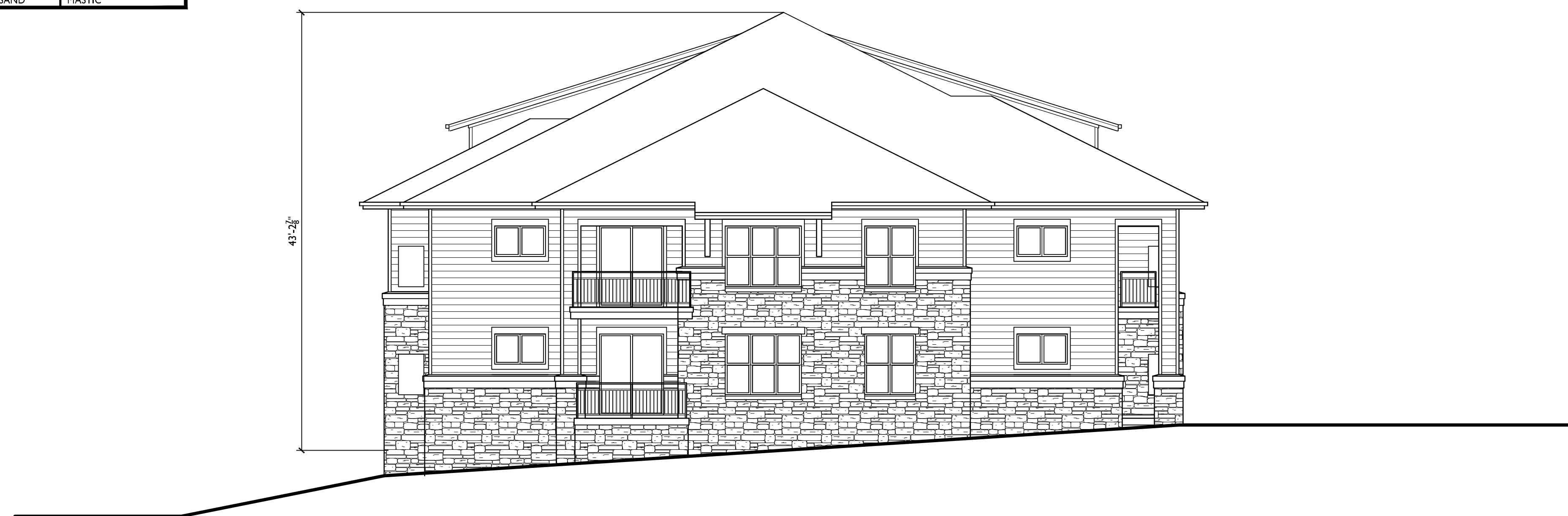
2 SOUTH ELEVATION - BUILDING 1 6 SCALE: 1/8"=1'-0"

ISSUED Issued For SIP Submittal - August 8, 2014 Minor Alteration - August 25, 2014 Revised Minor Alt - September 12, 2014 Revised - September 15, 2014 Revised SIP - September 18, 2014