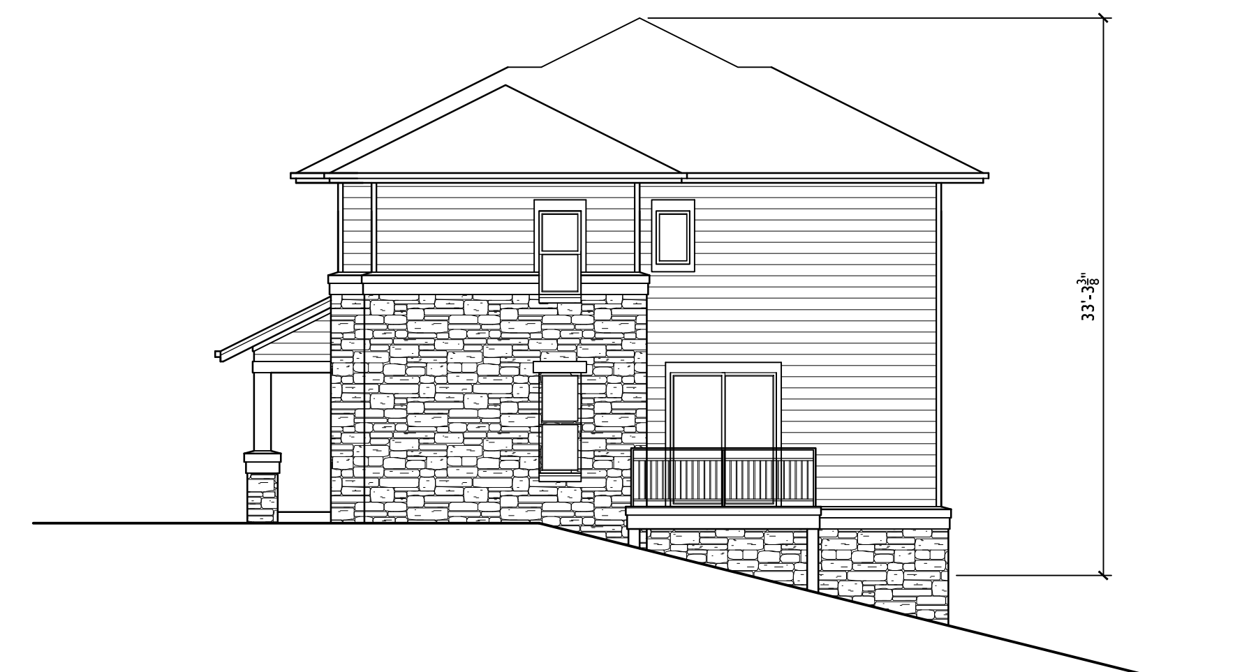
3 NORTH ELEVATION - BUILDING 7 37 SCALE: 1/8"=1'-0"