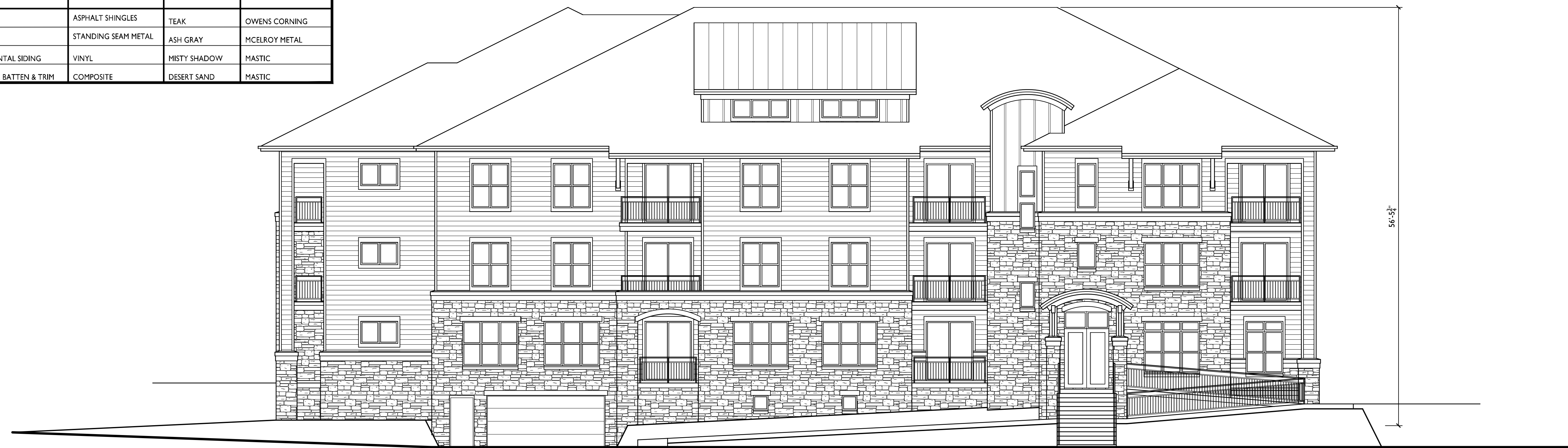
2 WEST ELEVATION - BUILDING 3 18 SCALE: 1/8"=1'-0"

ISSUED Issued For SIP Submittal - August 8, 2014 Minor Alteration - August 25, 2014 Revised Minor Alt - September 12, 2014 Revised - September 15, 2014 Revised SIP - September 18, 2014