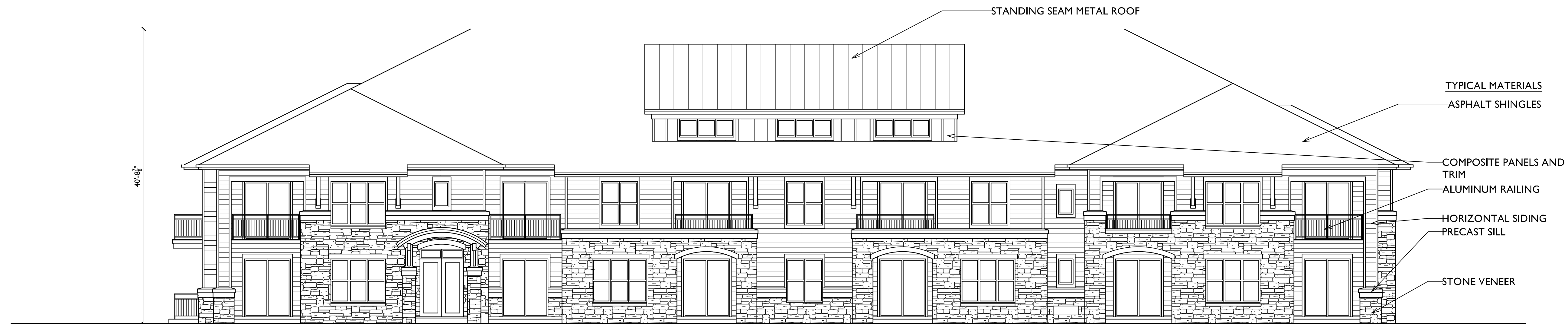
1 EAST ELEVATION - BUILDING I SCALE: 1/8"=1'-0"