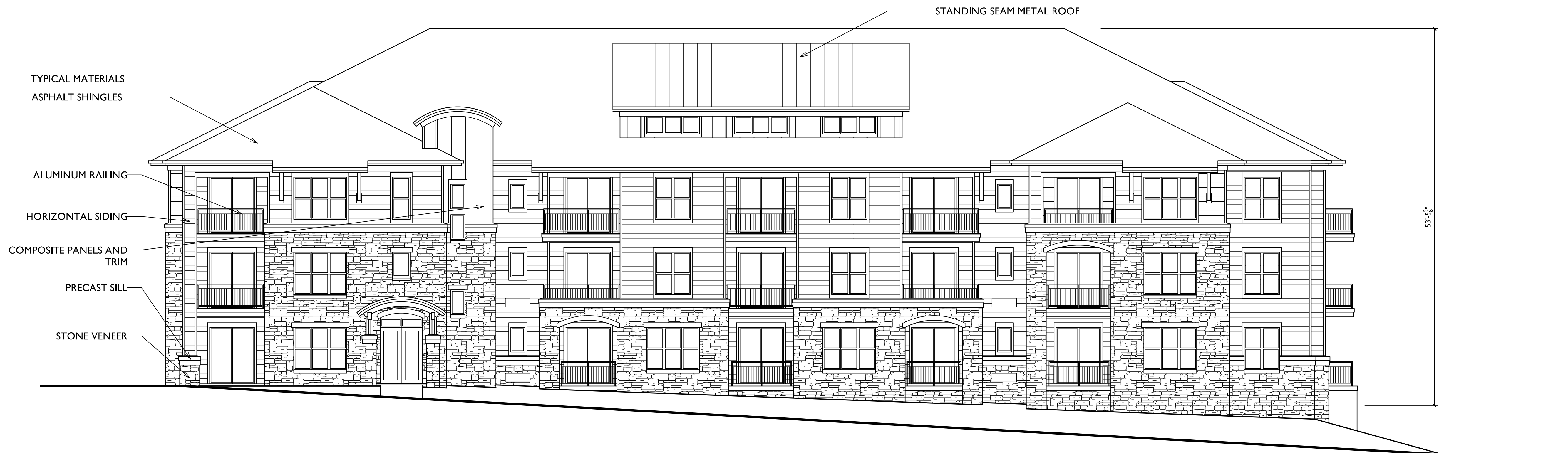
1 32 NORTH ELEVATION - BUILDING 5 SCALE: 1/8"=1'-0"