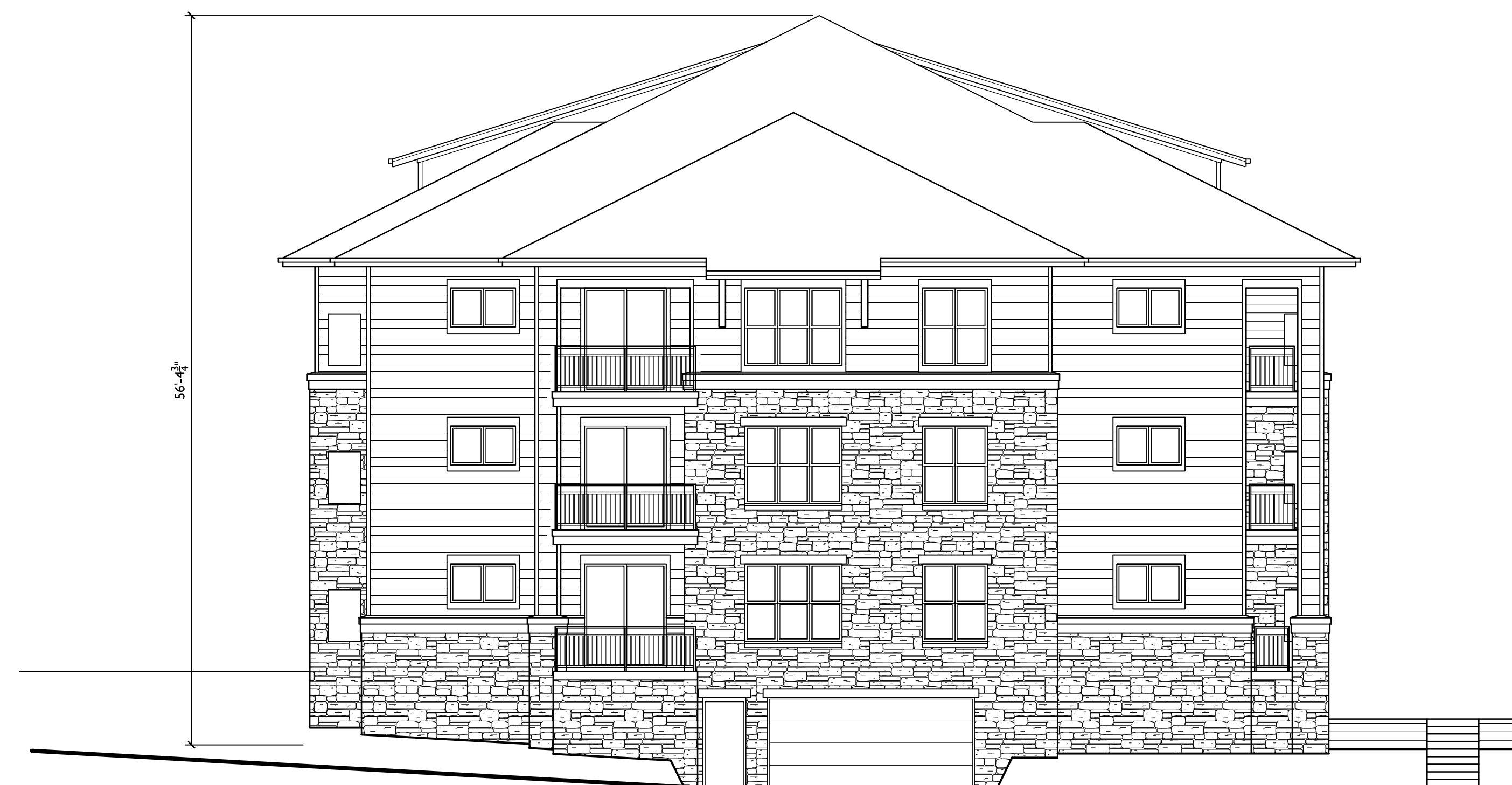
2 33 WEST ELEVATION - BUILDING 5 SCALE: 1/8"=1'-0"