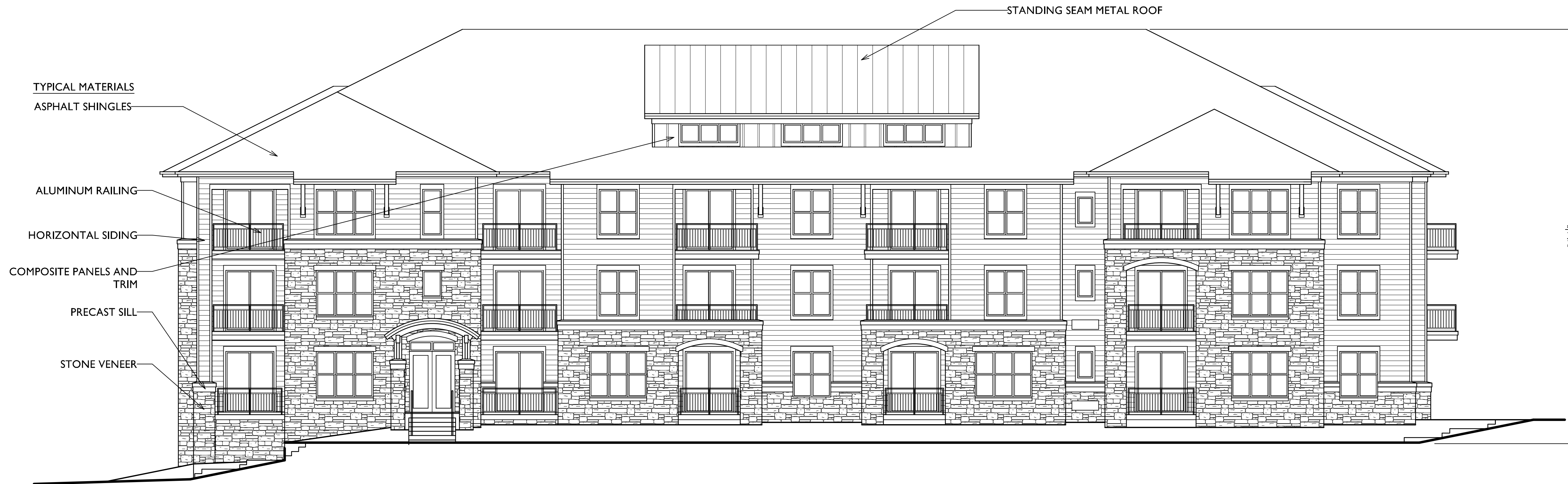
1 33 SOUTH ELEVATION - BUILDING 5 SCALE: 1/8"=1'-0"