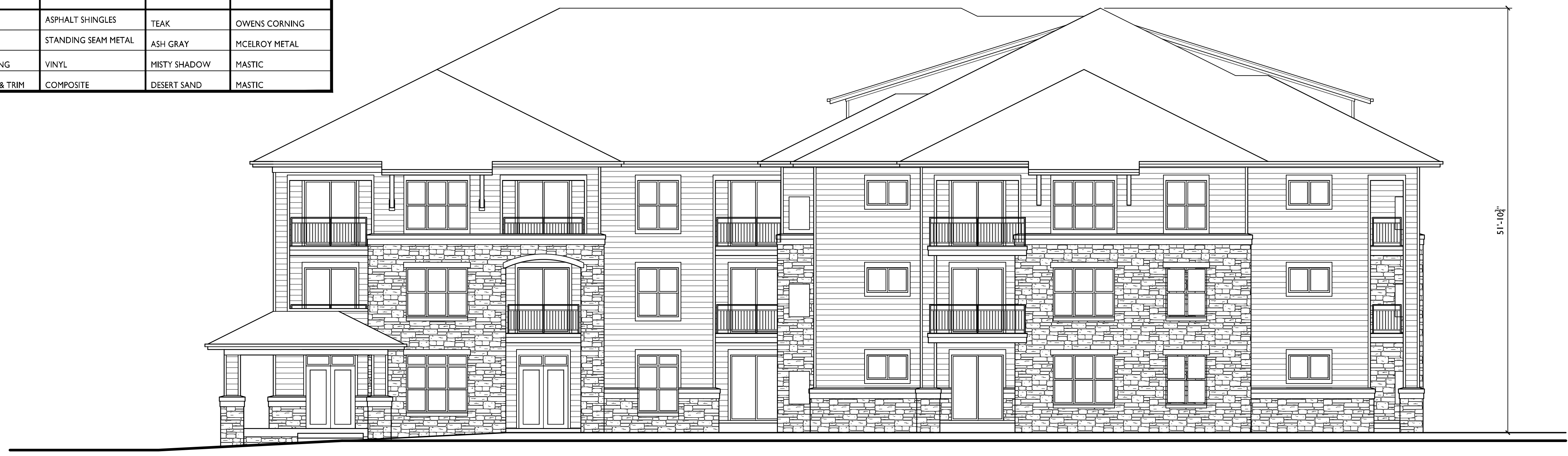
EAST ELEVATION - BUILDING 3 SCALE: 1/8"=1'-0"