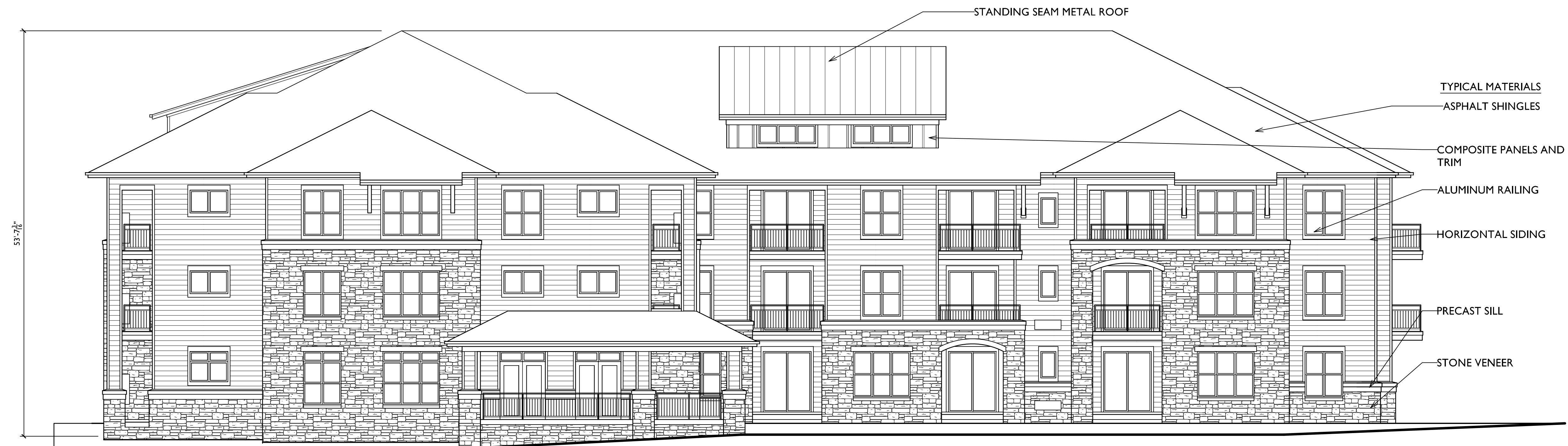
SOUTH ELEVATION - BUILDING 3 SCALE: 1/8"=1'-0"

ISSUED Issued For SIP Submittal - August 8, 2014 Minor Alteration - August 25, 2014 Revised Minor Alt - September 12, 2014 Revised - September 15, 2014 Revised SIP - September 18, 2014