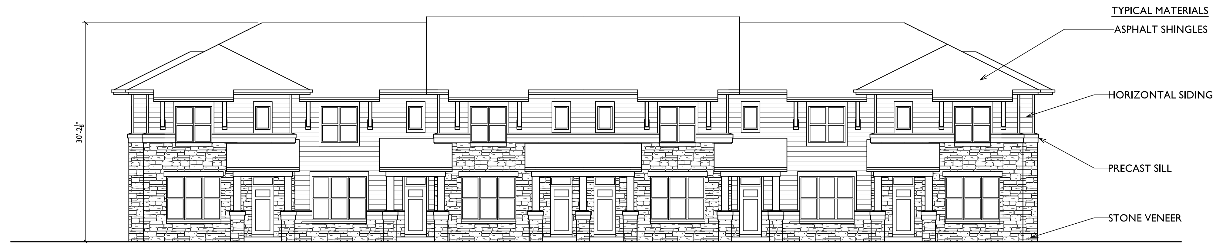
1 EAST ELEVATION - BUILDING 8 SCALE: 1/8"=1'-0"