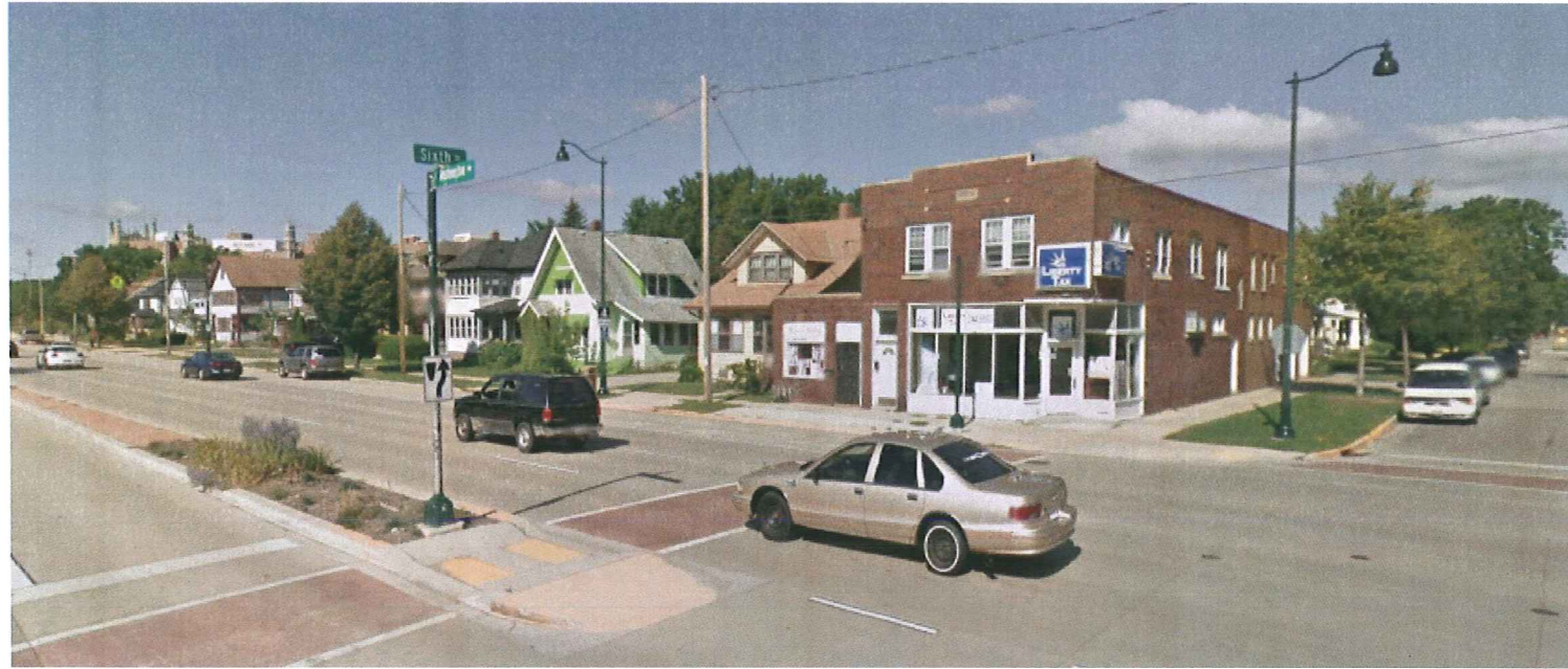
6th Street and E. Washington Ave. - Looking West