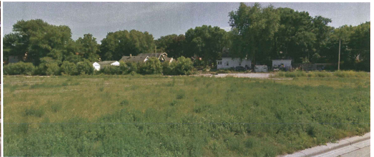
Winnegabo Street - Looking South