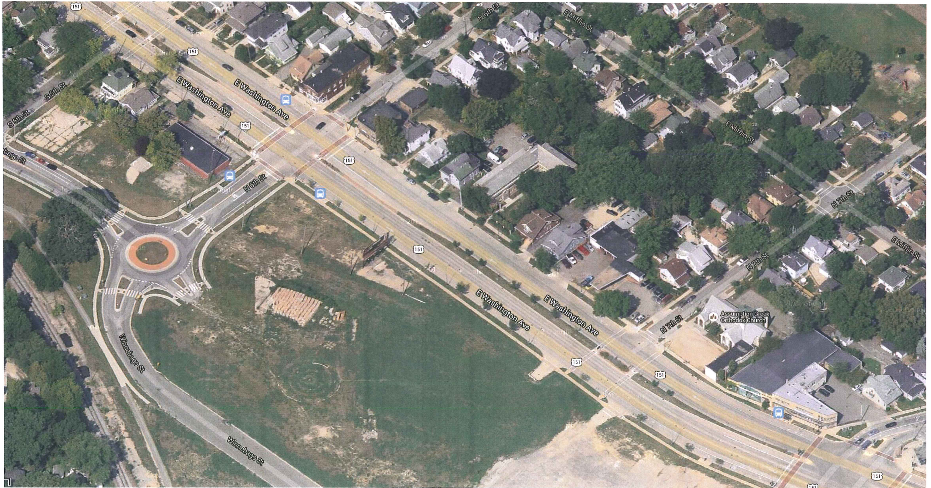
Aerial View Looking West