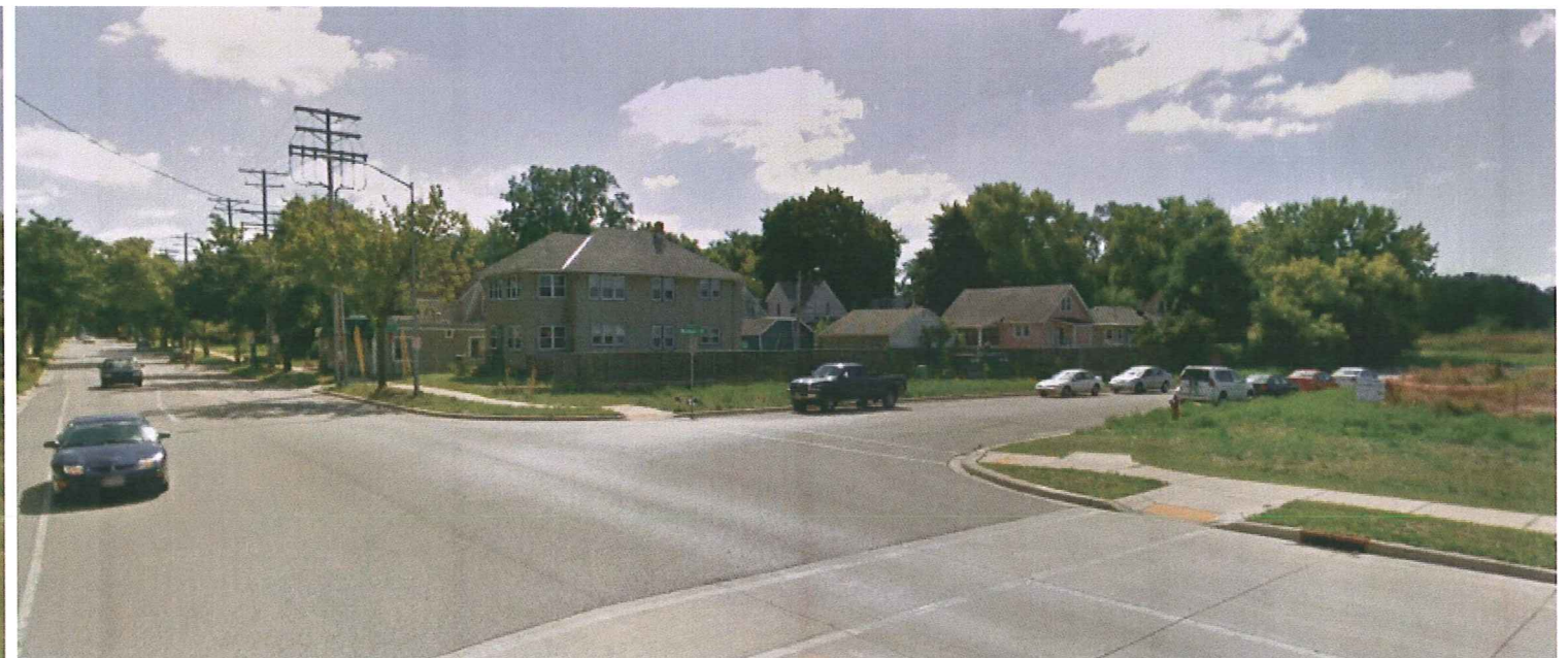
Milwaukee Street and Winnegabo - Looking South