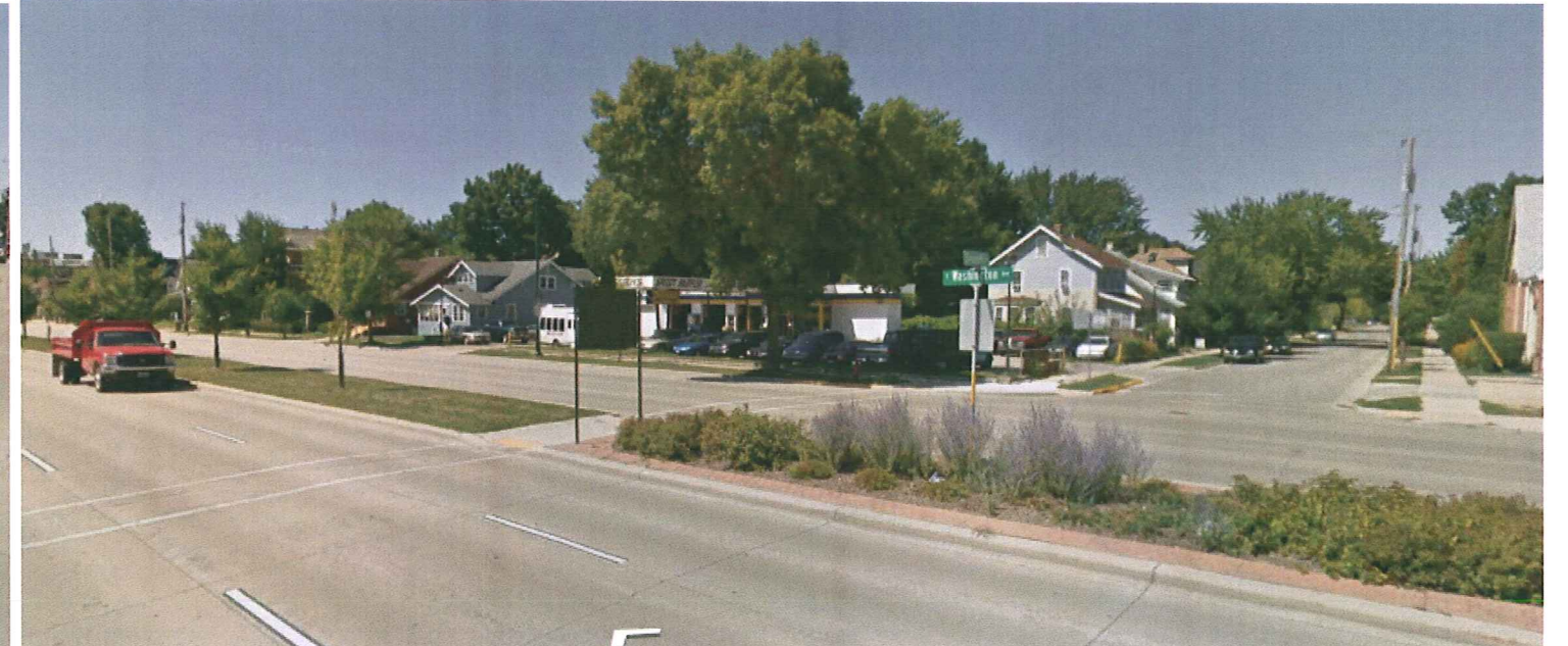
7th Street and E. Washington Ave. - Looking West