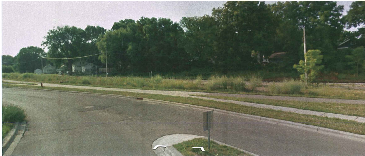
6th Street and Winnegabo Street - Looking East