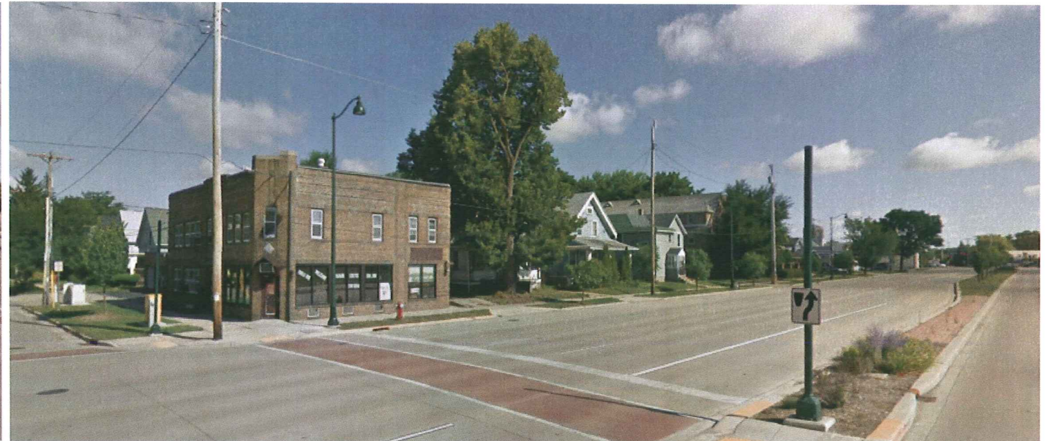
6th Street and E. Washington Ave. - Looking North