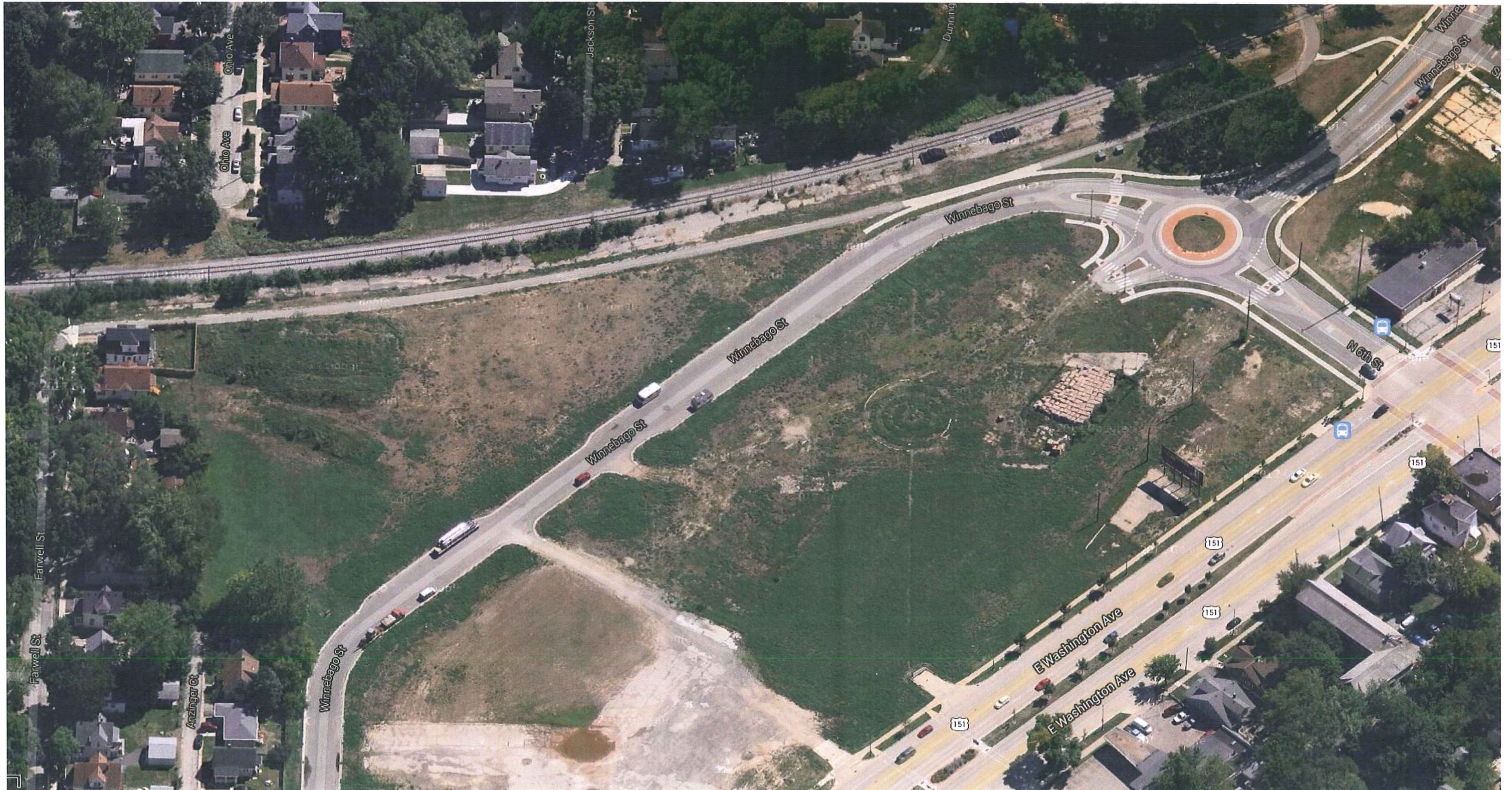
Aerial View Looking South