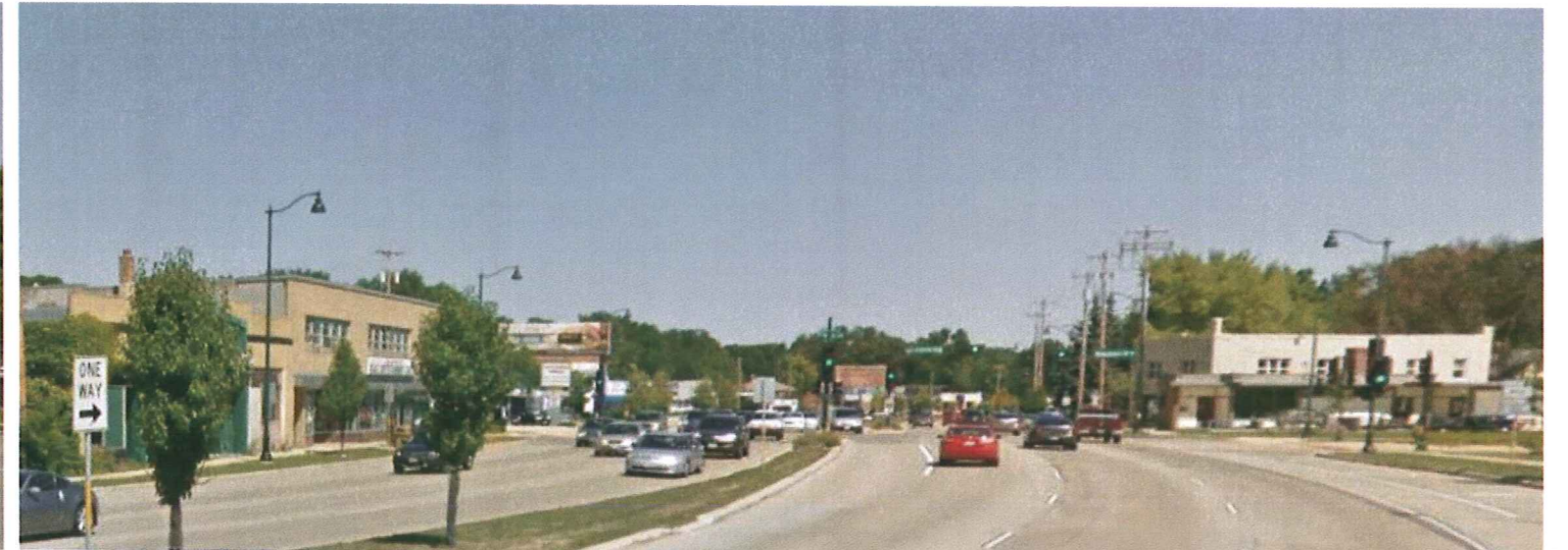
7th Street and E. Washington Ave. - Looking North