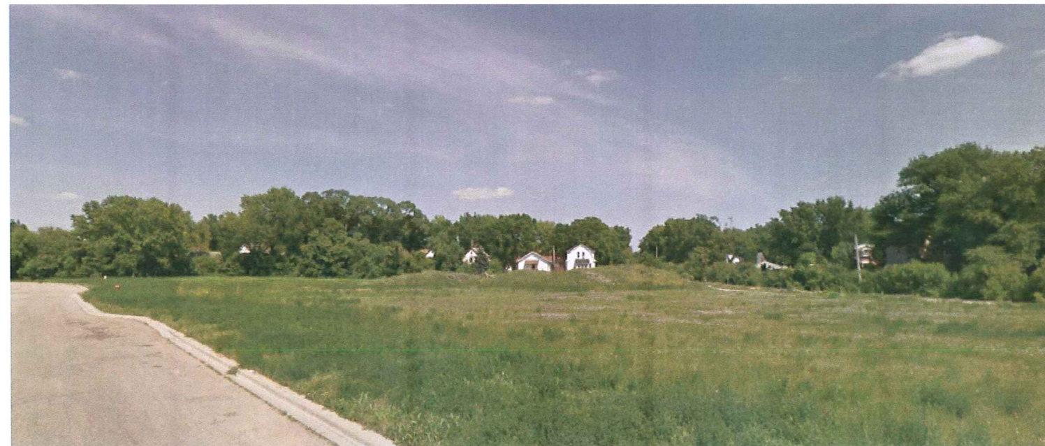
Winnegabo St. - Looking East