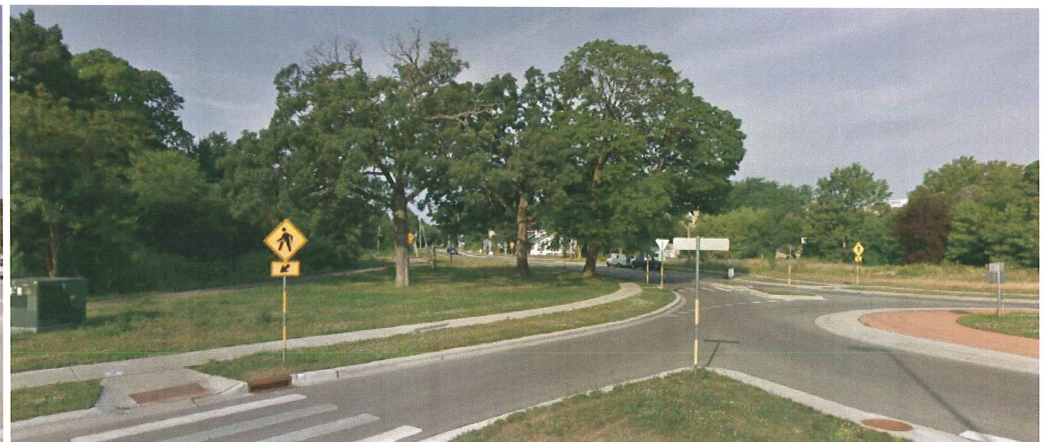
6th Street and Winnebago - Looking Southwest