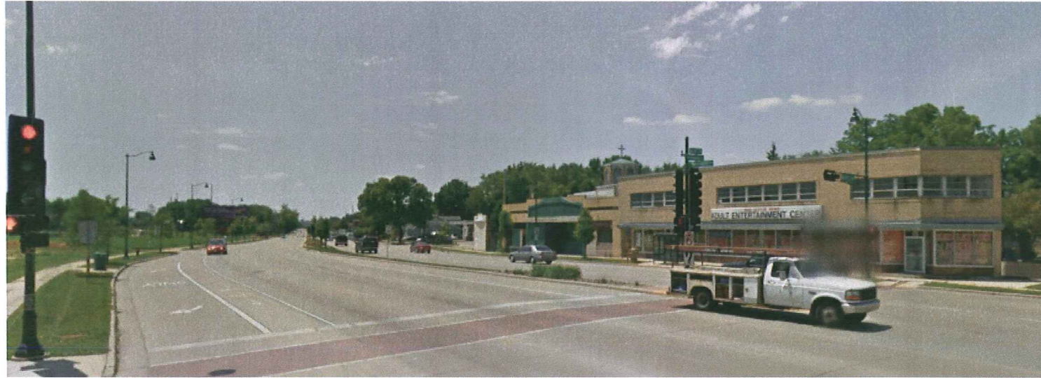
E. Washington Ave. and Milwaukee Street - Looking West