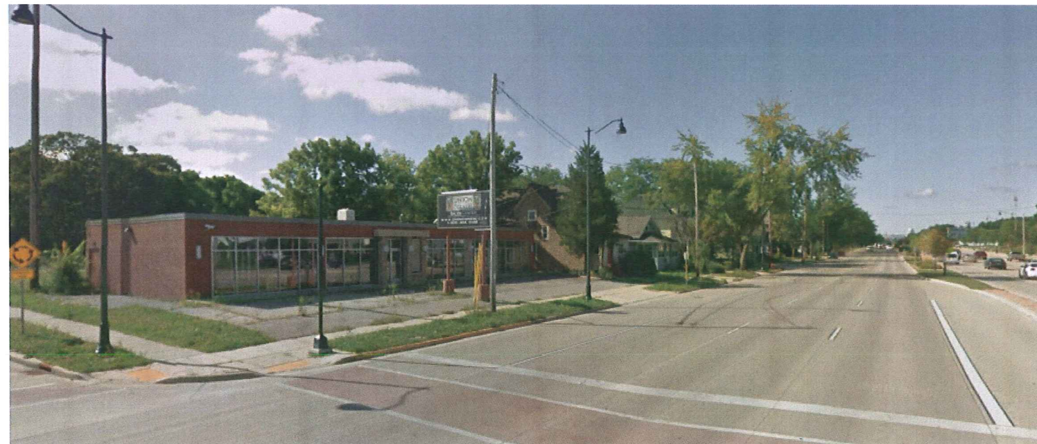
6th Street and E. Washington Ave. - Looking South