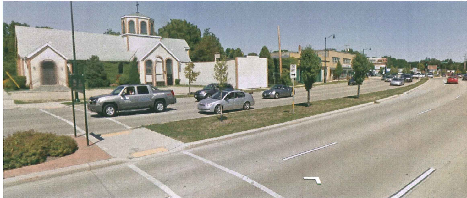
7th Street and E. Washington Ave. - Looking Northwest