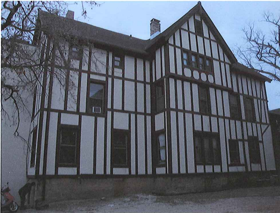
Image showing the east exterior of the building. The floor deformations are occurring generally in the longer joist spans of the middle third of the building; in the section under the east west framed gable.