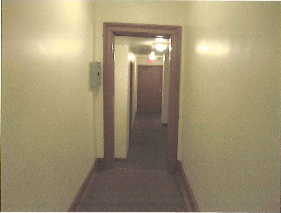
Image showing the sloping in the corridor of second floor from west downward to the east.