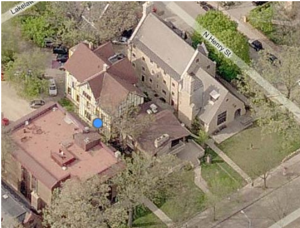
Bing maps image