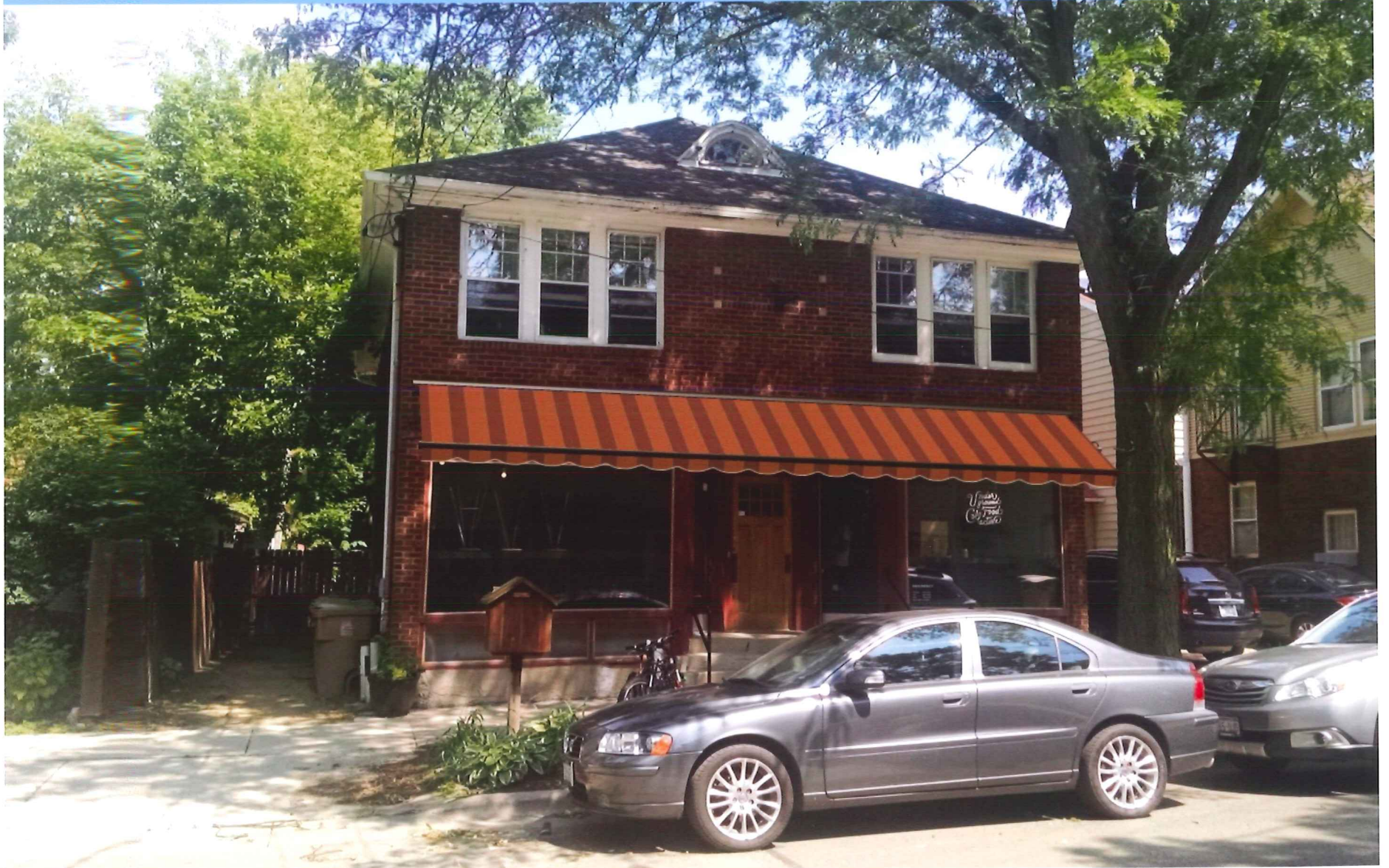
DIGITAL MOCK-UP: AWNING (COLOR MAY CHANGE)