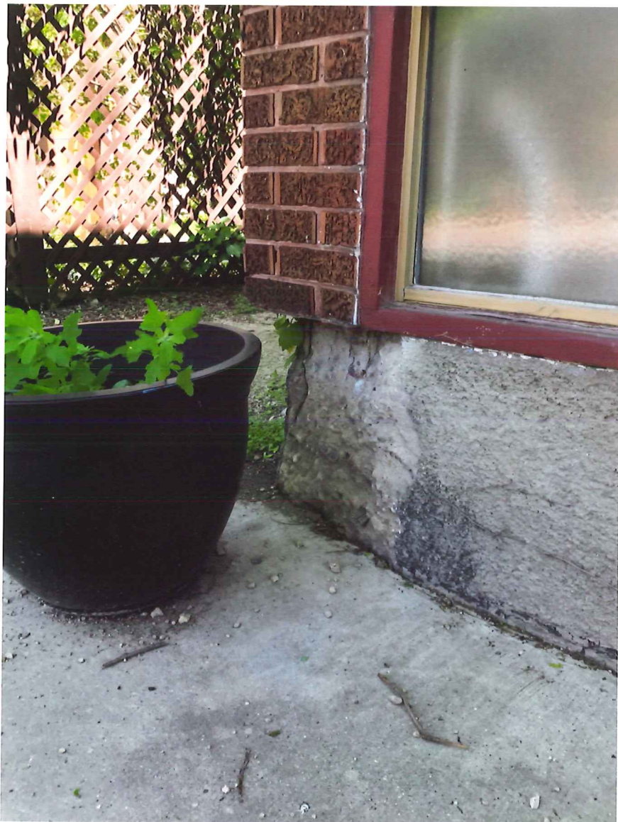
Storefront detail. Both front corners are crumbling and in need of repair. Currently hidden by flower pots.