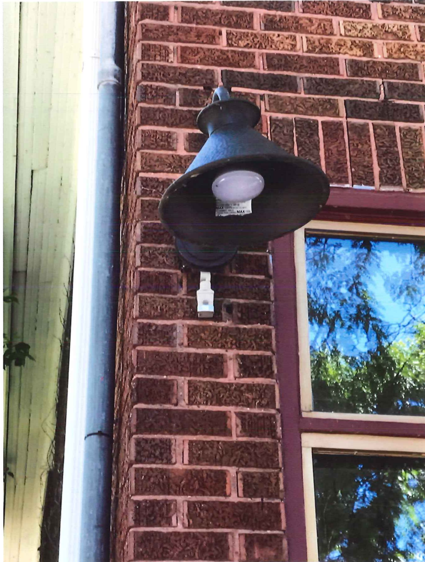
Storefront exterior with non-original lighting