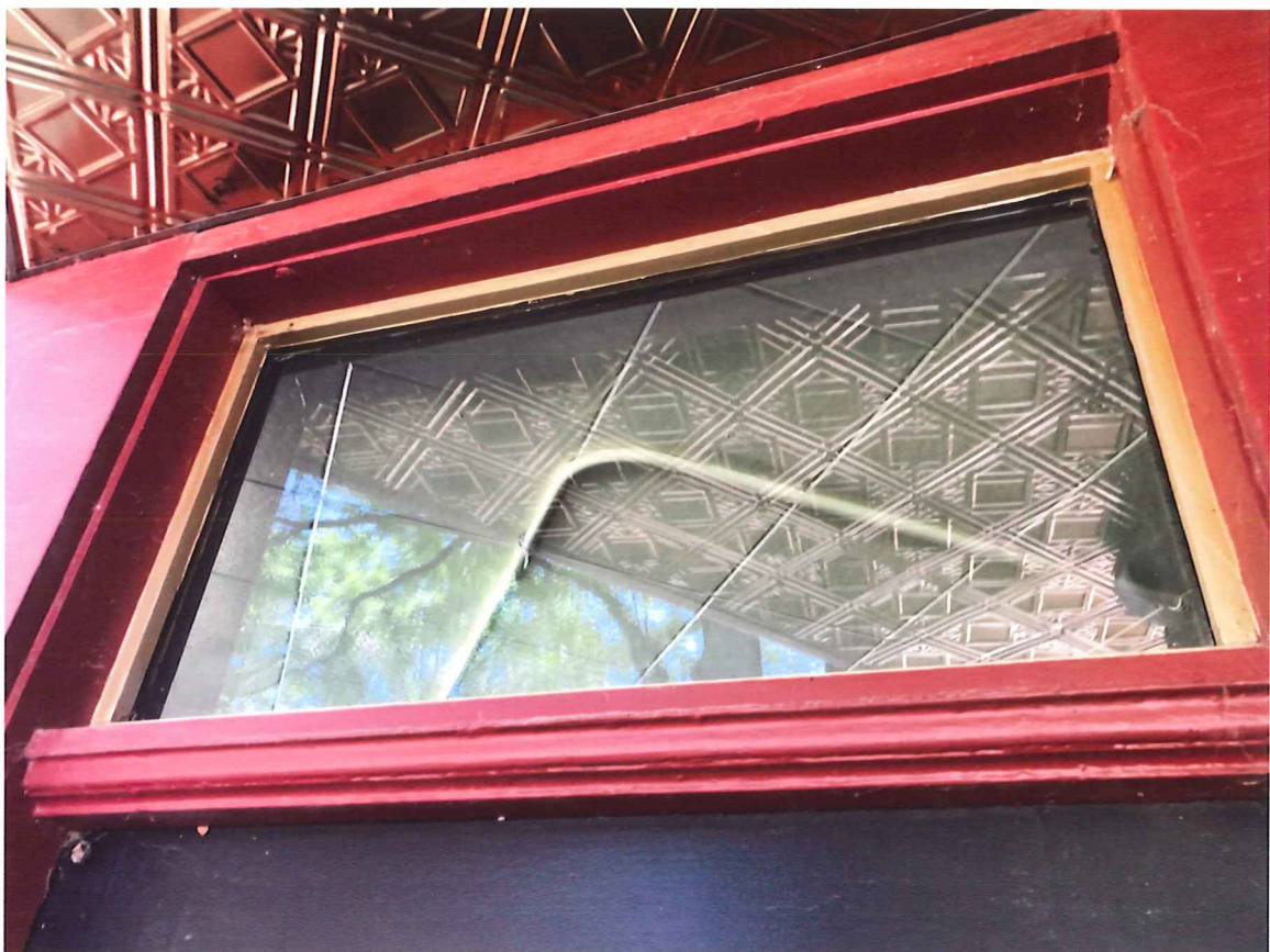
North door transom