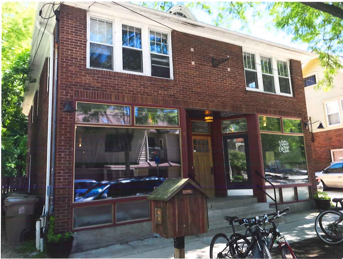
West elevation (Allen St.)