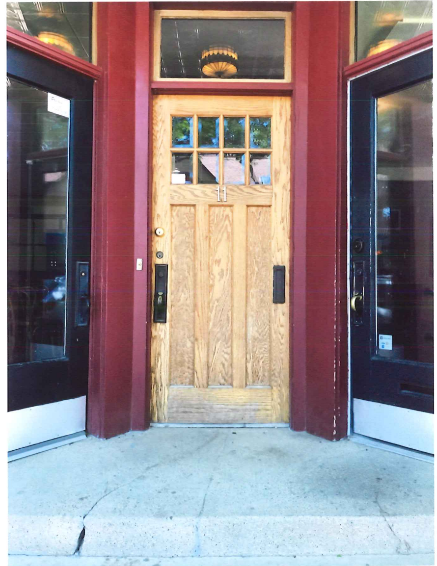
Residential entrance. Non-original door.