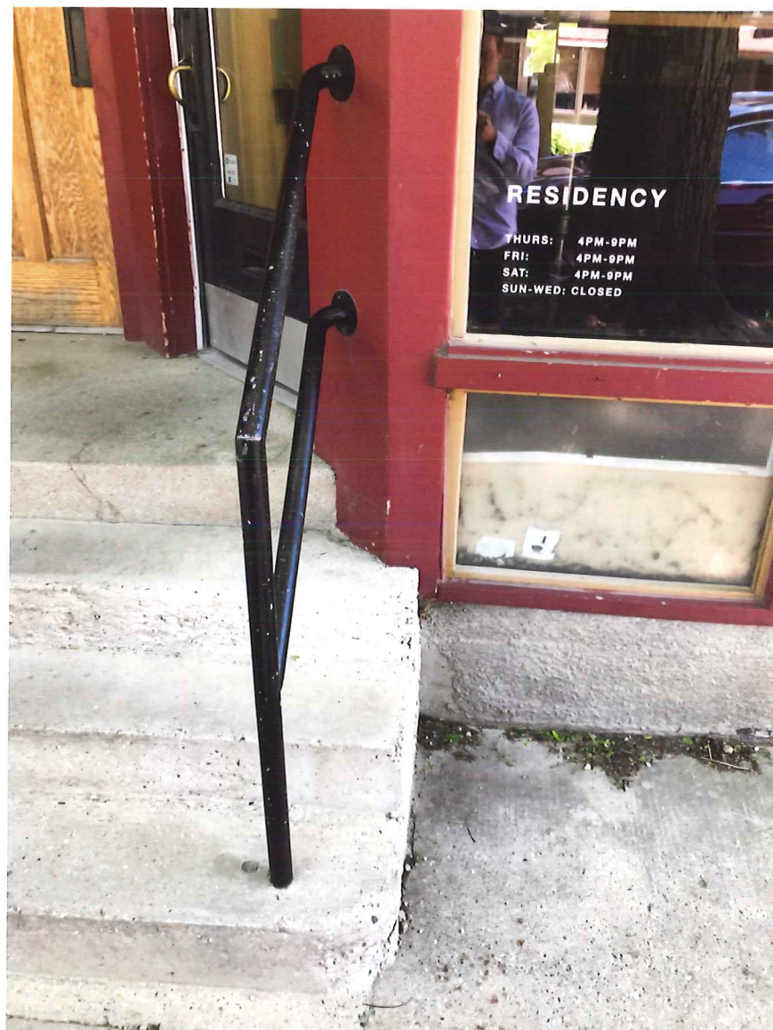
Storefront detail. Railings and windows are newer replacements.