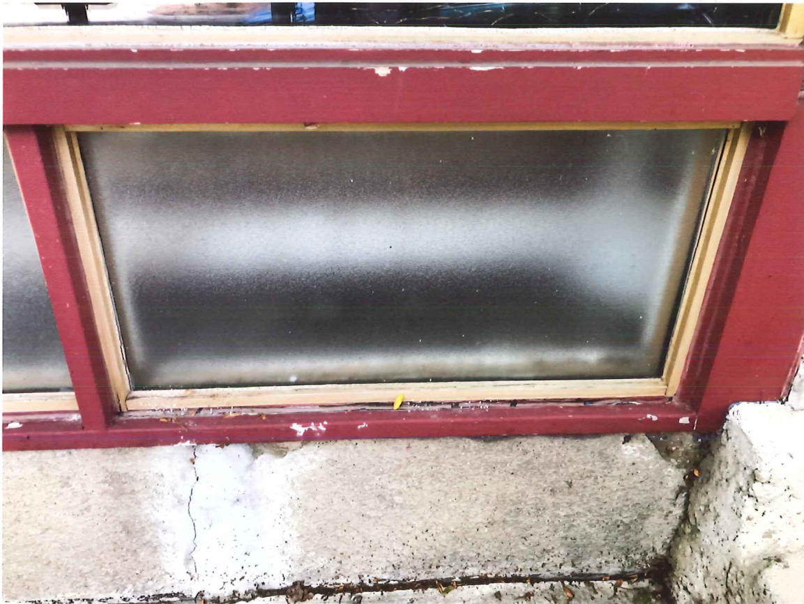
Facade trim condition