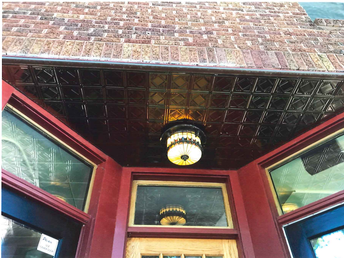
Exterior detail on storefront. Ceiling covering and fixture are non-original. Center transom may be older, side transoms are newer replacements