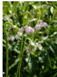
This Nodding Onion native plant is just one example of several different native plants residents can choose when planning to adopt an available median on the City's new Adopt-A-Median Map.

Finally, know that your volunteer efforts are appreciated! The Adopt-A-Median program is one way for residents to get involved in improving public infrastructure. You are helping to reduce the cost to the City for median maintenance while improving the overall appearance and environment in Madison.