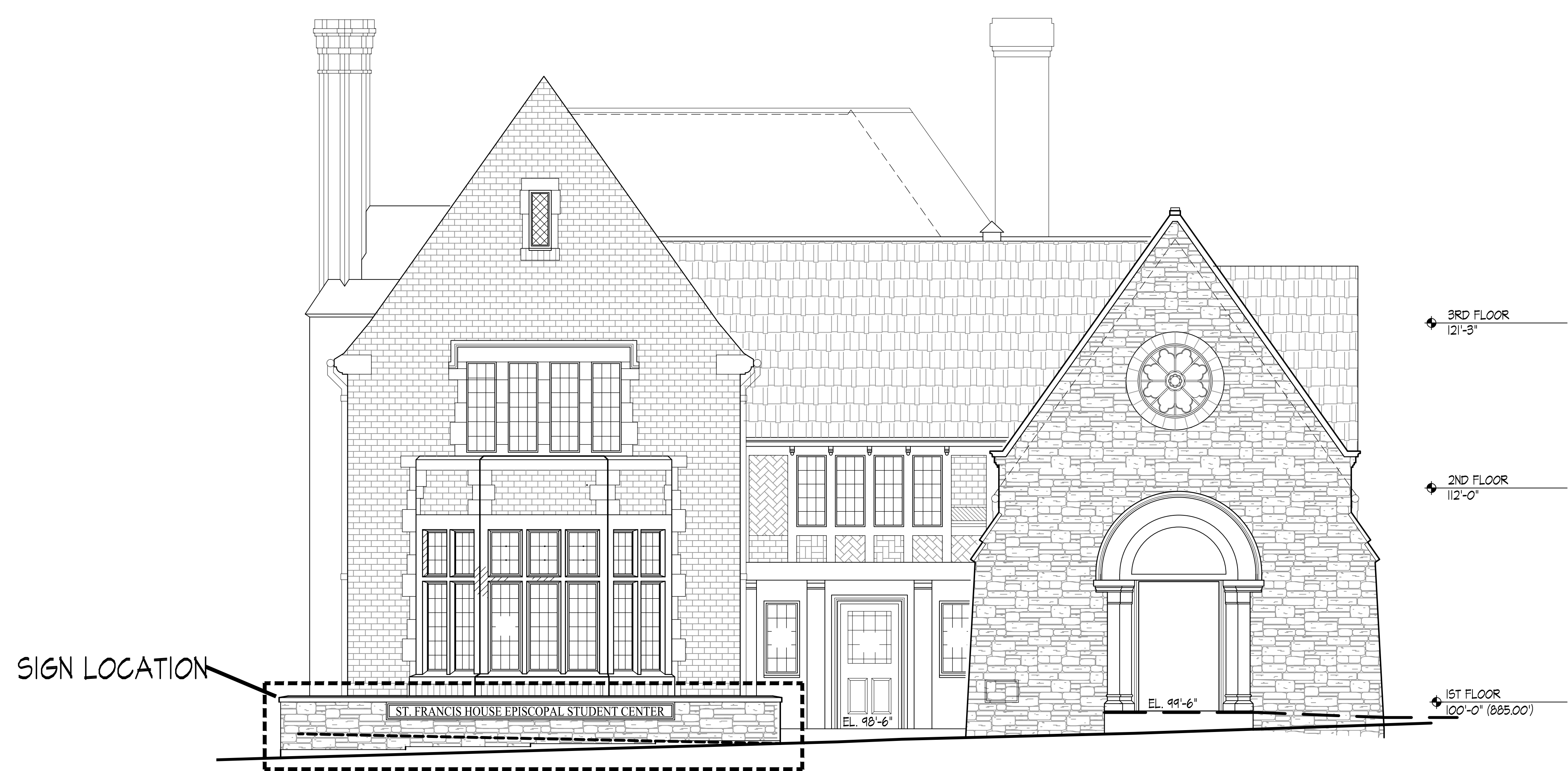
NORTH ELEVATION (ALONG UNIVERSITY AVE) 1/4" = 1'-0"

Revisions Issued for UDC -Sign Review- March 27, 2013