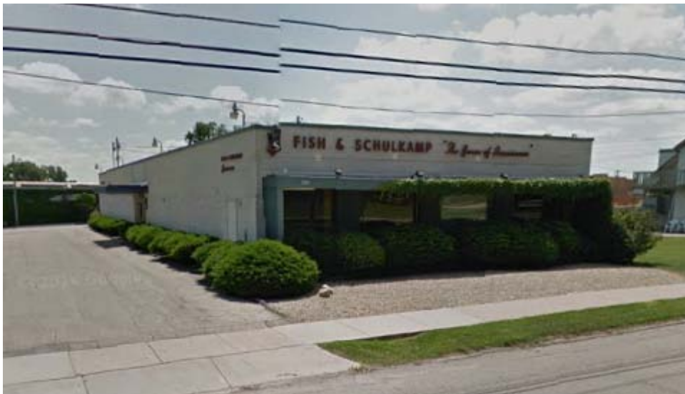
Google street view of 2117