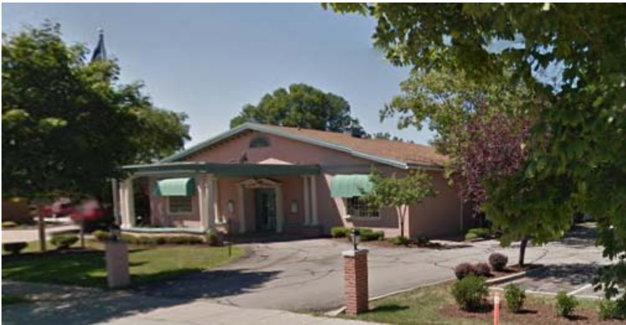
Google street view

Commercial building (restaurant) built in 1950.