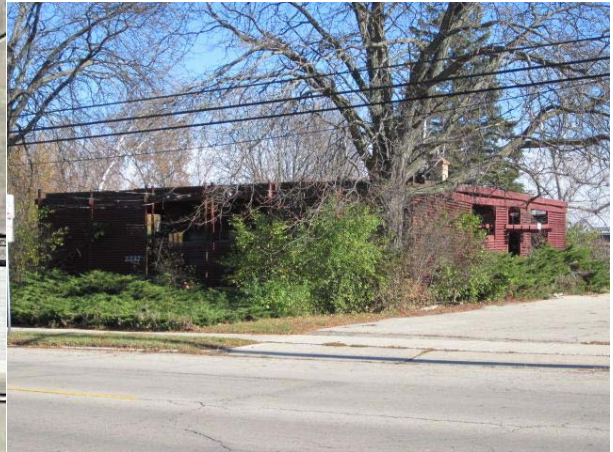
City of Madison Assessor's photograph (approx. 15 years old)