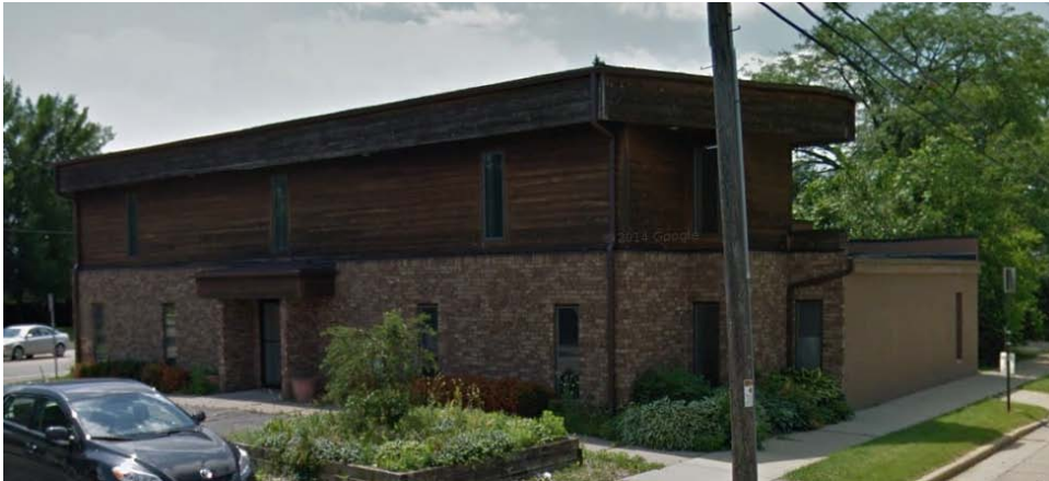
Google street view of 2241