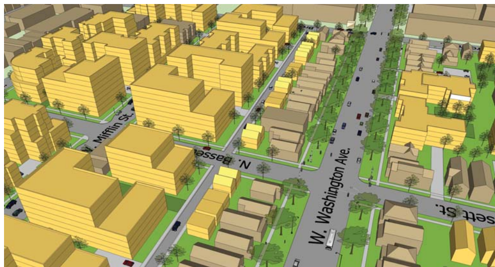
West Washington Avenue Aerial View