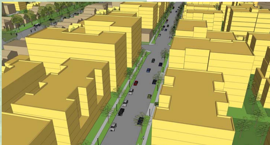
Mifflin Street Looking West Aerial View