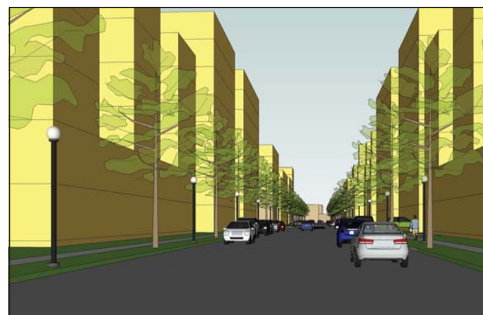
Mifflin Street View