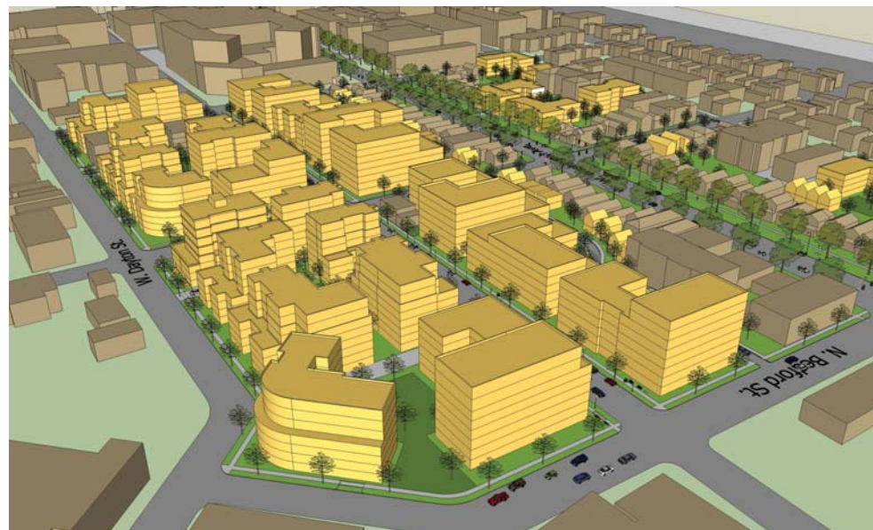
Dayton & Bedford Streets Aerial View