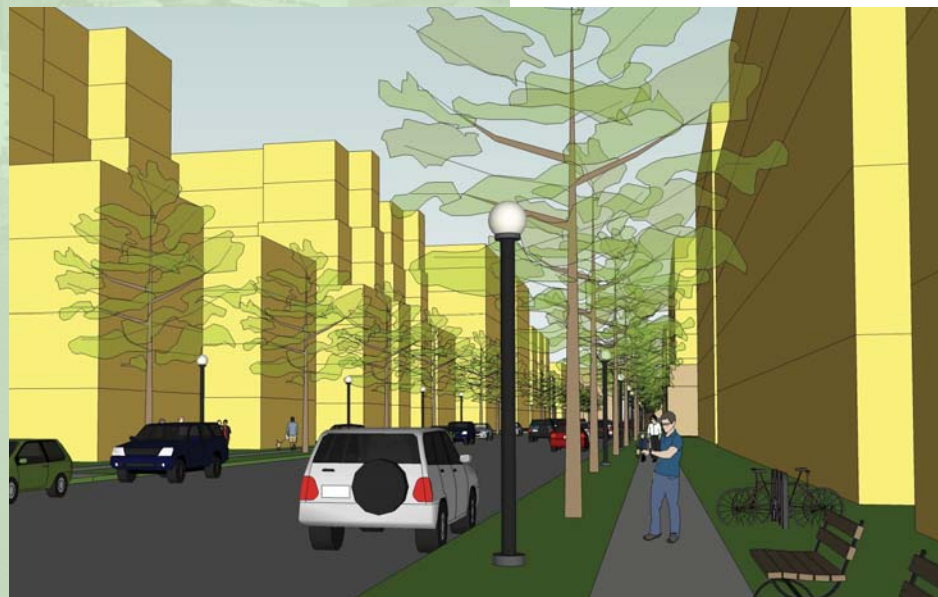
Mifflin Street Looking East Street Level View