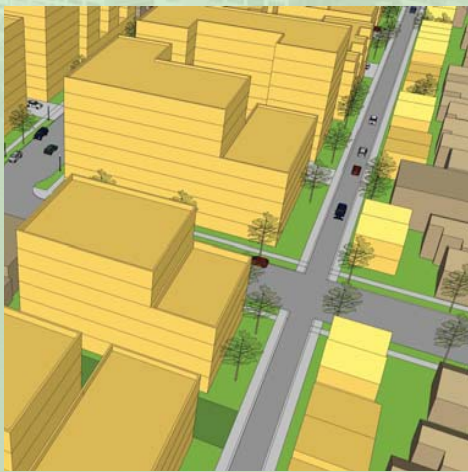
Urban Lane Aerial View