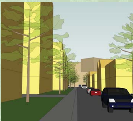
Urban Lane Eye Level

A complete redevelopment approach to Dayton & Mifflin Streets, including an urban lane. Conservation of homes along West Washington Avenue.