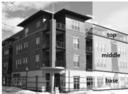
Figure D7: Building Articulation