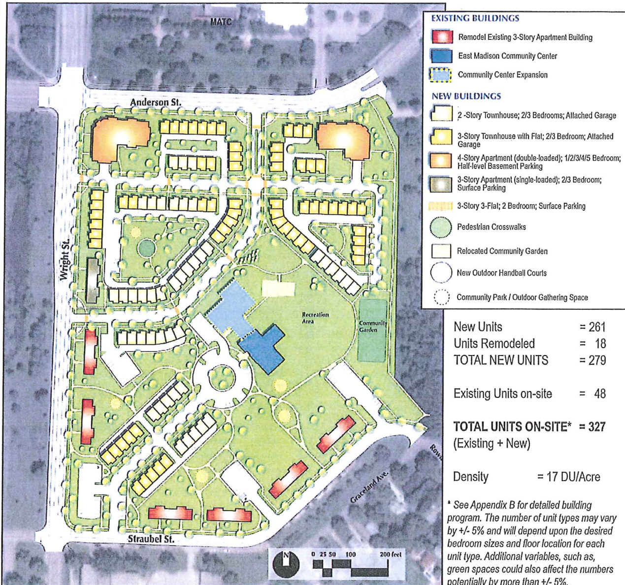
Preferred Master Plan