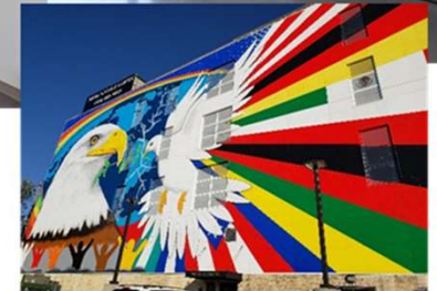
MERCANTILE LOFTS- 36 Units Market Rate/Office/Commercial 611 West National Avenue, Milwaukee, WI