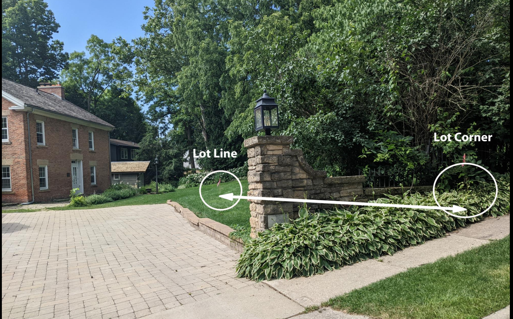
View of the OST from Spring Trail. The proposed house would be 13 yards from the lot line, on the slope above the OST.