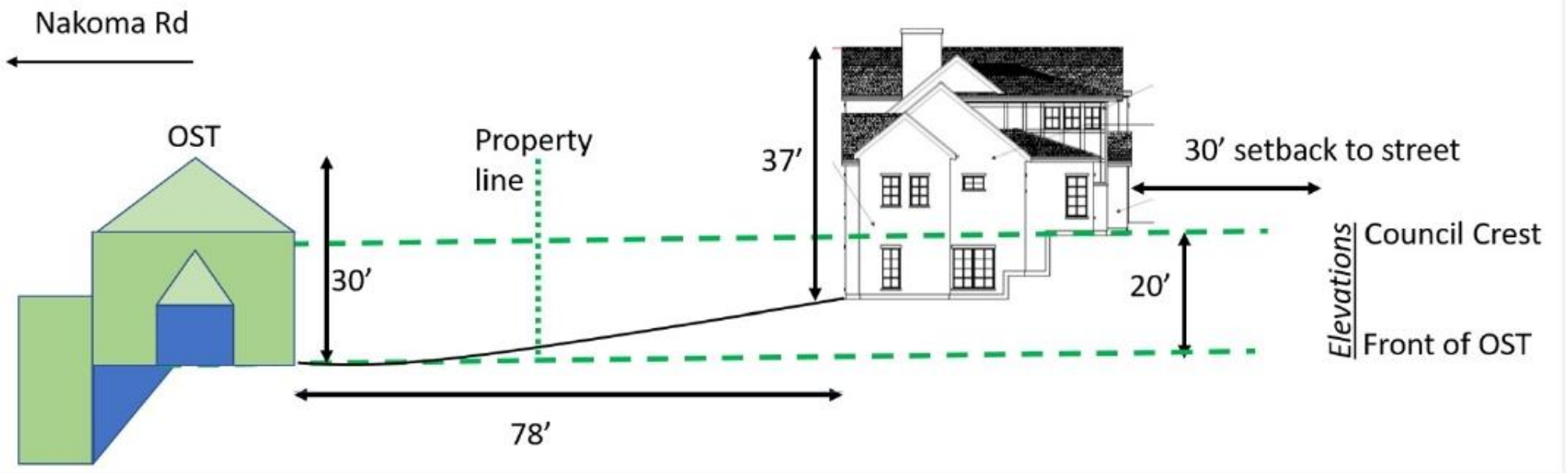
Side view of OST and proposed house from Spring Trail