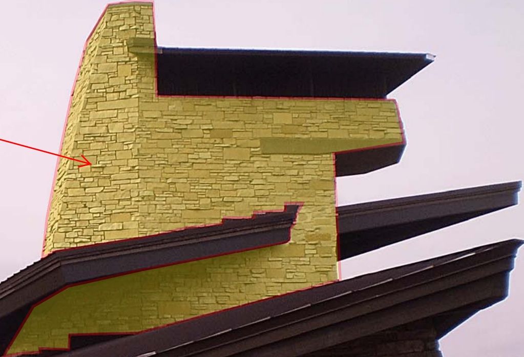
Garner Park Masonry Repairs-2013