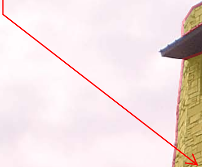
Garner Park Masonry Repairs- 2013