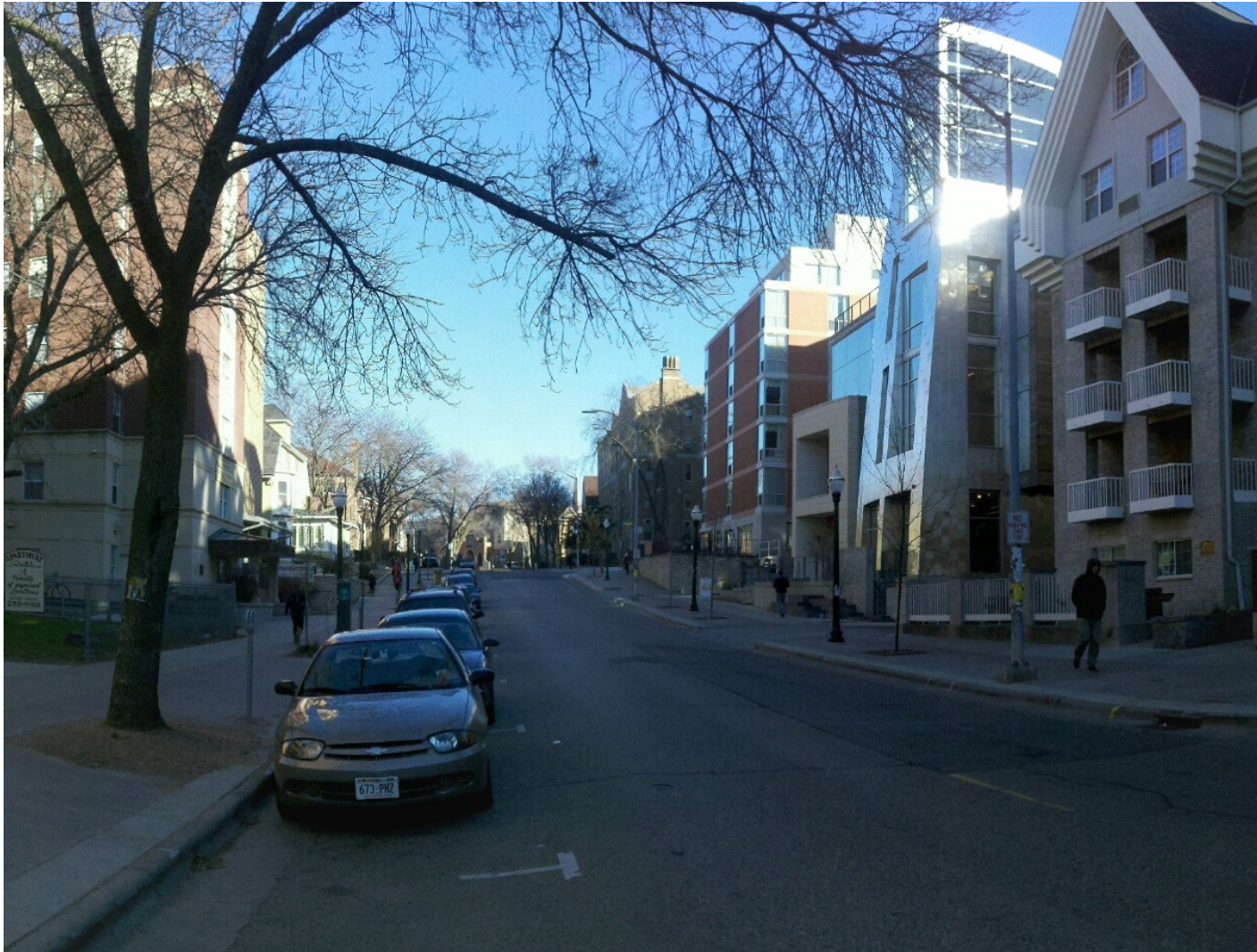
Entrance to Langdon Street: 614 Langdon on the left, Hillel Building on right.