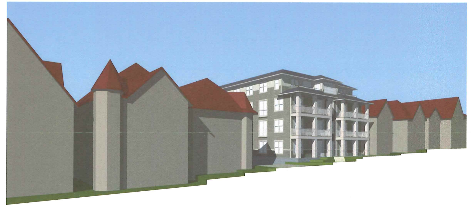
Views Down North Butler