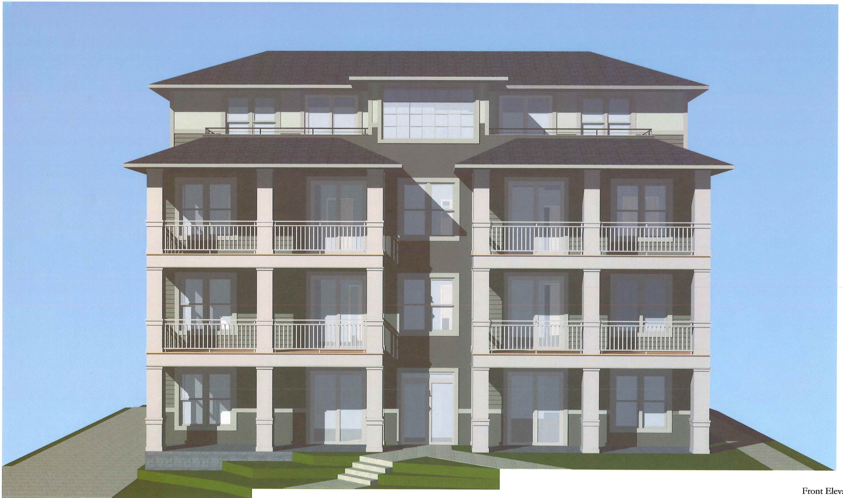
Front Elevation 121 North Butler September 16, 2018