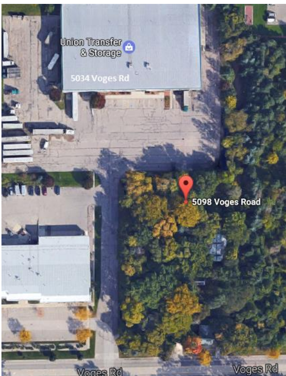
Google Earth (street view unavailable)