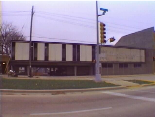
City Assessor's Office

Commercial building constructed in 1948, remodeled in 1964