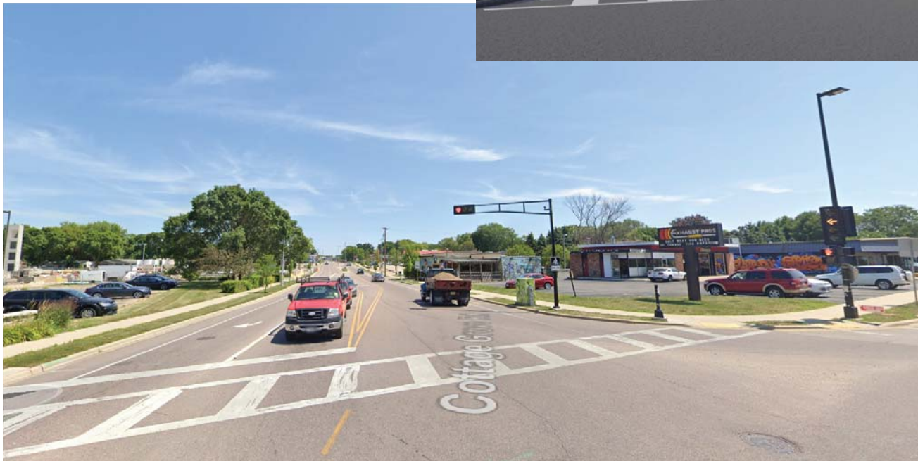
Existing Gateway to the Neighborhood