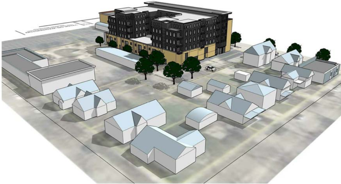
○ SOUTH PERSPECTIVE