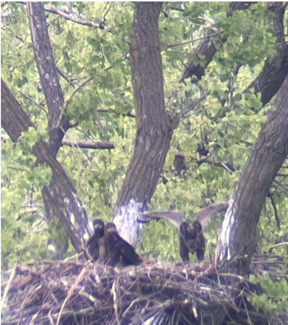
Warner Park Nest, 5/6/2024