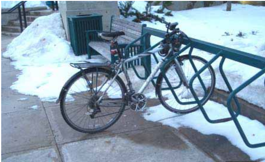
Bike Rack in Winter.