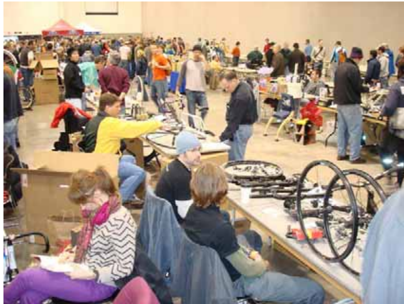
Cronometro's annual bike swap for the Brazen Dropouts Racing Club.