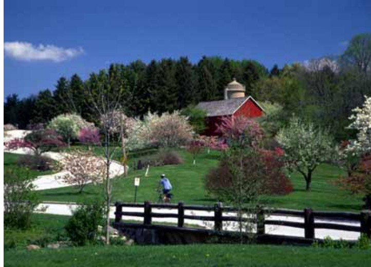
Rural Biking Scene.