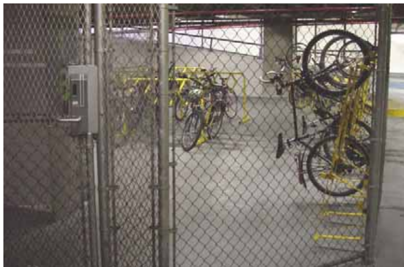
Bike Cage.