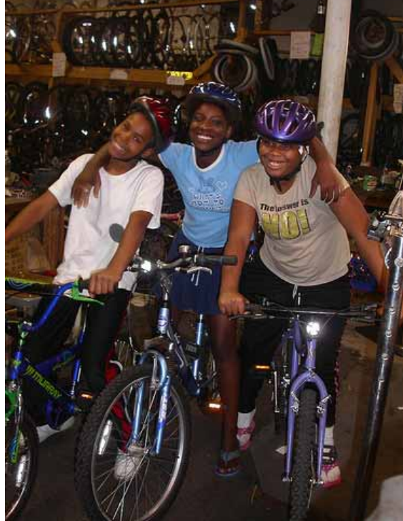
Some Madison girls pick up their Earn-a-Bikes.