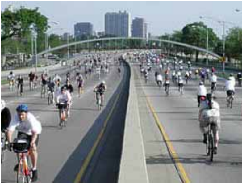
Bike the Drive in Chicago (an event similar to Sunday Parkways).

Resources: Staff, police time, and volunteers