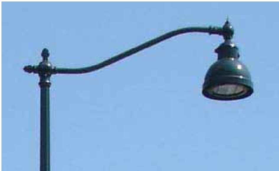
Cut off lighting on E Washington Avenue.

Resources: Staff time and cost of sign installation