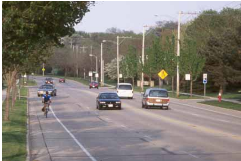
Bike lanes are a typical improvement for arterial streets.