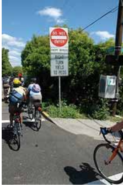
Bike Boulevard.