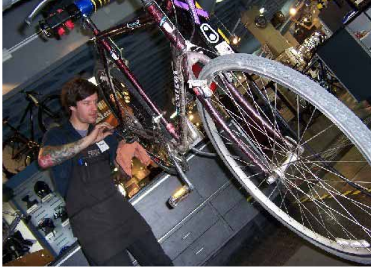
A mechanic at a Madison bike shop.