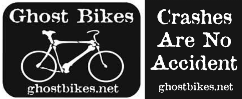
Ghostbike Project.