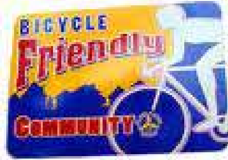
Example of Bicycle Friendly Community Sign. Image: http://www.noaca.org/Bfc.jpg