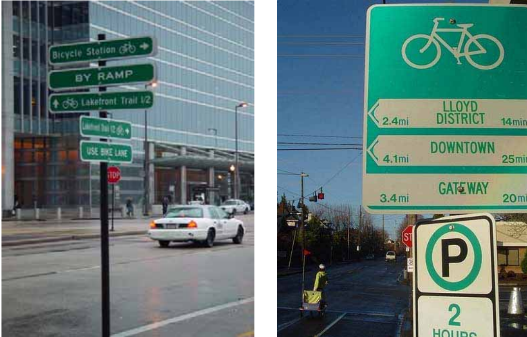
Examples of Destination Based Bike Network Signs (Chicago left, Portland right).