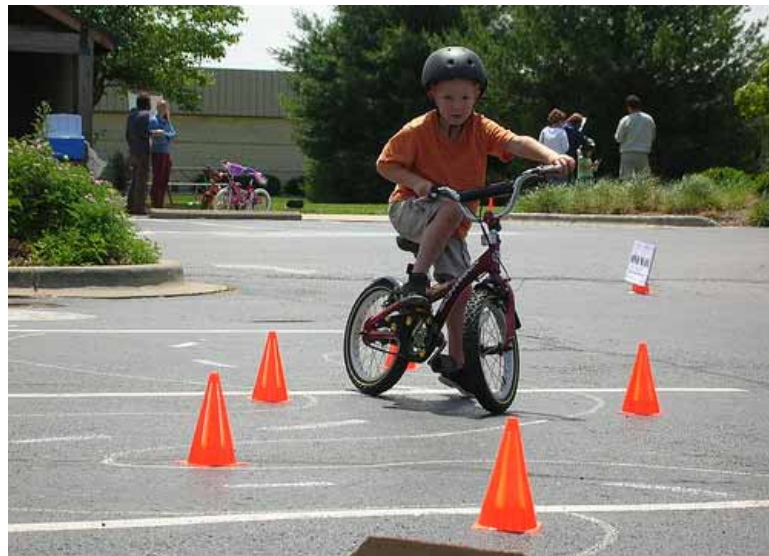
A child learns better bicycling techniques.

Resources: Depends on level of program implemented