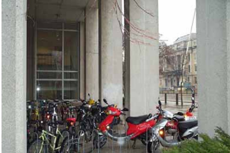
Mopeds parked at bike racks.