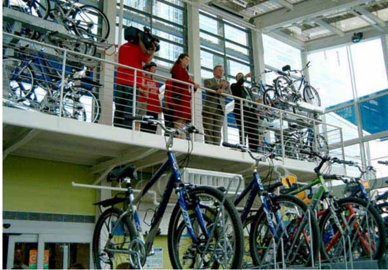
Bike Station.