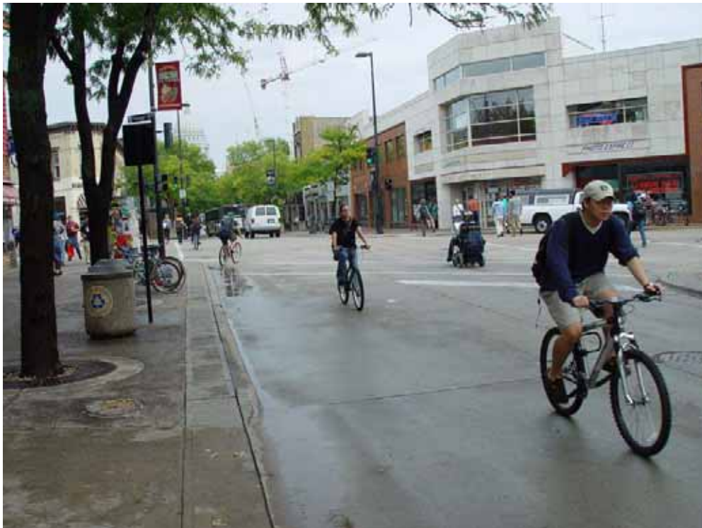
Madison’s State Street, which is closed to through automobile traffic.

Madisonians enjoy and value a high quality of life. Better conditions for bicycling and walking have tangible and intangible benefits to the quality of life. In cities where people can regularly be seen out bicycling and walking, there is a palpable sense that these are safe and friendly places to live and visit. Bicyclists are an indicator of quality of life, the proverbial “canary in the coalmine.” A contributing factor towards preserving and improving Madison’s high quality of life is making the City even more friendly to bicycling.