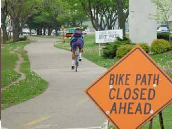
Bicycle Route Detour Sign.