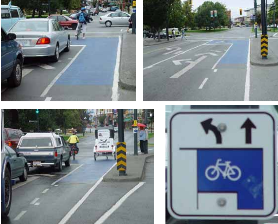
Bike Box, Victoria, BC.