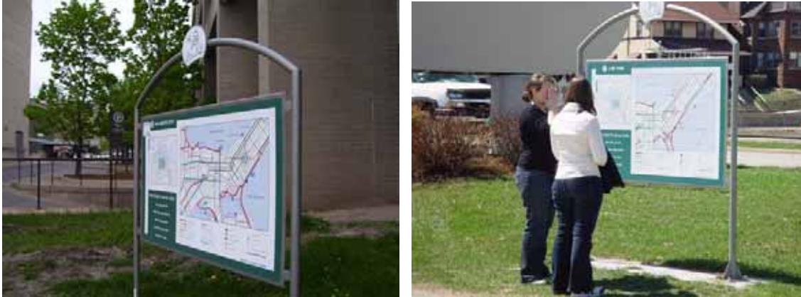
Wayfinding signs.