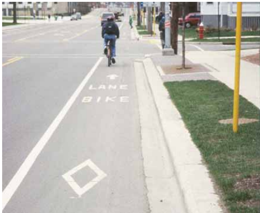
A complete street in Madison.

Madison has made many positive strides toward complete streets over the years, but now it is time to formalize the policy and implement it in a manner that will make our community a leader in the nation.