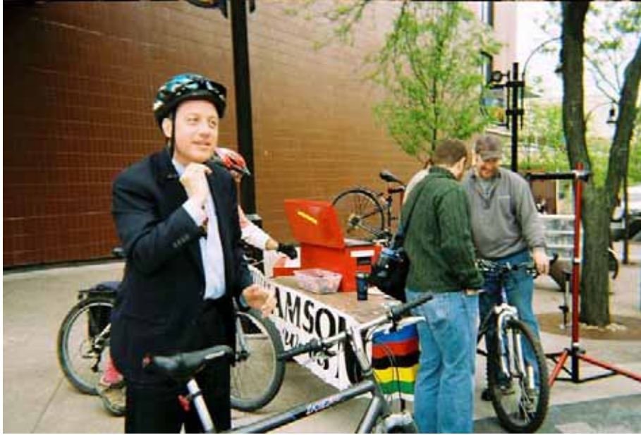
The Mayor arrives at Bike to Work Week press conference.