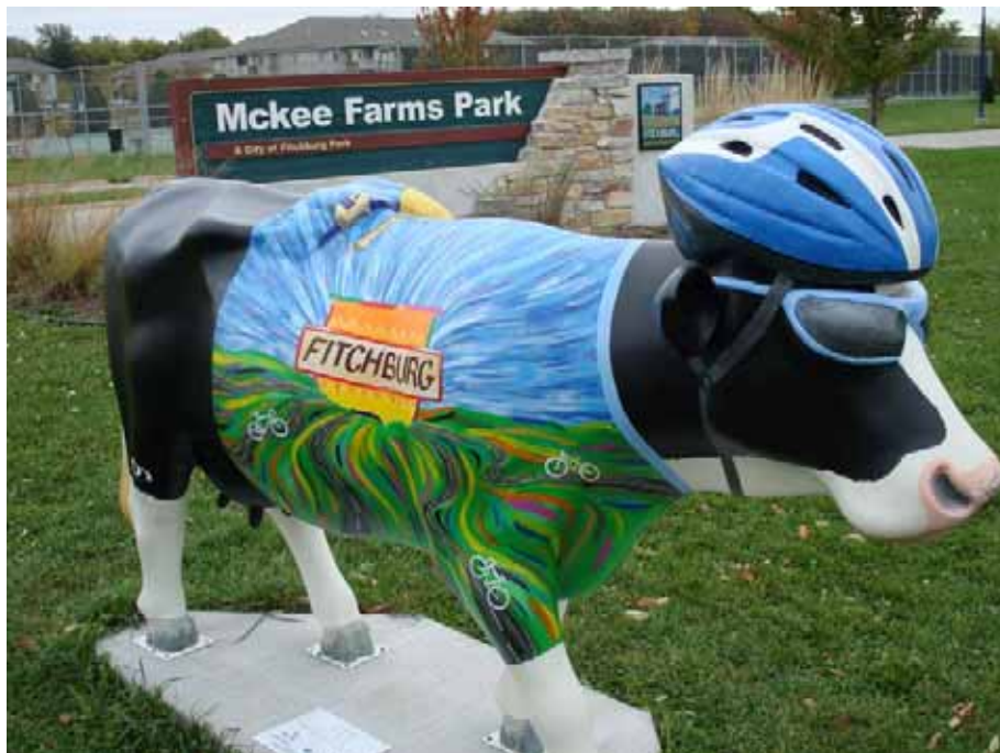
Fitchburg Bicycling Art Cow.

Finally, Madison is home to a significant percentage of the nation's bicycling industry. Improving bicycling conditions will increase the number of bicycle riders, and thus increase the direct and indirect positive economic impacts of the bicycling industry on the local economy.