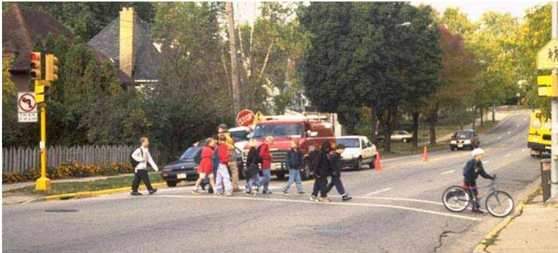
Kids heading to school.

Over the last several years an international movement has developed called Safe Routes to School, which seeks to improve children's ability to bike or walk to school by improving engineering, enforcement, education, encouragement, and evaluation. Though Safe Routes to School is a program or a combination of programs and policies that can be implemented, the Platinum Committee felt that it is also a theme that should be considered whenever improvements for bicycling and walking are discussed or made. All of the components of Safe Routes to School are incorporated in this report, though they are not always directly identified as such.