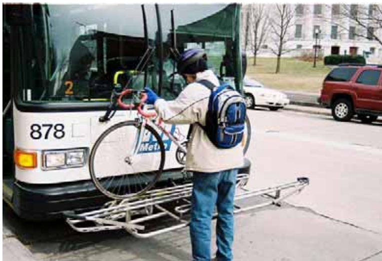
Bike Rack on Madison Metro Bus.