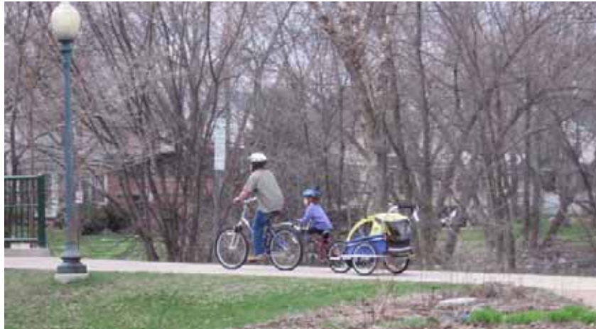
A family bicycles on Madison's east side.

Resources: Funding to come initially from the corporate sponsorships of the Platinum Committee. If successful, seek additional funding from the city or businesses