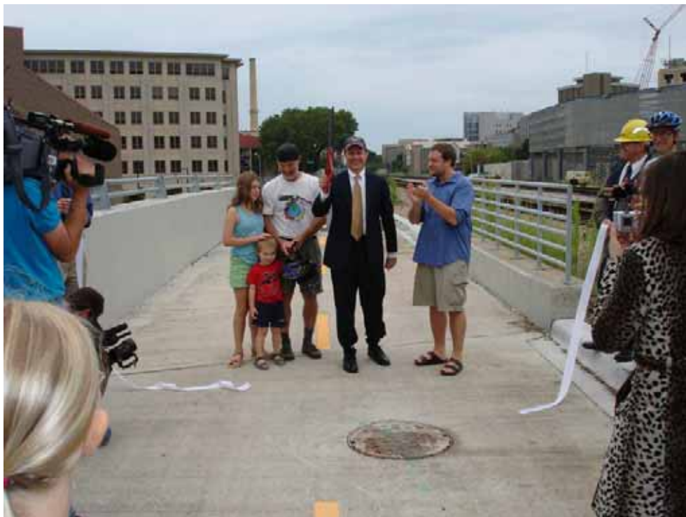
The Mayor cuts the ribbon at opening of “The Missing Link” path.

All of the great cities for bicycling (places like Boulder, Portland, Davis, Copenhagen, and Amsterdam) have become great cities for bicycling because of the visionary actions of citizens and government. The time is ripe for Madison to become the best city in America for bicycling. This report outlines how to build upon the excellent work which has already been accomplished through the efforts in the public and private sectors over many years in order to move towards becoming a Platinum Level Bicycle Friendly Community and beyond. It is up to the citizens of Madison to make it happen.