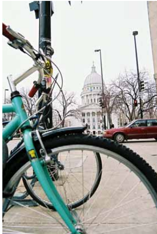
Bikes around the capital building..