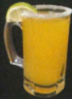
TYPICAL Salt and lemon