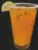
PASION Passion fruit, sprite, salt and lemon