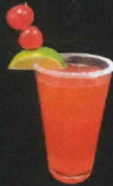
CHERRY cherry juice sugar and lemon