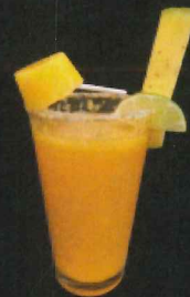
MANGO mango Biche, lime, salt and sprite