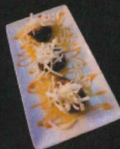
BREVAS CON AREQUIPE Figs with caramel and cheese