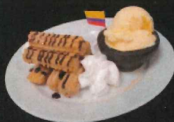
CHURROS CON HELADO