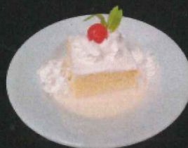
TRES LECHES Three milk cake