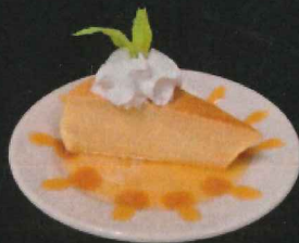
FLAN Caramel flan