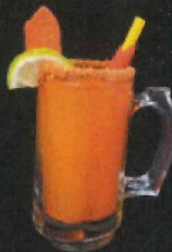
HOT Tajin, lemon, chamoy and hot sauce