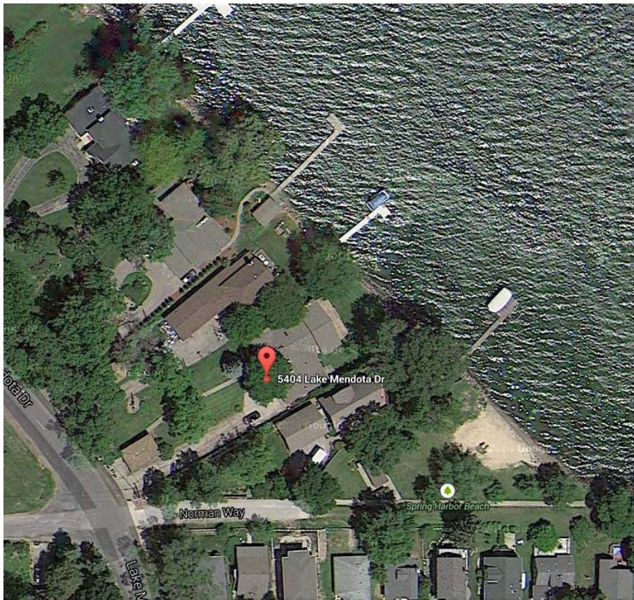
Google aerial view

Single family residence. Constructed in 1948.