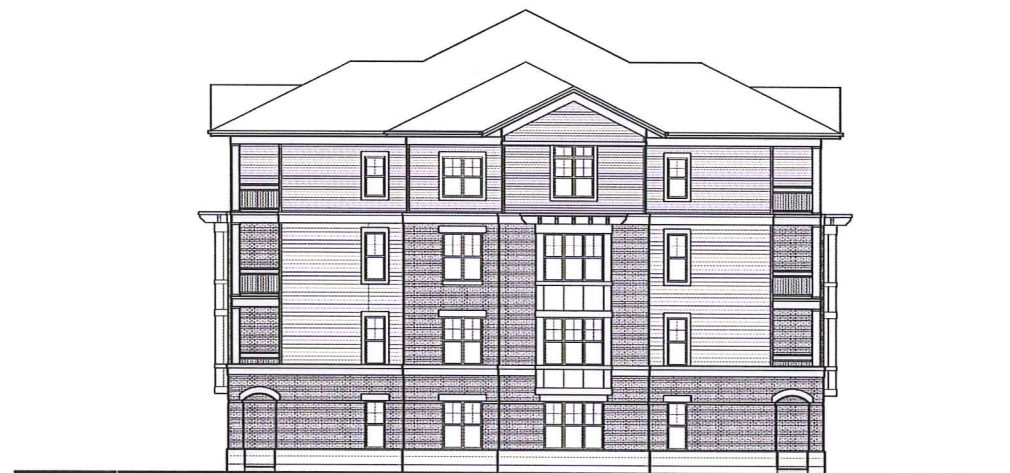
END ELEVATION 3/8" = 1'-0"