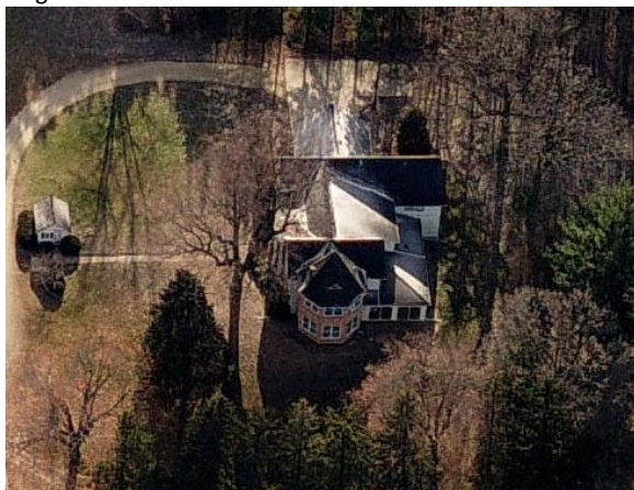
Bing aerial view