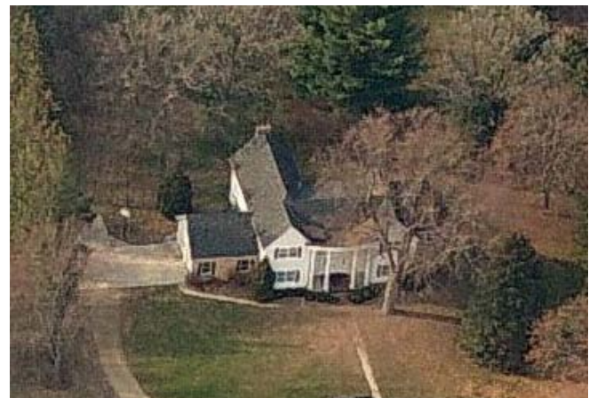
Bing aerial view