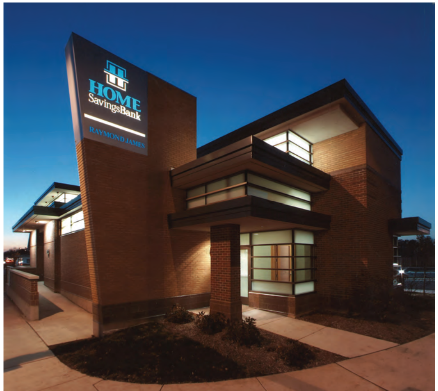
Home Savings East