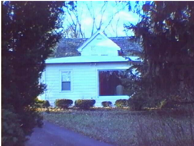
City Assessor photo (approximately 15 years old)

5501 Greening Lane Single-family residence, built in 1920