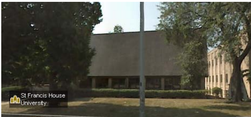
Google street view images