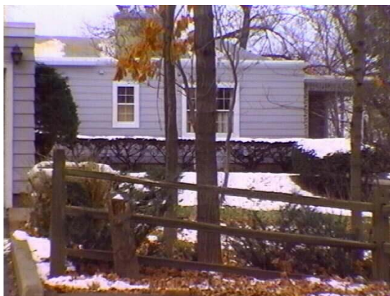
City Assessor photo (approximately 15 years old)

401 Woodward Dr Single family house, built in 1929