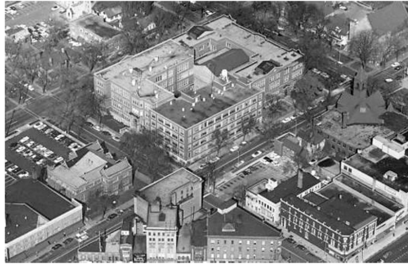
Figure 7. 1964 Aerial Photography looking north, City of Madison, On file at the Wisconsin Historical Society Archives.