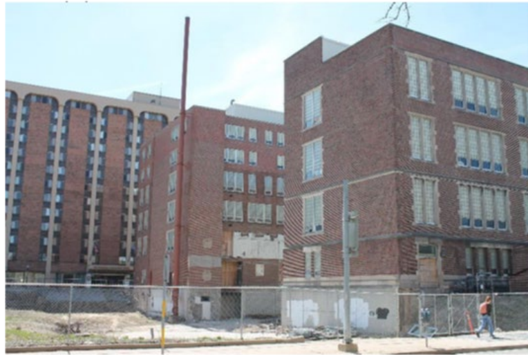
Figure 2. Photo 1 looking south