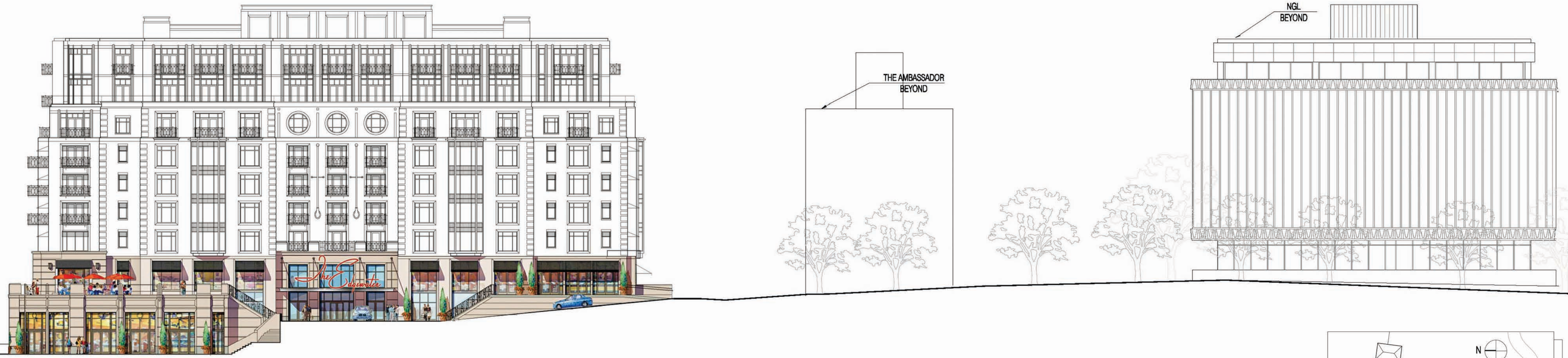
2 Illustrative Building Base Elevation SCALE: 1"=20'-0"

Landscape Architect: Ken Saiki Design, Inc. 303 S. Patterson, Suite One Madison, WI 53703