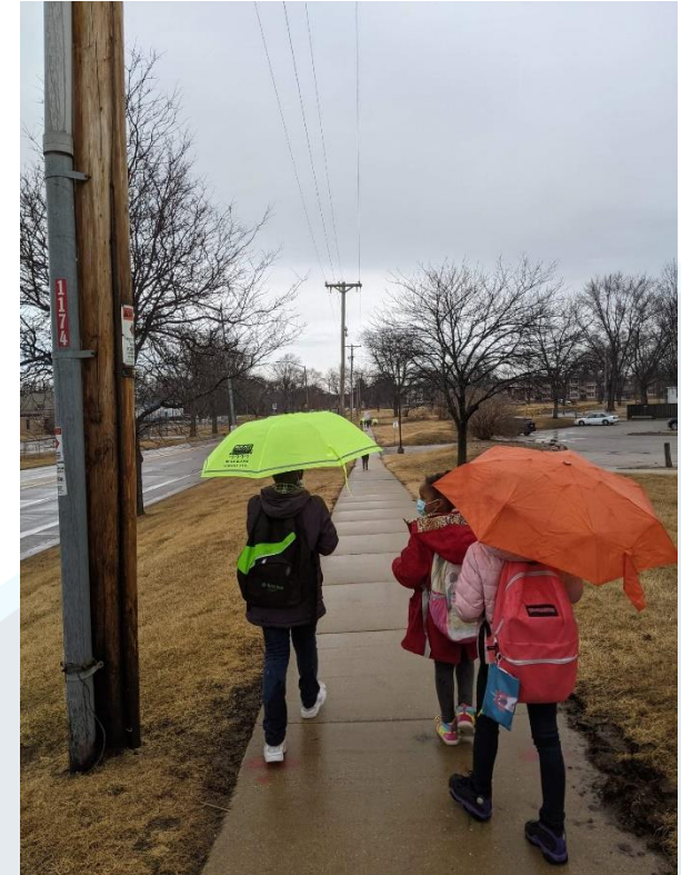
Photo of a walking school bus on a rainy day with people carrying brightly colored umbrellas