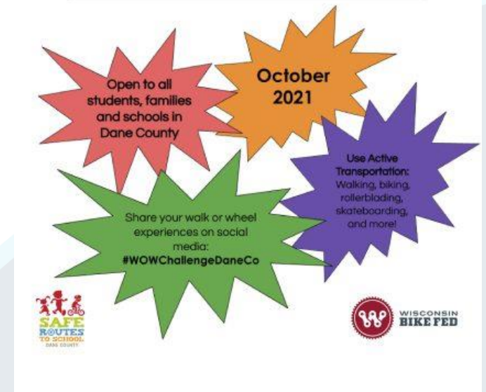
Graphic of 2021 Walk or Wheel Challenge Poster with info on when it happens, who can participate, and how to participate.