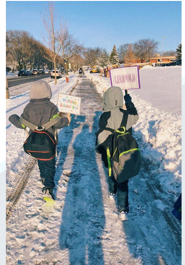
Photo of 2 children on the Leopold Walking School Bus holding signs and walking in the winter.